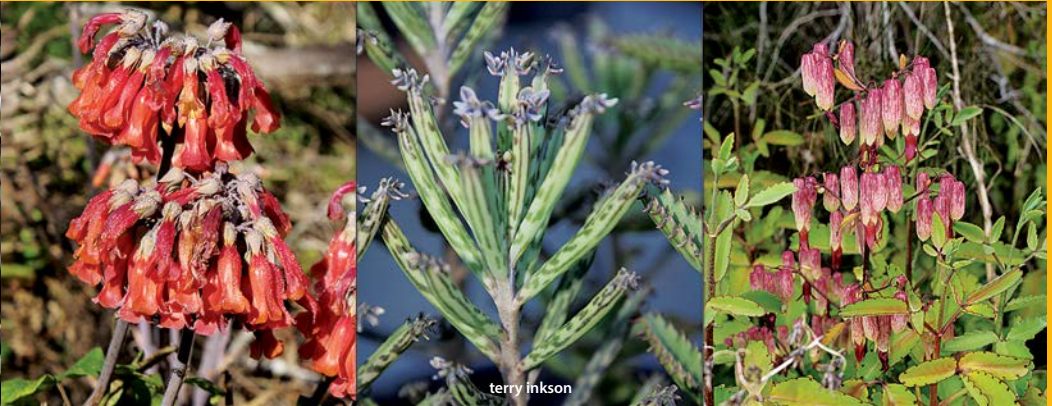
Mother of Millions