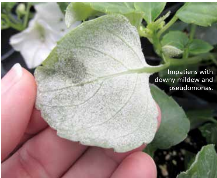
Impatiens with downy mildew and pseudomonas.