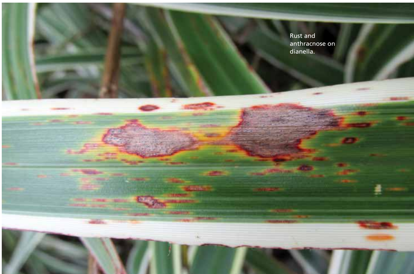
Rust and anthracnose on dianella.

* Indicates a product that contains more than one active ingredient in a pre-pack mixture.