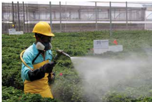
When spraying pesticides (insecticides and miticides), be sure to rotate modes of action to avoid insect or mite pest populations developing resistance.

Another strategy is to rotate pesticides with specific modes of action