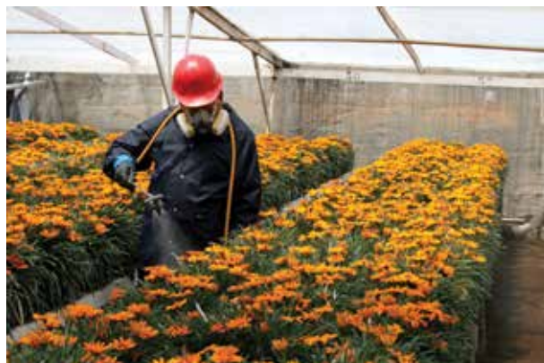
Use an insecticide or miticide with the same mode of action within an insect or mite pest generation before switching to another insecticide or miticide with a different mode of action.

with those having non-specific, multiple or broad modes of activity, such as insect growth regulators, insecticidal soaps, horticultural oils, selective feeding blockers, beneficial fungi and bacteria, and micro-organisms. The use of pesticides with broad modes of activity may reduce the rate at which insect or mite pest populations develop resistance. However, be sure to rotate insect growth regulators with different modes of action since certain insect pests, including aphids and whiteflies, have developed resistance to a number of insect growth regulators.