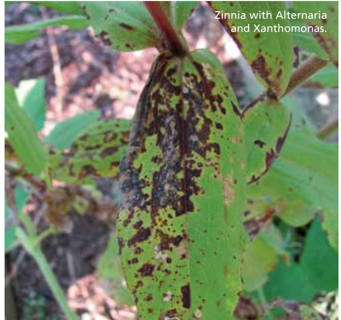
Zinnia with Alternaria and Xanthomonas.