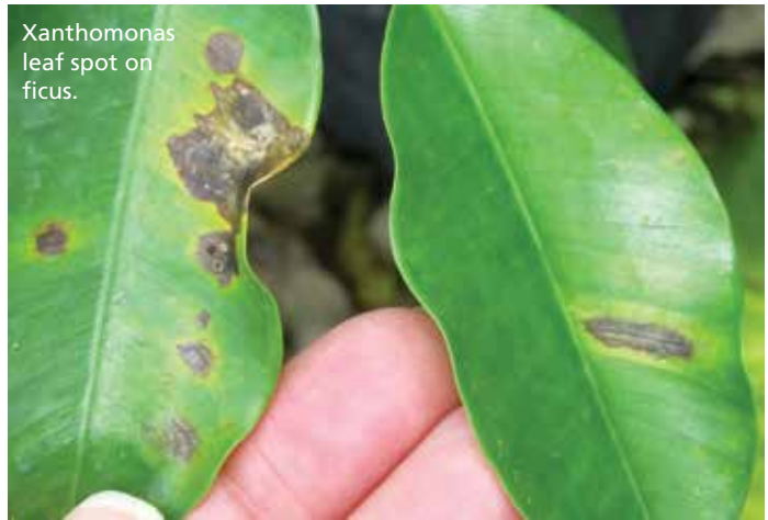
Xanthomonas leaf spot on ficus.

Pythium Fungicide Rotation: The products that work best for Pythium include Subdue MAXX (4 – resistance is a big concern), etridiazole (14 - like Terrazole) and Segway O (21). All of these are reasonably effective at "curing" Pythium root rot as long as you also improve the growing conditions a little—warmer, less water and less fertilizer help. Some of the other newer products are labeled for Pythium, but our trials haven't yielded enough control for me to include them in a rotation. Phosphonates have been used for Pythium control for many years, but our trials have shown efficacy against Pythium only