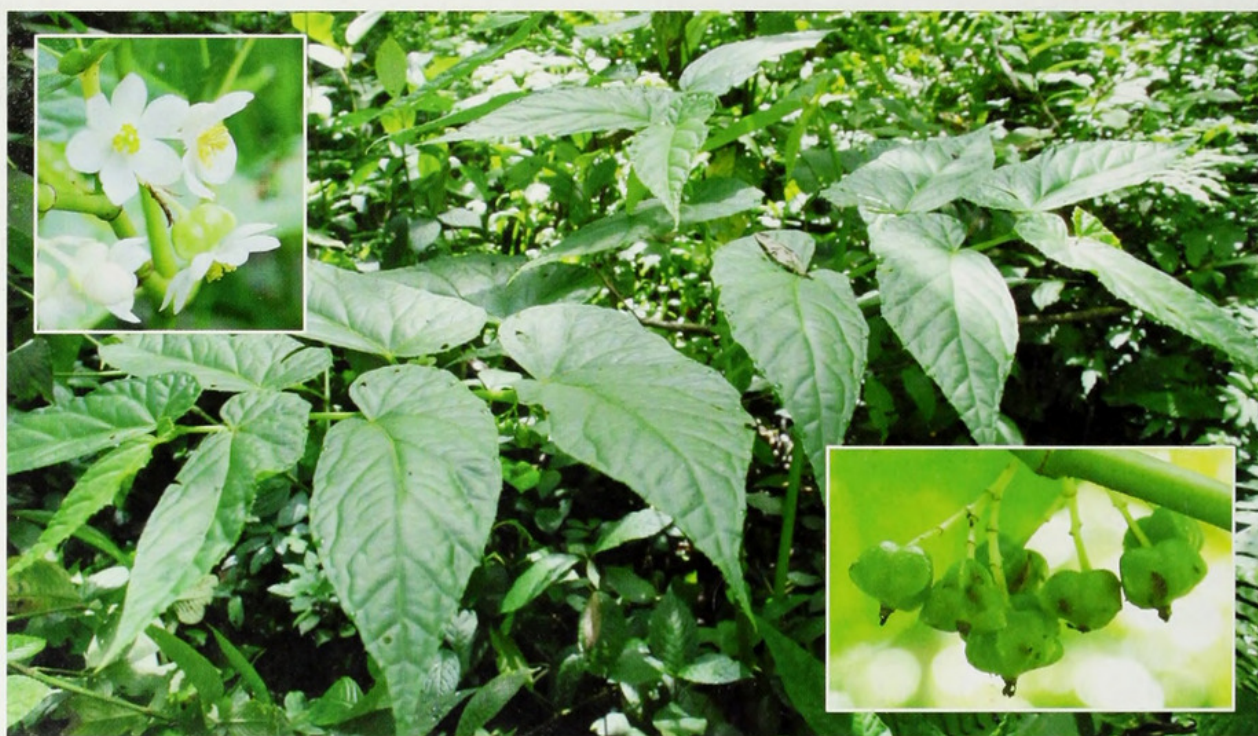
Fig. 1. Begonia longifolia habit (main photo), female and male flowers (inset top left) and ripening fruit (inset bottom right). All from one plant, Gunung Sorik Merapi, North Sumatra.

female flowers open at the same time; bracts caducous, lanceolate, 6\text{--}12 \times 2\text{--}4 mm; primary and secondary peduncles stout, distinctly swollen near the nodes, 2 mm thick, primary c. 1 cm long, secondary shorter, each unit consisting of 1 male and 2 female flowers, (3–)7–15 flowers in total, bracteoles often present on terminal female flowers, bracteoles 5 \times 1\text{--}2 mm. Male flowers: pedicels 25–30 mm; tepals 4, white; outer 2 elliptic-orbicular, slightly cup-shaped, fleshy, with a thinner rim, 10\text{--}12 \times 8\text{--}9 mm; inner 2 spatulate-elliptic, 9\text{--}10 \times 6\text{--}7 mm; androecium symmetric, a loose globose cluster; stamens bright yellow, 35–90, subequal; filaments slightly shorter than the anthers, more so for the outer stamens; anthers c. 2 mm long, linear with a rounded tip, dehiscing through lateral slits running almost the entire length of the anther. Female flowers: pedicels 7–12 mm; ovary pale green, fleshy, lobed-triangular in cross-section, c. 7\text{--}9 \times 10 mm, with three ridges or small fleshy wings on the lobes, 3-locular, placentae bifid; tepals (rarely 4–)6, white, elliptic-spathulate, subequal, 8\text{--}14 \times 5\text{--}7 mm; styles 3, greenish yellow, deciduous, bifid, c. 4 mm long, papillose surface spirally twisted. Fruit borne in clusters of (1–)2–15, green, fleshy, globose-triangular, pendulous on a stiff pedicel, 10–14 mm diameter, apex sometimes slightly extended. (Fig. 1)