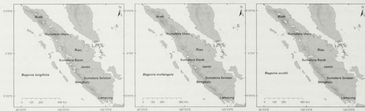
Fig. 2. Distribution of Begonia longifolia (left), B. multangula (middle) and B. scottii (right) on Sumatra.

500–1500 m, though most collections are from 900–1200m (Fig. 2). On steep banks, often near streams, in primary or secondary forest. IUCN category Least Concern.