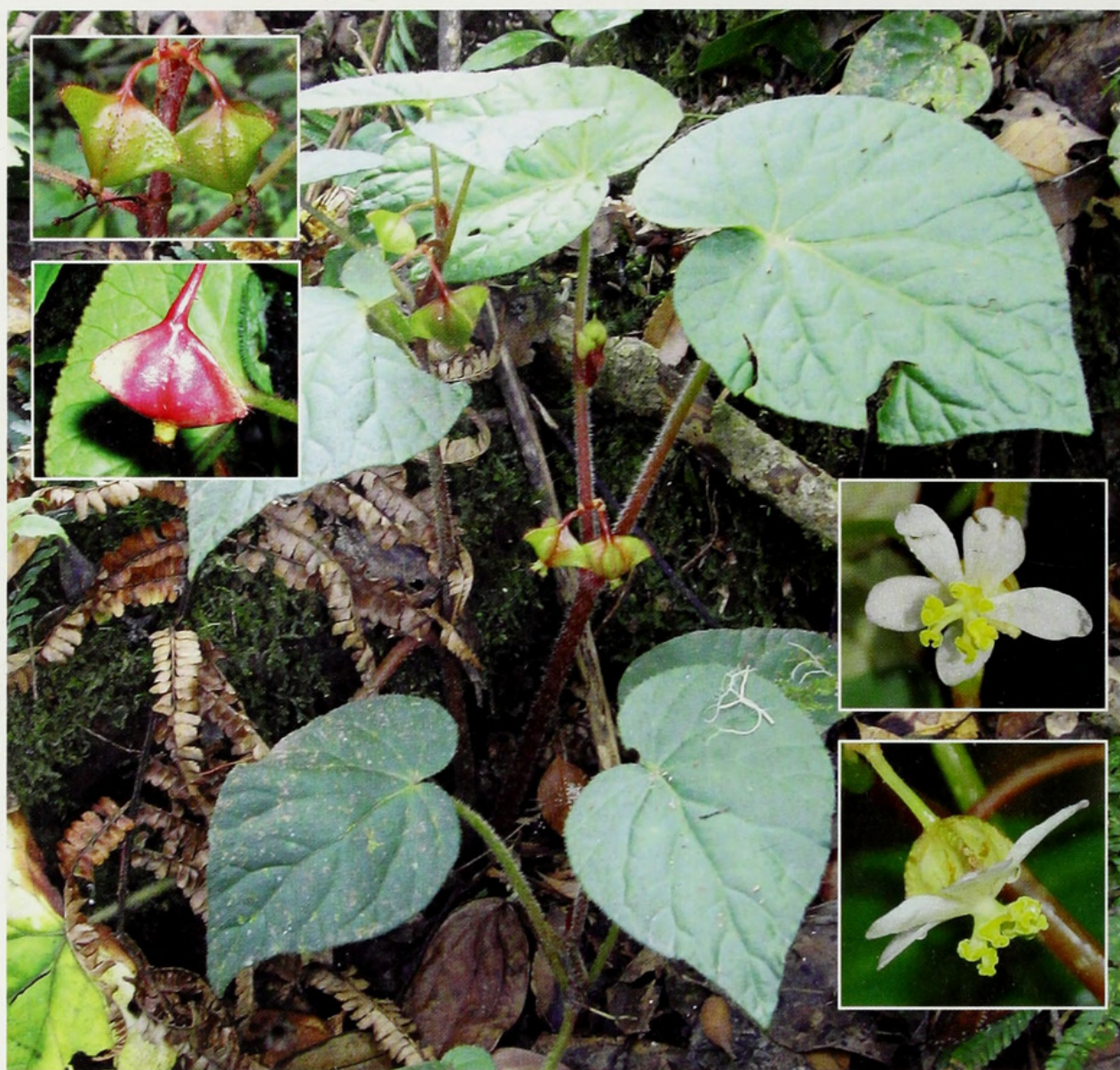
Fig. 4. Begonia scottii habit (main photo) and fruits from Gunung Merapi, West Sumatra (inset top left) and from Gunung Kemiri, Aceh (inset lower left). Female flower and ovary (inset right and bottom right) from Gunung Sorik Merapi, North Sumatra.