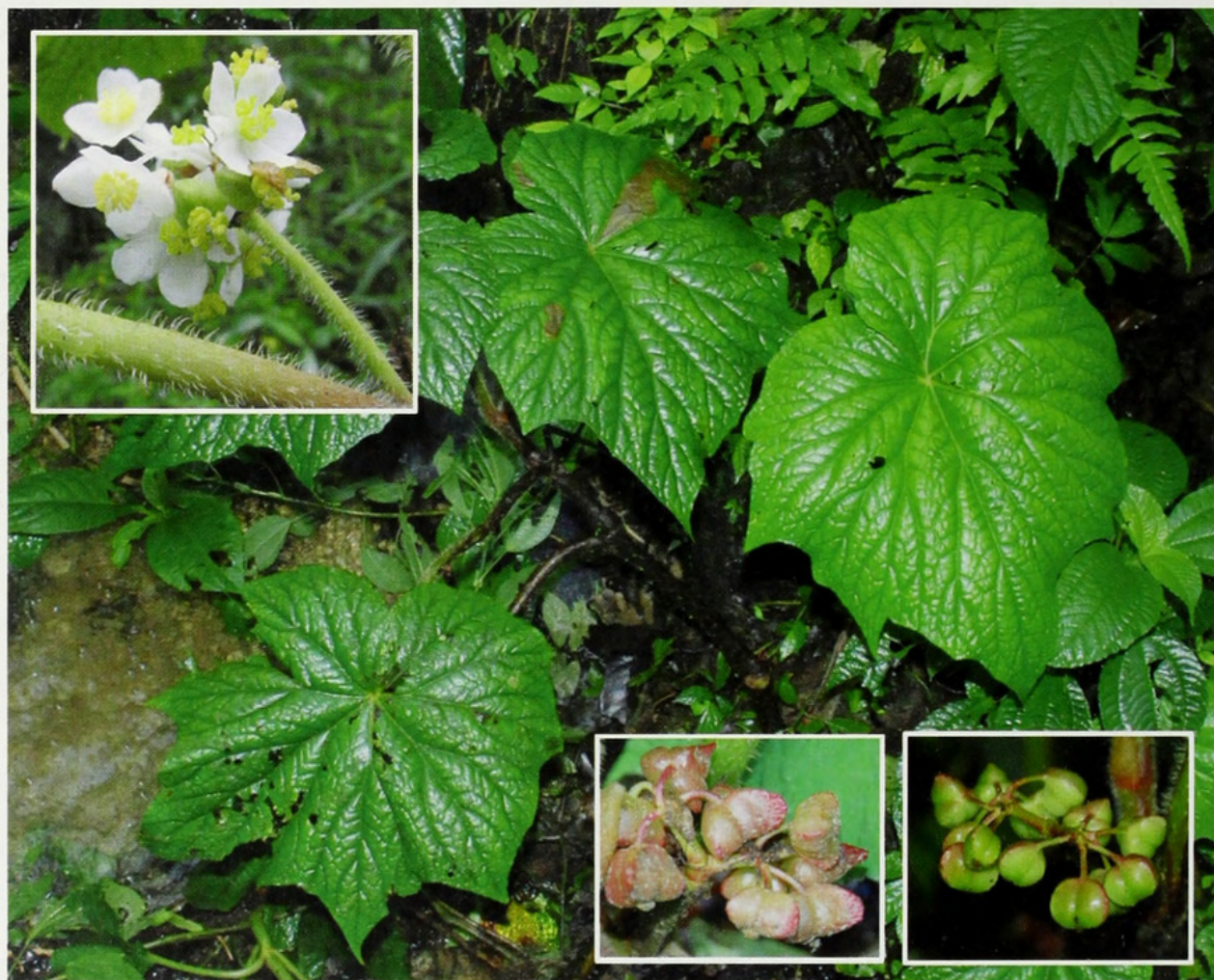
Fig. 3. Begonia multangula habit (main photo), inflorescence (inset top left; Gunung Merapi, West Sumatra) and fruits (insets, bottom). Habit and fruit photographs from Pantai Cermin, West Sumatra.

Ecology and distribution. Sumatra, Java, Lesser Sunda Islands. Within Sumatra, Begonia multangula is found in the mountains of the West and North at altitudes of 700–2500 m, with most collections being from around 1200–1600 m (Fig. 2). Sprawling on stream banks and slopes in rain forest. IUCN category Least Concern.