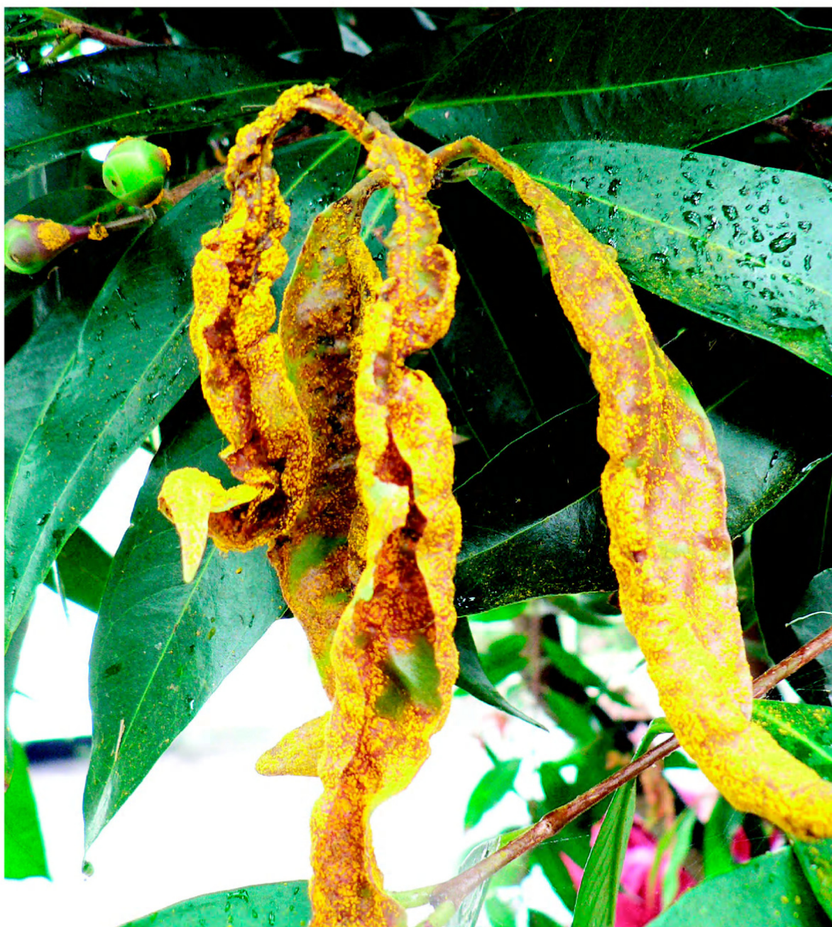
Fig. 1. Uredinial pustules of Puccinia psidii on new growth of cultivated Syzygium jambos (Rose Apple), Brisbane, Queensland, Sept. 2011.

Booth et al. (2000) produced a preliminary assessment of high risk areas for the Northern Territory, Queensland and New South Wales. A revised continental risk-predictive map by Booth & Jovanovic appeared in Glen et al. (2007) (as a pers. comm.; refer Booth et al., 2000, and Booth & Jovanovic, 2012 for the methodology used to develop map) and was reproduced in Plant Health Australia (2009). The latter publication also featured an alternative map (p. 14) by R. Magarey that includes