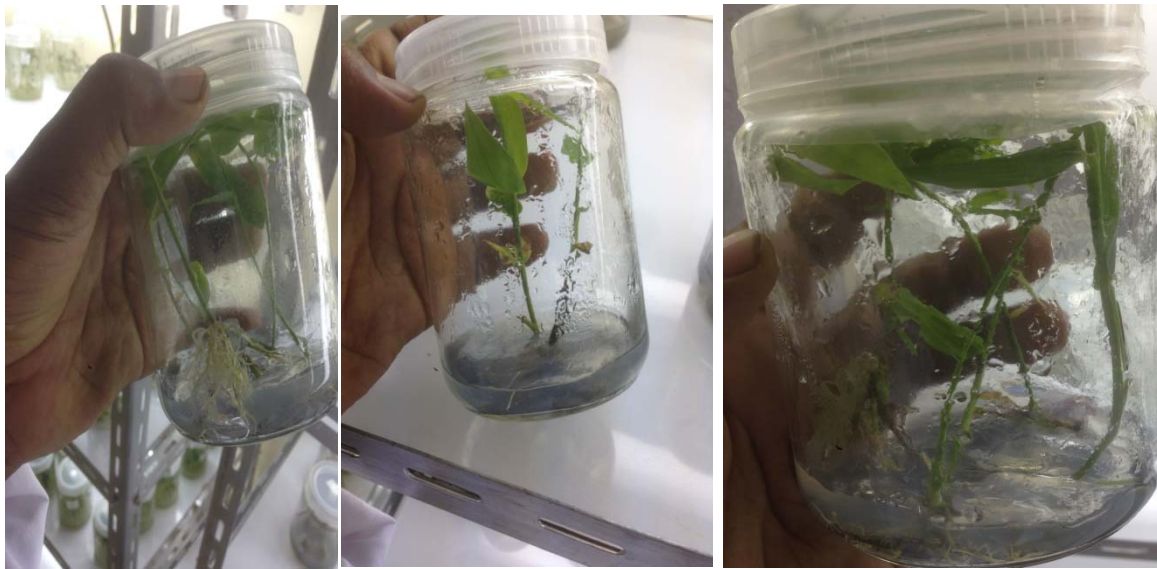
Figure 7. Root formation of Low land bamboo via IBA hormone after one month.