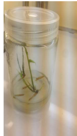
Figure 3. Cultured seed