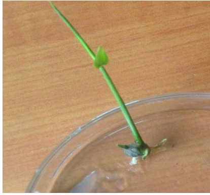
Figure 6. Root formation of Low land bamboo via IBA hormone after a week from single shoot.