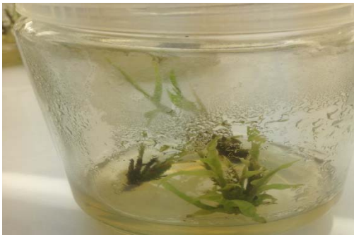
Figure 8. Browning of bamboo leaf due to phenol release.

rate and higher mean shoot number over PGRs free MS medium. Investigated BAP at 0.005 g/L showed a good multiplication rate. The effect of BAP in inducing multiple shoots has already been reported in bamboo species like Arundinaria callosa [33] and Bambusa oldhamii [34]. Interestingly, the synergistic effect of BAP and KN for increased shoot multiplication rate and proliferation was also reported on Bambusa tulda and Melocanna baccifera [35]. The occurrence of phenol exudation at the cut ends of explants was the main problem faced during the multiplication study as shown in Figure 8 . This phenolic exudation delayed the time required for sub-culturing accompanied with gradual browning of the shoots leaf and medium that eventually ends up in death. The IBA was found nice in both rooting percent and number of roots produced, which is in agreement with reports of Parthiban et al. and Diab and Mohamed [36,37].