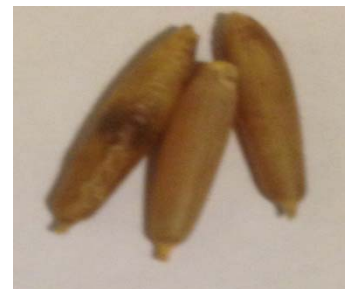
Figure 1. Seeds of Oxytenanthera abyssinica Figure 2. selected healthy seed