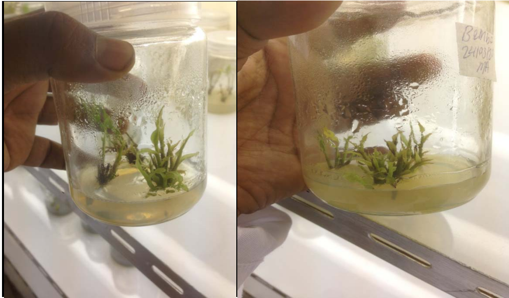
Figure 5. Multiplication of new leaf from initiated seed at 0.004 g /L BAP hormone.