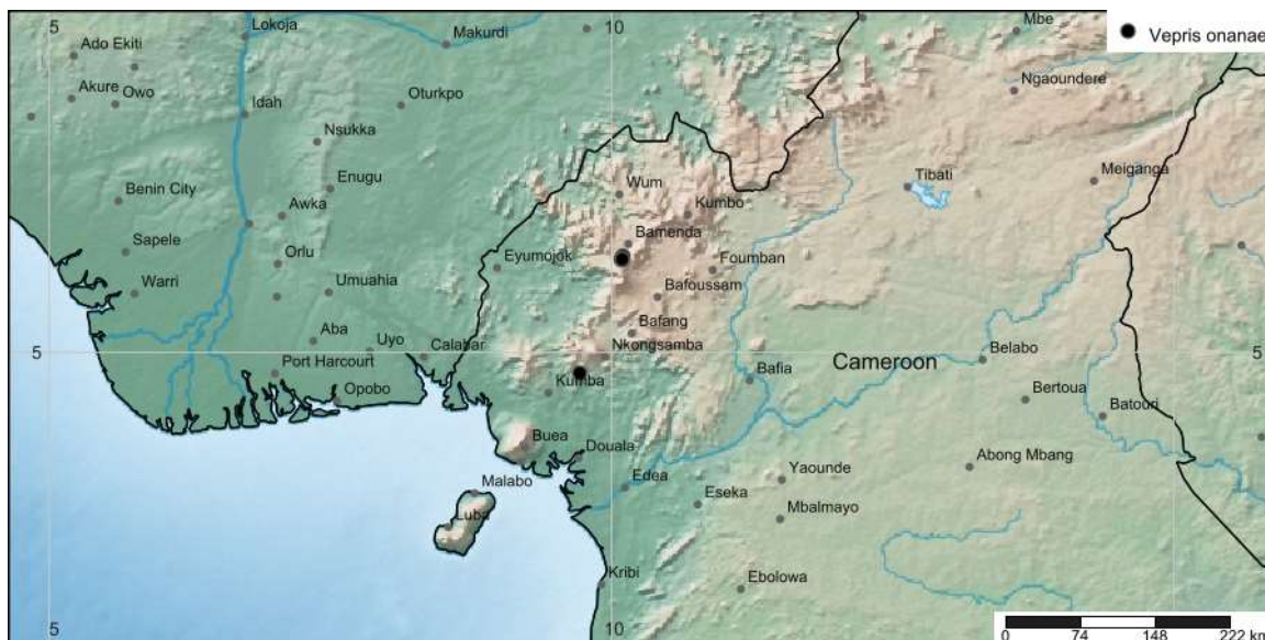
Map 1. Global distribution of Vepris onanae

HABITAT. Lower submontane forest with Pterygota mildbraedii Engl. as emergent trees from canopy (North West Region only). Associated species of tree are Allanblackia gabonensis (Pellegr.) Bamps (Clusiaceae), Alsophila spp. (Cyatheaceae), Noronhia africana (Knobl.) Hong-Wa & Besnard ( Chionanthus africanus (Knobl.) Stearn) (Oleaceae), Macaranga occidentalis (Müll.Arg.) Müll.Arg. (Euphorbiaceae), Polyscias fulva (Hiern) Harms (Araliaceae), Pseudagrostistachys africana (Müll.Arg.) Pax & K.Hoffm. (Euphorbiaceae), Santiria trimera (Oliv.) Aubrév. (Burseraceae), Trichilia dregeana Sond. (Meliaceae) (Harvey et al. 2004:17 – 18) alt. 1310 – 1600 m.