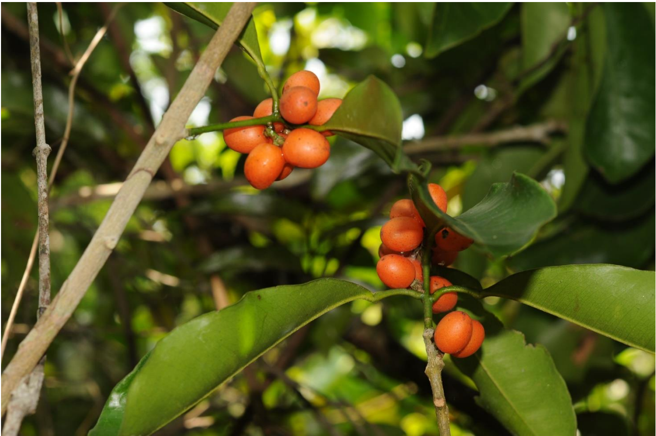
Fig 8. Vepris africana Habitat of fruiting plant (Mpandzou 1282A, IEC, K) in white sand coastal thicket near Pointe Noire, Republic of Congo in 2012.

VERNACULAR NAMES & USES. None are known.