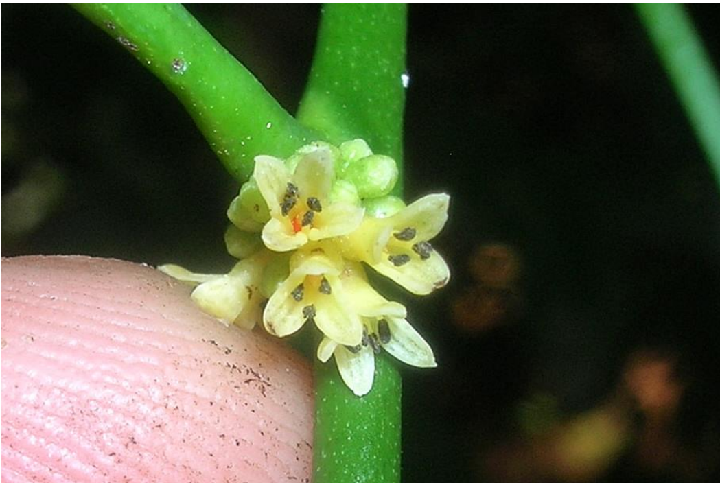
Fig. 5. Vepris robertsoniae Close up of male flowers, note the four stamens, cultivated plant in Base Titanium nursery 28 May 2021.