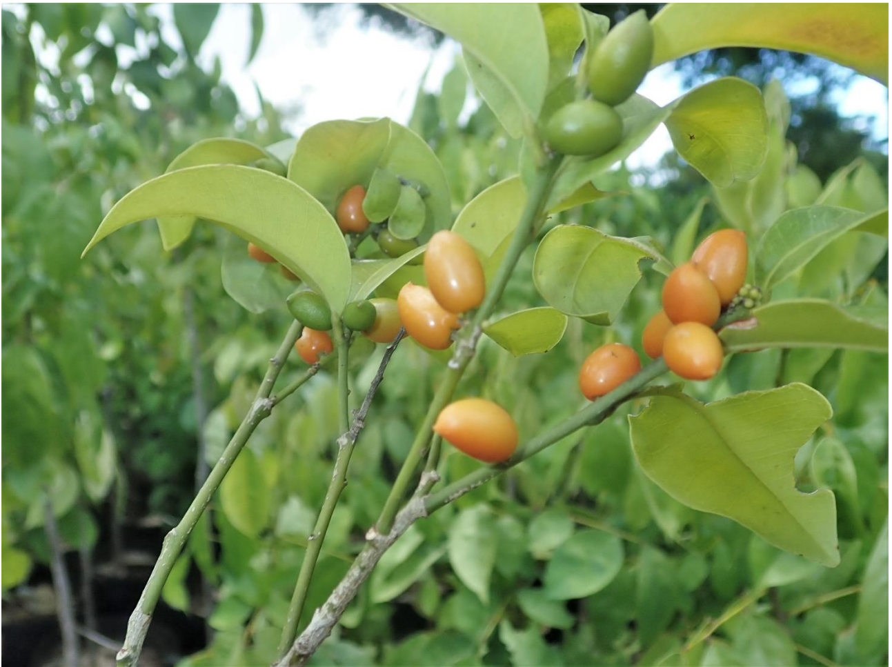
Fig. 4. Vepris robertsoniae Habit of fruiting shrub, Base Titanium nursery 15 April 2019 .