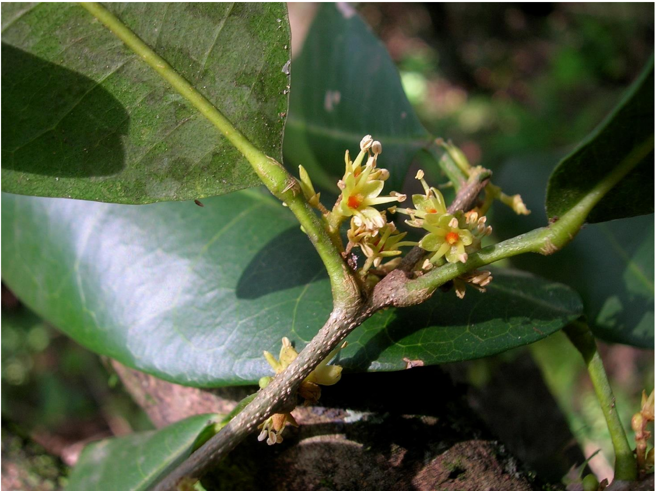
Fig. 9. Vepris simplex Inflorescence with male flowers taken April 2018 on Philip Leakey's farm in the Loita Hills.

Jan. 1976, Msafiri 22 (EA, K!); TANZANIA . Kilimanjaro, 1800 m, fl. 25 June 1993, Grimshaw 93341 (EA, K!); Arusha Distr., Ngongongare forest, fr. 5 May 1960, Willan 55 (EA, K!); HABITAT . Dry mainly evergreen forest, riverine thicket, evergreen rocky bushland, drier types of upland forest and woodland with Juniperus and Acacia , extending into the understorey of Podocarpus forest (Friis 1992), and in Malawi in montane thicket (White et al. 2001). “Common understorey tree at most levels; here in scrub/disturbed relict forest” ( Grimshaw 94409, K!); 300 – 2300 m altitude.