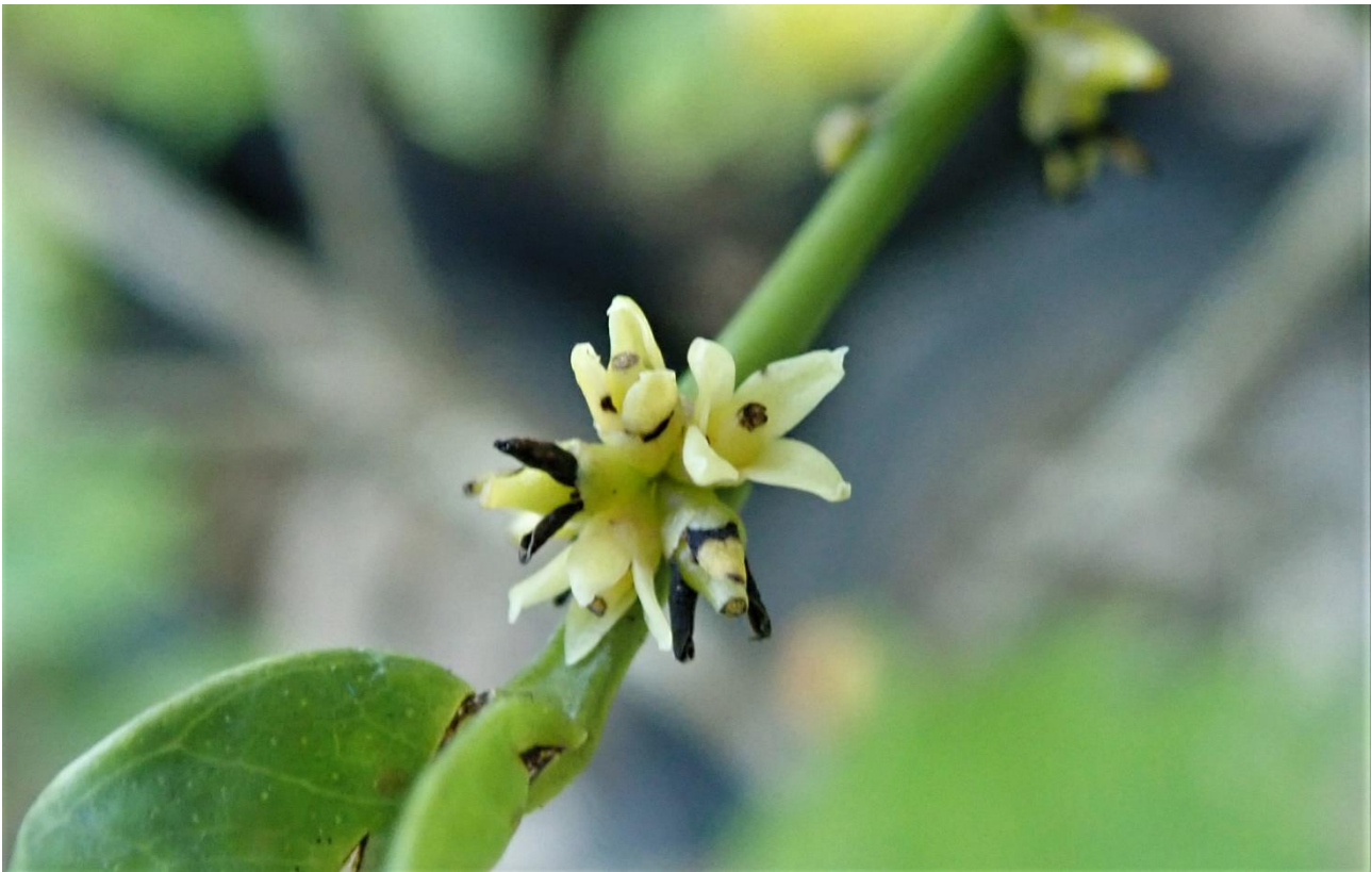
Fig. 6. Vepris robertsoniae Close up of female flowers, 11 Nov. 2020, Base Titanium nursery. The Eight staminodes are concealed.

DISTRIBUTION. Coastal Kenya: Lamu, Kilifi and Kwale Counties.