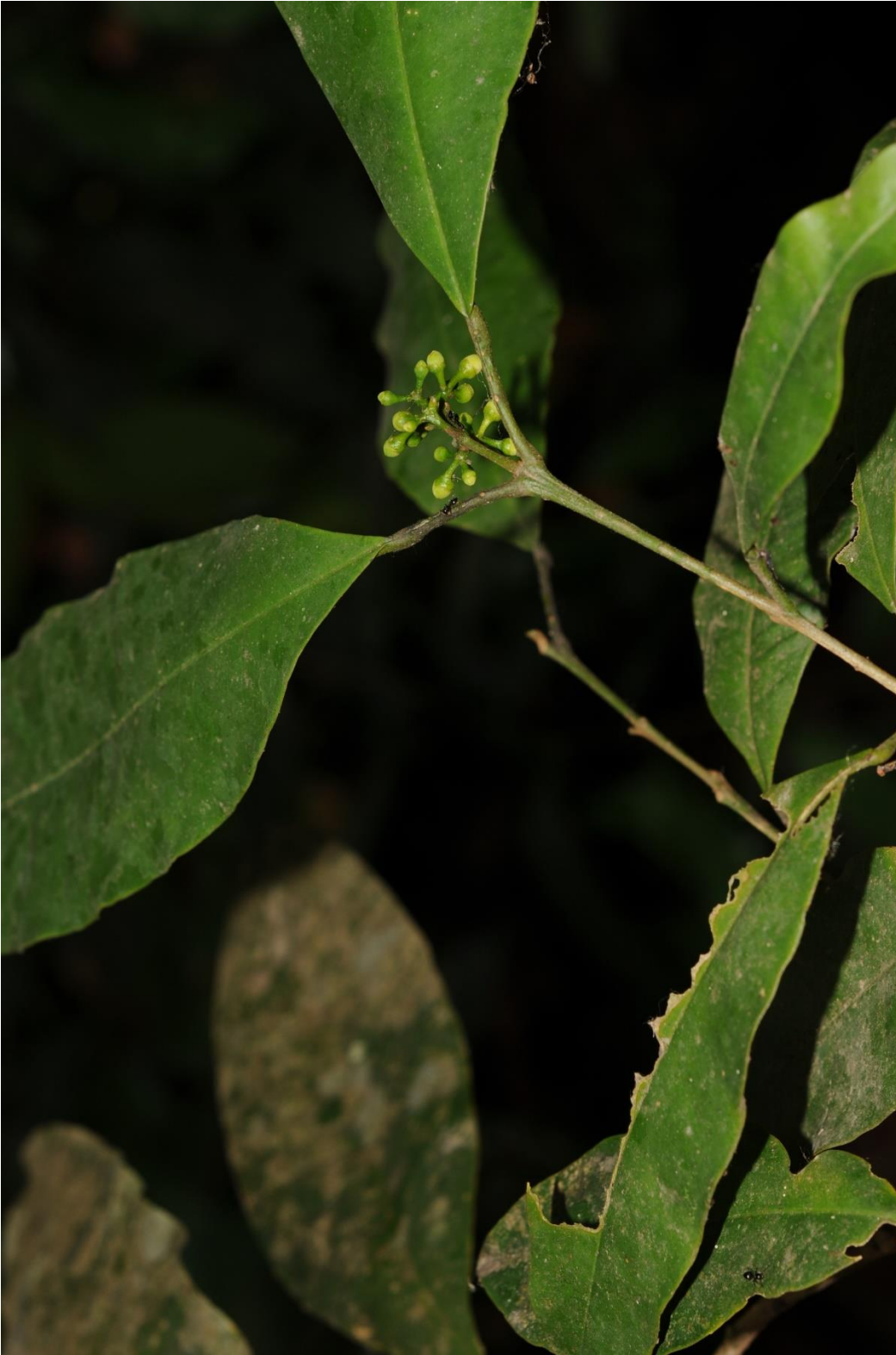
Fig. 1. Vepris laurifolia . Photo showing habit of flowering plant (Cheek 16600, HNG, K) in habitat near Madina Oula, Republic of Guinea near the border with Sierra Leone, in 2012.

large national parks (e.g. Tai National Park, Gola Rainforest National Park) are known to support it, despite botanical inventory effort. The species was assessed as Critically Endangered (CR) under criterion C2a(i) since less than 250 mature individuals are thought to exist and there is a continuing decline in the number of mature individuals, with less than 50 individuals in each subpopulation (Cheek 2017). In Guinea the species is included in two Tropical Important Plant Areas, Kounounkan and Ziama (Couch et al. 2019).