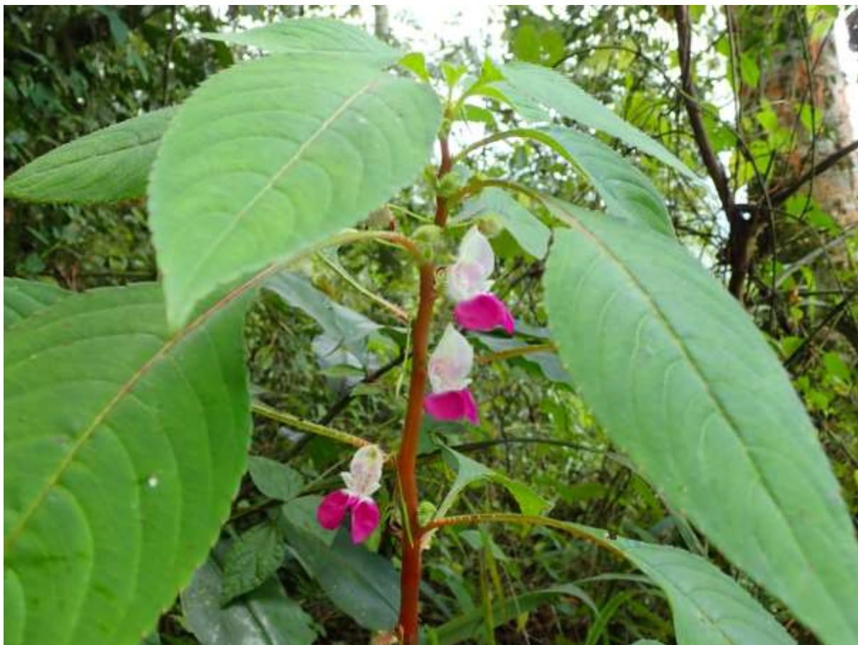
Fig. 1. Impatiens banen . Habit, flowers in frontal view. van der Burgt 2373. Photo by Xander van der Burgt, Dec. 2019

In this paper we describe two new species of Impatiens (Balsaminaceae), both apparently range-restricted and threatened. The first, Impatiens banen (Fig. 1 below) appears restricted to granitic inselbergs in the Ebo Forest of Littoral Region. The second, Impatiens etugei , to rocks in the river of the Kom Wum Forest Reserve of NW Region.