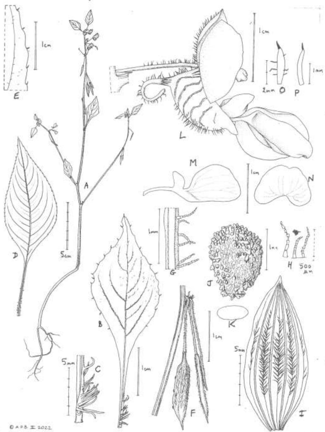
Fig. 3. Impatiens banen . A. habit, flowering & fruiting plant; B. leaf-blade adaxial surface showing part of the surface indumentum and the basal fimbriae; C. detail of fimbriae in B ; D. leaf-blade, showing large bladed variant; E. margin of leaf-blade showing teeth; F. fruit, showing geotropic habit; G. hairs on pedicel; H. multicellular hairs on fruit surface; I. fruit, opened flat, showing outer surface; J. seed, side view; K. outline of seed, transverse section; L. flower, side view; M. united lateral petals, showing long stipe; N. dorsal petal, pressed flat. O. lateral sepal; P. bract. A-C, E-K, M-P from Osborne 85; D & L from van der Burgt 2373. Drawn by ANDREW BROWN.