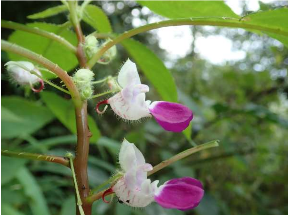
Fig. 2. Impatiens banen . Close-up of flowers, side view. van der Burgt 2373. Photo by Xander van der Burgt, Dec. 2019