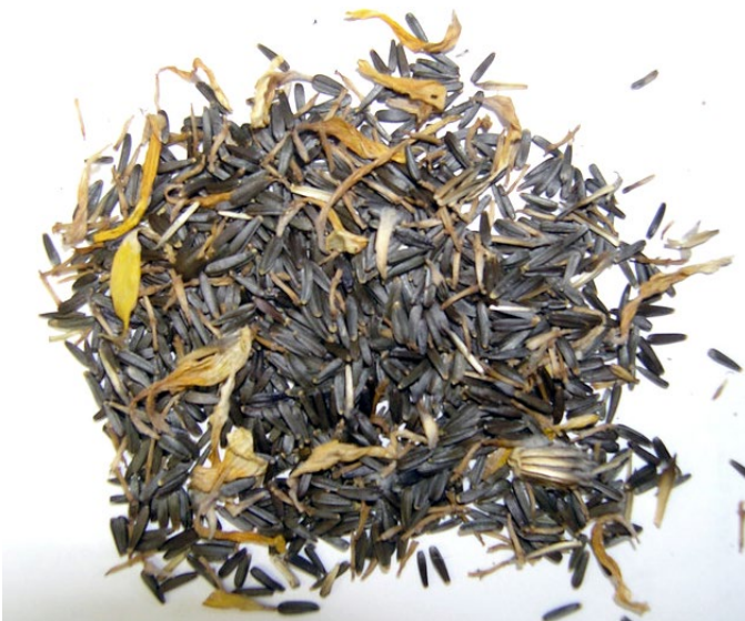
Figure 10. Collection of arrowleaf balsamroot seeds. Note appearance of petals at collection time.

Collection rates. Monsen (USFS retired, personal communication, March 2018) estimated 150 lbs (68 kg) of seed could be hand collected by 2 or 3 people over 2 or 3 days.