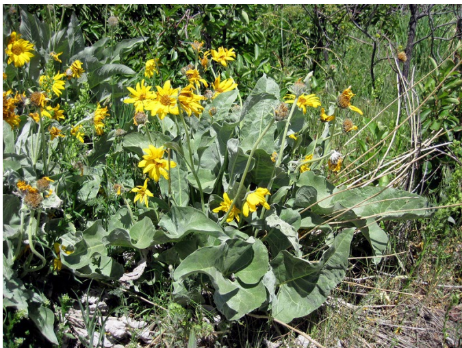
Figure 3. Arrowleaf balsamroot growing in Wyoming.

Above Ground. Plants are strongly tufted, densely leafy from the base, and large (up to 2.5 feet [75 cm] tall when flowering) (Fig 3; Blaisdell 1958; Welsh et al. 1987). Weaver (1915) counted up to 39 individual shoots arising from a single crown measuring 9 inches (23 cm) in diameter. Stems are almost leafless and end in large, yellow, typically solitary, sun-flower like inflorescences (Weber 2006; Pavek et al. 2012; LBJWC 2017). Stems and basal leaves are covered in dense soft hairs giving them a gray-green color (Hitchcock and Cronquist 1973; Weber 2006). Young leaves are silver with fine, felt-like hairs, especially on the undersides, but leaves become less hairy and greener with age (Hitchcock and Cronquist 1973). Basal leaves are arrowhead to heart-shaped and up to 18 inches (46 cm) long and 6 inches (15 cm) wide with long petioles. Stem leaves, if present, are few and reduced, almost bract-like (Welsh et al. 1987; Taylor 1992; Cronquist et al. 1994).