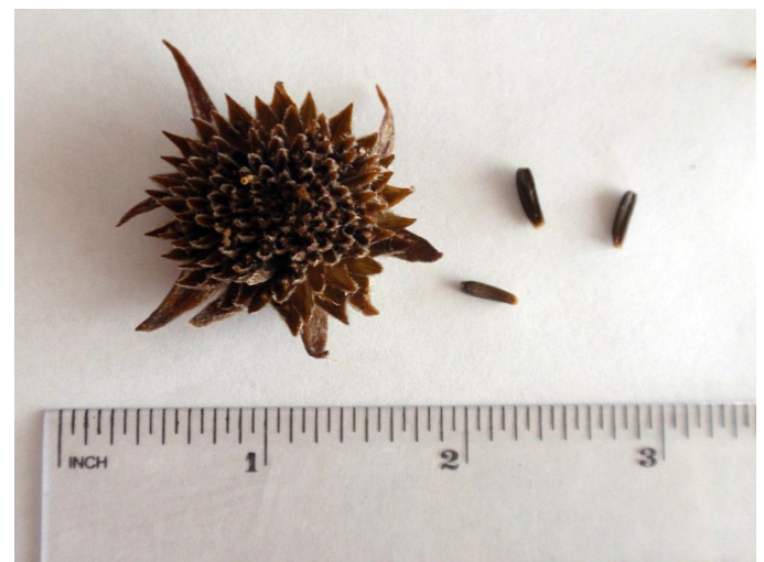
Figure 5. Arrowleaf balsamroot seed head and seeds.

Seed ripening depends on elevation and moisture and occurs later on more moist and/or higher elevation sites (USDA FS 1937). In western Montana, seed maturation at a 3,609-foot (1,100 m) site was 3 weeks earlier than at a 5,988-foot (1,825 m) site (Amsberry and Maron 2006). In a drought year when winter precipitation was 1.5 inches (3.8 cm) below average, plants began growing on March 25, about 1 month before usual, in sagebrush-bunchgrass communities at USSES. Plants were dry by May 1 and produced little seed (Pechanec et al. 1937).