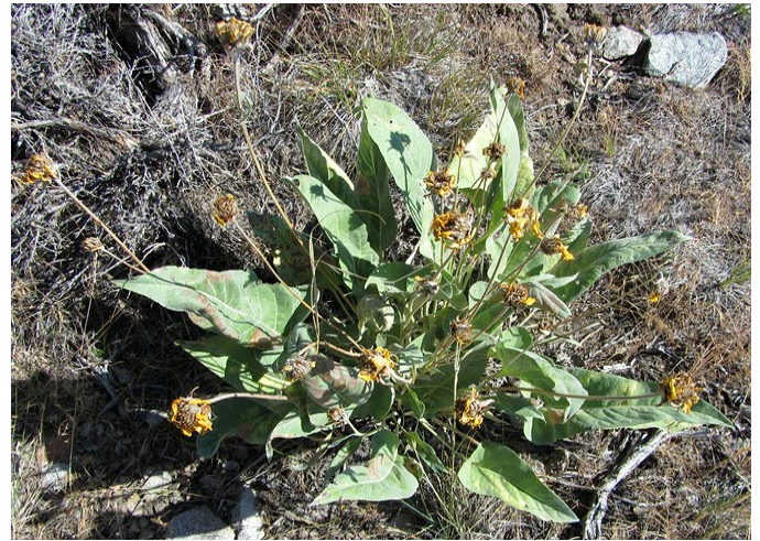
Figure 8. Appearance of arrowleaf balsamroot plants near wildland seed harvest time.

Wildland seed certification. Wildland seed collected for direct sale or for establishment of agricultural seed production fields should be Source Identified through the certification process that verifies and tracks seed origin (Young et al. 2003; UCIA 2015). For seed that will be sold directly, collectors must apply for certification prior to making collections. Applications and site inspections are handled by the state where collections will be made. For seed that will be used for agricultural seed fields, nursery propagation, or research, the same procedure must be followed. Seed collected by some public and private agencies following established protocols may enter the certification process directly, if the protocol includes collection of all data required for Source Identified certification (see Agricultural Seed Field Certification section). Wildland seed collectors should become acquainted with state certification agency procedures, regulations, and deadlines in the states where they collect. Permits or permission from public or private land owners is required for all collections.