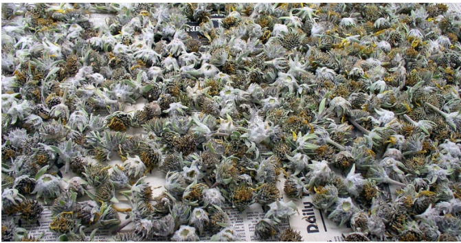
Figure 9. Collection of arrowleaf balsamroot seed heads.

and 10; Stevens and Monsen 2004; Camp and Sanderson 2007). When nearly pure stands of arrowleaf balsamroot occur on level terrain, combines or other reel-harvesters may be used for wildland harvests (Shaw and Monsen 1983). Seed vendors have developed modified reel-harvesters for use on all-terrain vehicles (S. Monsen, USFS retired, personal communication, March 2018). Van Epps and Stevens (2004) suggested that removing or flagging rocks and other vegetation in a wildland setting may allow for use of head stripper or beater equipment to efficiently harvest large amounts of wildland seed. However, recommendations are for wildland seed collections to remove less than 5% of the seed within a population (Bowen et al. 2006).