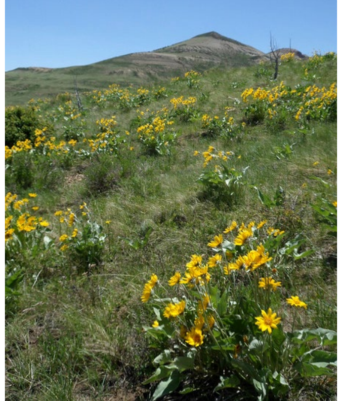
Figure 1. Arrowleaf balsamroot growing in Wyoming grassland.

Idaho fescue-bluebunch wheatgrass-arrowleaf balsamroot vegetation type is common on warm, moist sites, and the bluebunch wheatgrass-Sandberg bluegrass ( Poa secunda )-arrowleaf balsamroot vegetation type is common on hot, dry sites (Powell et al. 2007).