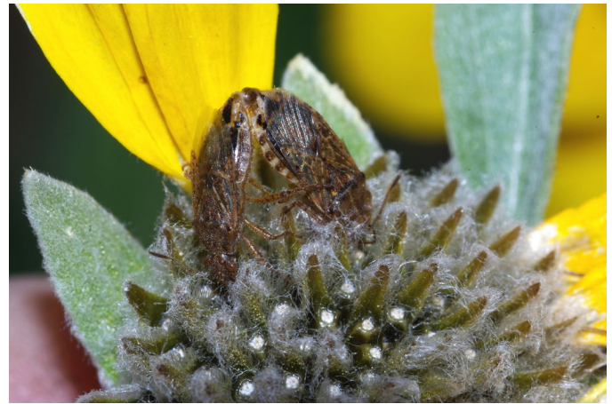
Figure 6. Lygaeid bug (Lygaeidae) feeding on arrowleaf balsamroot seeds.

Predation. Seed production is commonly limited by predation by insects and mammals (Fig. 6). In western Montana, lepidopteran larvae (Tortricidae) and tephritid (Tephritidae) and cecidomyiid (Cecidomyiidae) fly larvae fed on arrowleaf balsamroot flowers (Amsberry and Maron 2006). Lepidopteran larvae were the most abundant and damaging flower herbivores. Of 902 seed heads sampled, 68% were damaged by lepidopteran larvae. Plants also lost an average of 5.9 flower heads or 43% of total good seed heads produced to small mammal and ungulate herbivores, often as seed was maturing (Amsberry and Maron 2006). Deer mice ( Peromyscus maniculatus ) preyed heavily on arrowleaf balsamroot seed in grasslands of western Montana. In the summer and fall of a single year, deer mice removed all seed provided in experiments, and seedlings were almost entirely restricted to areas protected from deer mice (Pearson and Callaway 2008). For more on plant and seed predation, see Grazing Response and Wildlife and Livestock Use sections.