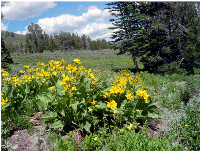
Figure 2. Arrowleaf balsamroot growing in mixed-conifer forest openings in central Idaho.

Woodlands. In open, low- to mid-elevation conifer (Fig. 2) and quaking aspen woodlands, arrowleaf balsamroot can be abundant. It is a characteristic species of western juniper ( J. occidentalis )/big sagebrush/bluebunch wheatgrass rangeland types (Shiflet 1994). In the Steens Mountains of southeastern Oregon, it was positively associated with increasing soil moisture in western juniper encroached vegetation on south-facing slopes when stands across a heterogeneous landscape were evaluated (Peterson and Stringham 2009).