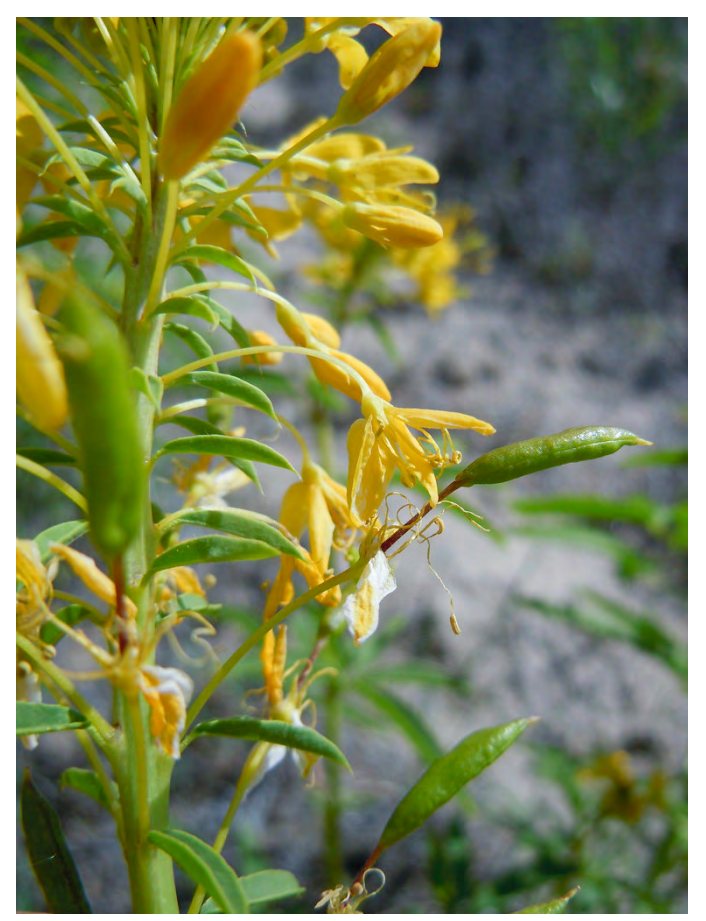
Figure 4. An indeterminate yellow bee-plant inflorescence with immature fruits near the base and progressively less mature flowers toward the apex.

the upper leaf axils (Welsh et al. 2016). Flowering begins at the base of the inflorescence and continues upward as the inflorescence elongates (Fig. 4). Thus, older perfect flowers are pollinated, lose their petals, develop pods, and disperse seed while new flowers continue to open near the apex of the elongating inflorescence. Dehiscence of mature fruits occurs when the two halves (valves) of the pod separate from the loop-shaped placenta (replum), which remains on the plant and dehisces separately (Iltis 1958). Seeds then begin dispersing from the placenta (Fig. 5).