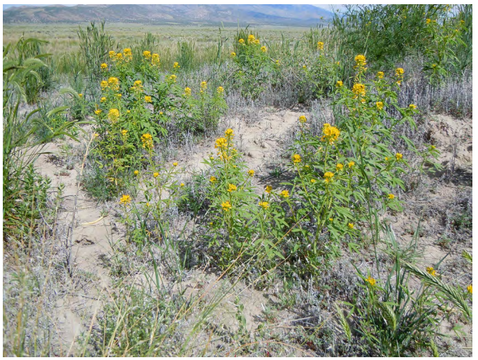
Figure 7. Early successional yellow bee-plant growing with few other species.

Yellow bee-plant is an early successional colonizer that often grows with few other species on fine- to medium-textured, well-drained soils of disturbed sites in western shrublands (Fig. 7). It spreads readily from seed, grows rapidly, and produces flowers that are both self-fertile and outcrossing. Yellow bee-plant flowers over a long period and hosts a wide array of pollinators, thus supporting pollinator populations for other species (Baker and Stebbins 1965). Flowering, seed production, and population size appear to fluctuate annually, depending upon local precipitation (Cane 2008; S. Jackman, OWPR, personal communication, February 2019). Seedlings may be frost sensitive (PFAF 2019), and plants are apparently not tolerant of competition (Pellett 1940).