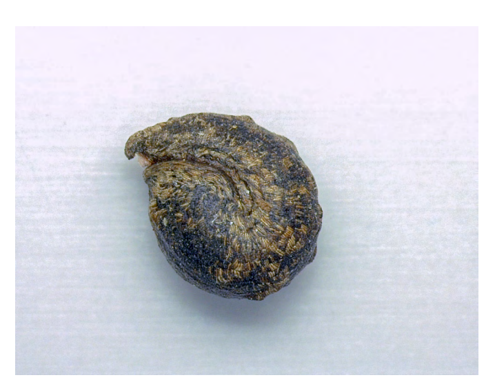
Figure 6. Mature, dark, yellow bee-plant seed.

Breeding system. Cane (2008) found that yellow bee-plant flowers of open-pollinated plants produced two to three times as much fruit as caged plants that received one of three artificial pollination treatments. Caged plants were manually fertilized to compare same flower fertilization (autogamy), fertilization with pollen from a different flower on the same plant (geitonogamy), and crosspollination (xenogamy). Similar proportions of flowers set fruits in each of the three treatments, indicating that perfect flowers were fully self-fertile. Average counts of viable (dark-colored) seeds (Fig. 6) per silique were comparable across all four treatments (Cane 2008).