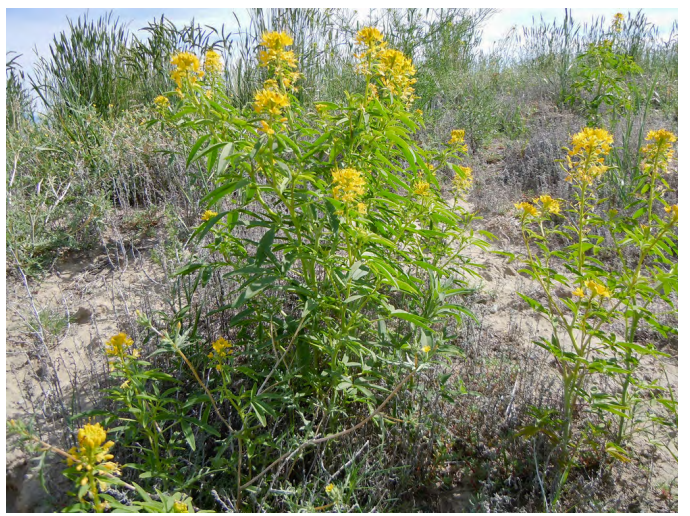
Figure 2. Yellow bee-plant growth habit showing the widely separated leaves and brush-like inflorescence.

The showy inflorescences are terminal racemes that produce densely crowded yellow flowers (Iltis 1958; Holmgren and Cronquist 2005). Bracts on the racemes are simple and much smaller than the stem leaves. Flowering is highly indeterminate, beginning at the base of the raceme and proceeding upward as the raceme elongates to about 16 inches (40 cm) in fruit (Cane 2008; Vanderpool and Iltis 2010).