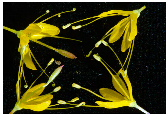
Figure 3. Yellow bee-plant flowers: Perfect flowers with stamens and stalked pistil (left) and staminate flowers (right).

Individual flowers are regular or somewhat irregular (Fig. 3) and are borne on ascending pedicels (Holmgren and Cronguist 2005). The four sepals are fused at the base, persistent, lanceolate, acuminate and minutely toothed at the tip (Turner and Gustafson 2006; Vanderpool and Iltis 2010). The corolla is twisted in the bud and consists of four yellow, ovate petals about 0.2-inch (6 mm) long. The petals narrow at the base but are not clawed. The ovary of perfect flowers develops on a stalk that is about 0.2 to 0.7 inch [5-17 mm] long in fruit (Holmgren and Cronguist 2005; Vanderpool and Iltis 2010; Welsh et al. 2016). Ovaries are large and unilocular with two carpels and parietal placentation. There is a single style (Heywood 1993). The six elongate, yellow stamens are equal and exerted well beyond the petals. The stamens with their conspicuous knobby anthers give the inflorescence a brush-like appearance (Taylor 1992; Holmgren and Cronquist 2005; Turner and Gustafson 2006).