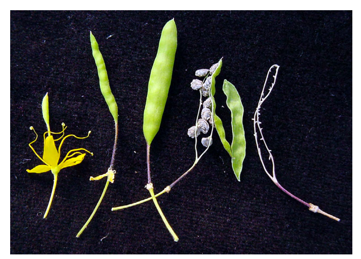
Figure 5. Yellow bee-plant flowers, fruits, and seeds. From left to right: perfect flower, immature and mature fruits (pods), fruit with the valves removed leaving the loop-like placenta (replum) and seeds, and placenta with the seeds removed.

Racemes alternate between production of perfect and staminate flowers as has also been noted for C. spinosa (spiny spiderflower) (Murneek 1927; Cane 2008). Staminate flower production increases when racemes are producing large numbers of fruits that require high resource input. Thus, flowering continues throughout the season, alternating between the two flower types, and fruit production occurs over a prolonged period (Cane 2008).