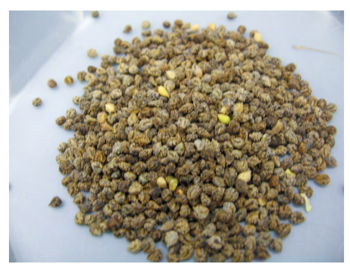
Figure 9. Clean, primarily dark colored yellow bee-plant seed.

Nursery, seed lots are first run over a scalper with top screen no. 8 and bottom screen no. 1/16. Screen sizes may require some adjustment for individual seed lots. Fine cleaning is accomplished using a Missoula dewinger (USFS Missoula Technology and Development Center, Missoula, MT) with feeder speed 4, drum speed 6, angle 8, and the air closed to remove fine chaff and non-viable seed (usually light colored) (USFS LPN 2017). At the USFS Bend Seed Extractory, large stems are removed by hand. Seed is then sieved from the seed lot using soil sieve screens, usually numbers 4, 5, or 6 to remove the pod valves and other coarse material. A Westrup LA-P de-awner (Westrup A/S, Slagelse, Denmark) is then used to break up remaining pod material and release any seed that remains in the pods. The seed lot is then sieved again to remove free seeds. If any seed remains in the pod material at that point, another cycle of de-awning and sieving is conducted. After each step, freed seeds are removed to reduce the risk of mechanical damage by repeated abrasion as well as the quantity of material yet to be cleaned (K. Herriman, USFS Bend Seed Extractory, personal communication, March 2019).