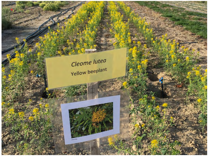
Figure 10. Yellow bee-plant irrigation trial at the Oregon State University Malheur Experiment Station, Ontario, Oregon.

<sup>2</sup> Irrigation season from floral bud to seed set.