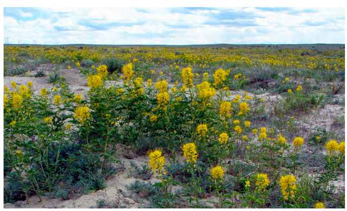
Figure 1. A large population of yellow bee-plant growing in open, disturbed habitat typical for the species.

Populations of yellow bee-plant occur in shadscale ( Atriplex confertifolia ), sagebrush ( Artemisia spp.), horsebrush ( Tetradymia spp.), greasewood ( Sarcobatus vermiculatus ), creosote bush ( Larrea tridentata ), riparian, pinyon-juniper ( Pinus-Juniperus spp.), and ponderosa pine ( P. ponderosa ) communities (Munz and Keck 1959; Vanderpool and Iltis 2010; Ogle et al. 2012; Tilley et al. 2012; Calflora 2018; Granite Seed 2019). The species spreads quickly from seed and may develop large populations on recent disturbances (Taylor 1992; Cane 2008; Ogle et al. 2012; Granite Seed 2019; LBJWC 2019).