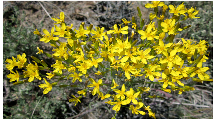
Figure 4. Tapertip hawksbeard inflorescences, note the indeterminate flowering.

Tapertip hawksbeard produces an abundance of flower heads (20-100 or more) (Fig. 4), which are arranged in compound corymbiform inflorescences (Munz and Keck 1973; Bogler 2006). Flower heads are narrow, erect, and made up of 5 to 12 petal-like, perfect, ray flowers with 5-toothed tips (USFS 1937; Babcock and Stebbins 1938; Hermann 1966; Anderson and Holmgren 1976; Welsh et al. 1987; LBJWC 2018). Flower heads are enclosed by conspicuous, smooth, equal bracts with a few very short outer bracts at the base (USFS 1937). Fruits are 6 to 9 mm long, nearly cylindrical cypselas (false achenes) with pointed tips and a white pappus with barbed bristles. Fruits are yellow, buff, or brown with 10 to 12 longitudinal ribs. Length of the ribs equals or exceeds pappus length (USFS 1937; Babcock and Stebbins 1938; Munz and Keck 1973; Cronquist et al. 1994; Bogler 2006). Tapertip hawksbeard fruits are cypselas, but they are often referred to as achenes or seeds because seeds are not removed from the fruits in the cleaning process. Throughout this review, the term seed will refer to the fruit or cypselas and the seed it contains.