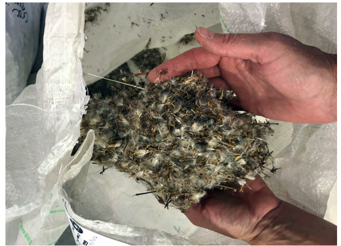
Figure 7. Uncleaned tapertip hawksbeard seed collected from wildland stands.

Wildland Seed Collection. Mature tapertip hawksbeard seed is available from mid-June through mid-July (Fig. 7). Presence of a fluffy white pappus is a good indication that seed is ripe. Harvesting seed before the pappus opens dramatically increases the amount of non-viable seed collected (Tilley et al. 2012). Because insect damage to seeds is common, evaluating the damage in potential collection areas can help to plan efforts for maximum seed yield. In wildland stands in central Utah, the percentage of insect-infested flower heads ranged from 0.9 to 80%, and the percentage of seed damage ranged from 0.7 to 22% depending on the site and year (Anderson 2009). Common seed predators included tephritid flies ( Campiglossa spp.) and snout moths ( Phycitodes albatella ) (Anderson 2009). In 2012 it was reported that wildland collections were not typically available from commercial sources, and contract collecting costs exceeded $100/lb (Tilley et al. 2012).