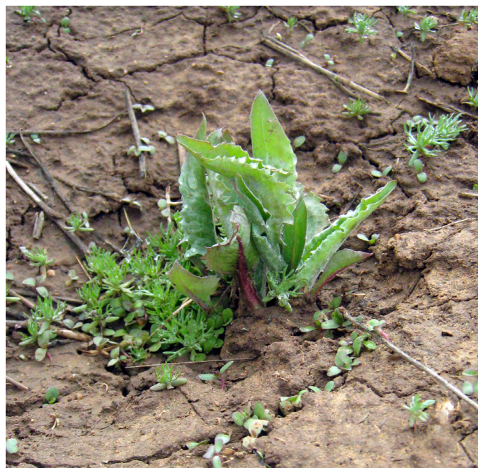
Figure 11. Tapertip hawksbeard transplant growing in research plots near Nephi, UT.

Fall seeding tapertip hawksbeard as part of a seeding mixture is recommended for fine sandy loams, silts, coarse-textured, or gravelly soils receiving at least 8 to 20 inches (200-500 mm) of precipitation (Walker and Shaw 2005; Vernon et al. 2007; Ogle et al. 2012; Tilley et al. 2012).