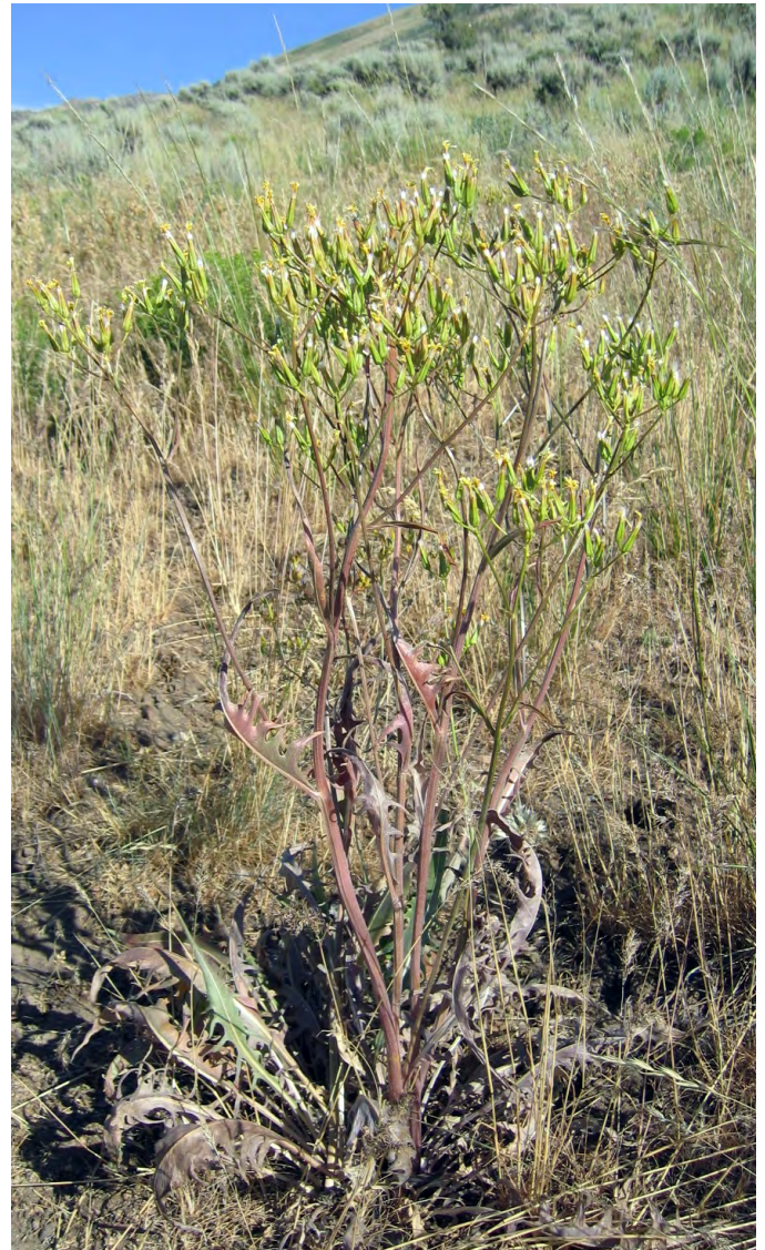
Figure 8. Tapertip hawksbeard producing seed heads in the Ruby Mountains of Nevada.

Because tapertip hawksbeard seeds are easily wind-dispersed, collecting seed heads early in the day or ripening process when heads are closed is an option (Fig. 8). However, Jensen (2004) found that viability of closed seed heads was 40% and of open seed heads was 61%. Comparisons of the collections were made on the same site on the same day.