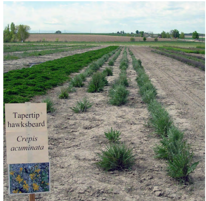
Figure 10. Tapertip hawksbeard growing in research plots at Oregon State University's Malheur Experiment Station in Ontario, OR.

Some initial investigations related to establishment and maintenance of tapertip hawksbeard stands for seed production have been made (Fig. 10).