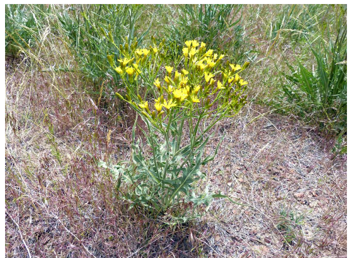
Figure 3. Tapertip hawksbeard growing in Nevada.

Revegetation guidelines recommend tapertip hawksbeard for fine silt loam, silt, and sandy to coarse-textured soils on sites receiving 8 to 20 inches (20-50 cm) of precipitation (Walker and Shaw 2005; Ogle et al. 2012). Recommendations for restoration are discussed in the Wildland Seeding and Planting section.