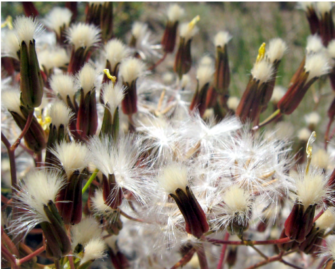
Figure 5. Open and closed tapertip hawksbeard seed heads.

bloom appearance June 18, full flowering July 1, seed dispersal began July 16 and ended August 9, and plants were dry on August 3. The variation in date range for these stages was 42 days for appearance of flower stalks, 40 days for first blooms, 43 days for full blooming, and 20 days for ripe seed (Blaisdell 1958).