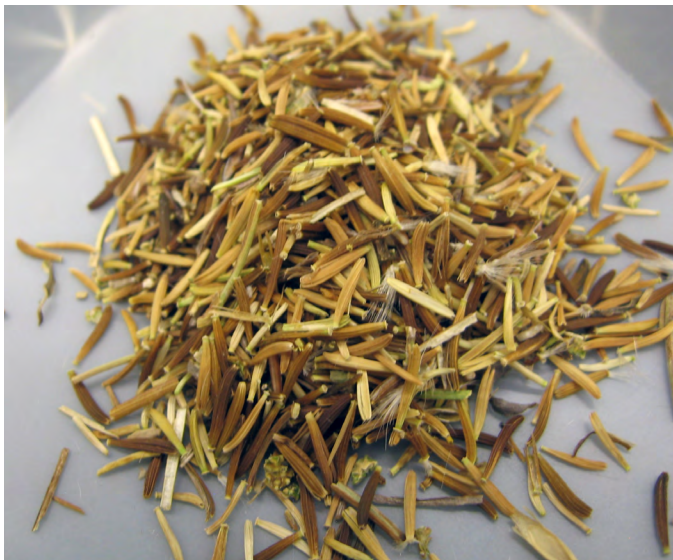
Figure 9. Cleaned tapertip hawksbeard seed.

Seed Cleaning. Tapertip hawksbeard seed can be cleaned of chaff and seed contaminants without any mechanical equipment, but if pappus removal is necessary, some mechanical processing is likely necessary (Fig. 9).