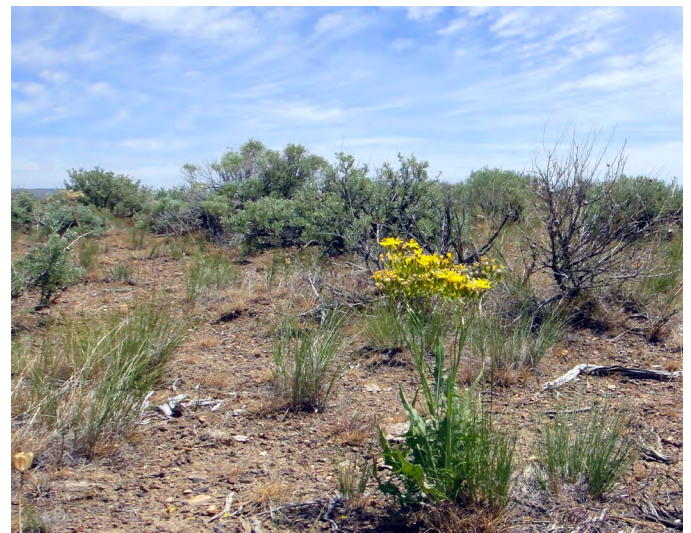
Figure 2. Tapertip hawksbeard growing in Oregon.

Shrublands. Tapertip hawksbeard is commonly associated with sagebrush (Fig. 2) and mountain brush communities. In a 10-year study of plant communities, soil, and vegetation relationships in near climax sagebrush communities in northern Utah, southern Idaho, northeastern Nevada, and west-central Wyoming, tapertip hawksbeard occurred in 47 of 85 sagebrush-grassland plots (Passey et al. 1982). In descriptions of rangeland cover types of the US, tapertip hawksbeard was described as frequent in basin big sagebrush ( Artemisia tridentata subsp. tridentata ), mountain big sagebrush ( A. t. subsp. vaseyana ), threetip sagebrush ( A. tripartita ), and more mesic parts of Wyoming big sagebrush ( A. t. subsp. wyomingensis ), and black sagebrush ( A. nova ) communities (Shiflet 1994). In the Blue and Ochoco mountains of Oregon, tapertip hawksbeard was frequent but cover was low in antelope bitterbrush/Idaho fescue-bluebunch wheatgrass ( Purshia tridentata Festuca idahoensis - Pseudoroegneria spicata ) and mountain big sagebrush/Idaho fescue-prairie Junegrass ( Koeleria cristata ) communities (Johnson and Swanson 2005).