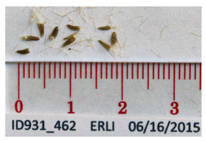
Figure 9. Desert yellow fleabane seed collected from plants in Idaho.

Marketing Standards. Acceptable seed purity, viability, and germination specifications vary with revegetation plans. Purity needs are highest for precision seeding equipment used in nurseries, while some rangeland seeding equipment handles less clean seed quite well.