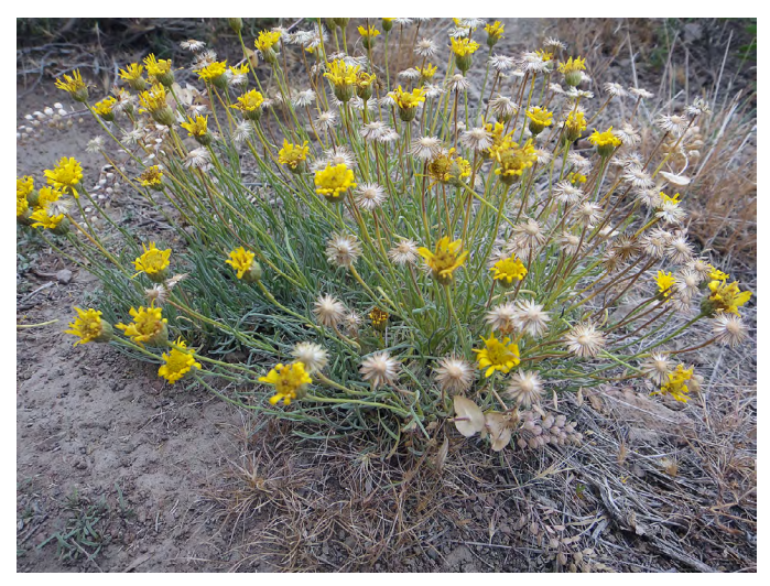
Figure 6. Indeterminate seed production of a desert yellow fleabane plant in Oregon.

Wildland Seed Collection. Details about wildland seed collection were limited in the literature, though some harvesting clues are provided in plant photographs taken by the USDI BLM Seeds of Success (SOS) field collection crews. Seed appears to be indeterminate (Fig. 6) suggesting that population monitoring and revisiting sites is necessary to maximize harvests.