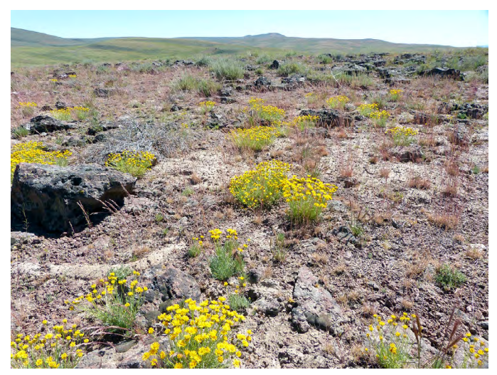
Figure 3. Desert yellow fleabane growing in a rocky site in Nevada.

Soils. Dry rocky or medium to coarse-textured soils (Fig. 3) with neutral pH are common in desert yellow fleabane habitats (Cronquist et al. 1994; Mee et al. 2003; Hitchcock and Cronquist 2018). Desert yellow fleabane is common in shallow, poorly developed soils with partially weathered rock fragments (lithosols) in sagebrush ecosystems, especially the western half of the sagebrush steppe and in basaltic areas of the Columbia Basin (Taylor 1992). Desert yellow fleabane dominated an overgrazed plot with an average soil depth of 2.25 inches (5.7 cm) in what was likely an antelope bitterbrush/Douglas' buckwheat (Eriogonum douglasii) potential vegetation type in the Blue Mountains of Oregon (Johnson and Swanson 2005). In central Oregon's western juniper zone, desert yellow fleabane had high constancy but low cover at sites with sandy loam to loamy coarse or clay loam soils with pH of 6 to 8 (Driscoll 1964).