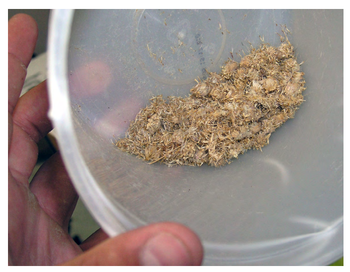
Figure 8. Desert yellow fleabane bulk seed collection.

Post-collection management. Although not specifically discussed in the literature, post-collection management of desert yellow fleabane seed likely requires attention similar to that of most wildland seed. Seed should be dried thoroughly before storing and if insects are suspected, insect strips can be used or seed can be stored at low temperatures to prevent substantial loss to insect damage.