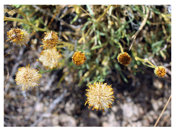
Figure 7. Desert yellow fleabane inflorescences with and without ripe seed.

Several collection guidelines and methods should be followed to maximize the genetic diversity of wildland collections: collect seed from a minimum of 50 randomly selected plants; collect from widely separated individuals throughout a population without favoring the most robust or avoiding small stature plants; and collect from all microsites including habitat edges (Basey et al. 2015). General collecting recommendations and guidelines are provided in online manuals (e.g. ENSCONET 2009; USDI BLM SOS 2016). As is the case with wildland collection of many forbs, care must be taken to avoid inadvertent collection of weedy species, particularly those that produce seeds similar in shape and size to those of desert yellow fleabane.