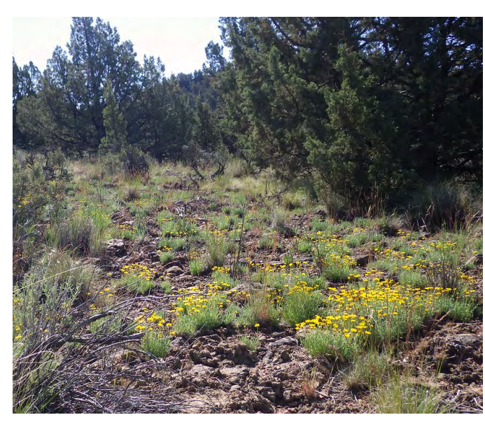
Figure 2. Desert yellow fleabane growing adjacent to a juniper community in Oregon.

Desert yellow fleabane often occurs in the western juniper ( J. occidentalis )/big sagebrush/bluebunch wheatgrass vegetation type which ranges from southeastern Washington south to northern California and eastern Idaho (Shiflet 1994) and is frequent in the northern part of the western juniper woodland zone of southern Washington and Oregon (Dealy 1990). In central Oregon, desert yellow fleabane occurs consistently (40-100% constant), but as a low cover (0.1-0.2%) component in the western juniper zone (Driscoll 1964).