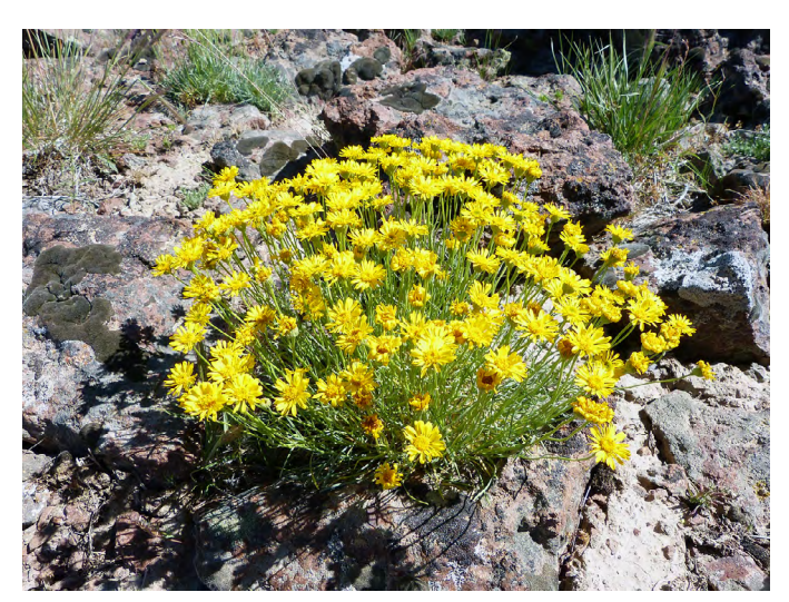
Figure 4. Desert yellow fleabane plant growing in a rocky site in Nevada.

Desert vellow fleabane is a perennial from a stout multi-branched taproot giving rise to a branched, woody caudex (Cronquist et al. 1994; Nesom 2006). Taproots typically reach a minimum depth of 12 inches (30 cm) (Mee et al. 2003). Branches of the caudex are covered in withered but persistent leaf bases, and plants exude a watery juice when injured (Welsh et al. 2016). Plants are strongly tufted, often with many erect stems mostly from 2 to 8 inches (5-20 cm) tall (Fig. 4) (Taylor 1992; Cronquist et al. 1994), but mat-forming plants have also been reported (Bates et al. 2007). Stems and leaves are sparsely to densely covered with fine, stiff, appressed hairs. Bases of the stems are hairless or nearly so, slightly enlarged, and straw to purple in color (Cronquist 1947; Munz and Keck 1973). Leaves are mostly basal but can be well distributed along the stems (Cronquist 1947; Nesom 2006). Leaf bases are enlarged and straw to purple in color (Cronquist 1947; Welsh et al. 2016). Hairiness of leaves is also similar to that of the stems with sparse to dense, stiff, fine, and short hairs all appressed in the same ascending direction (Munz and Keck 1973; Cronquist et al. 1994). Leaves are alternate, simple, entire, and linear from 0.4 to 3.5 inches (1-9 cm) long and 0.5 to 3 mm wide (Cronquist 1947; Munz and Keck 1973; Nesom 2006). If present, leaves along the stems are reduced (Mee et al. 2003).