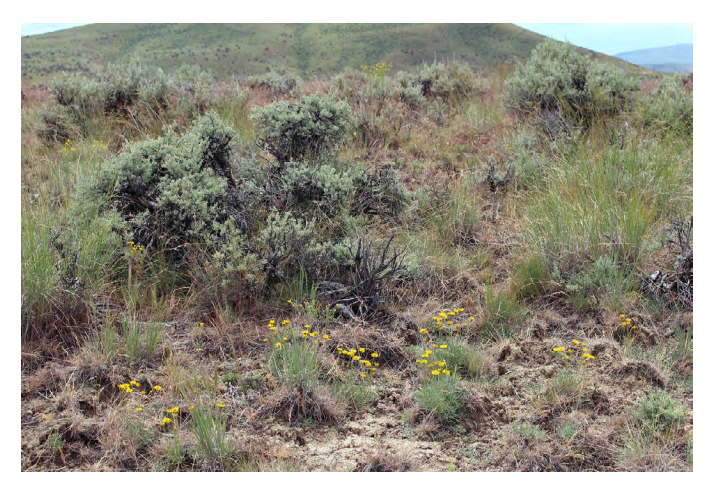
Figure 1. Desert yellow fleabane growing in a sagebrush grassland in Idaho.

Habitat and Plant Associations. Open rocky plains, foothills in low- to moderate elevation grasslands, shrublands (Fig. 1), and woodlands (Fig. 2) are common desert yellow fleabane habitat (Cronquist 1947; Mee et al. 2003; Nesom 2006; Pavek et al. 2012; Hitchcock and Cronquist 2018). Common vegetation associates include Idaho fescue (Festuca idahoensis), bluebunch wheatgrass (Pseudoroegneria spicata), sagebrush (Artemisia spp.), rubber rabbitbrush (Ericameria nauseosus), bitterbrush (Purshia spp.), and juniper (Juniperus spp.) (Cronquist 1947; Nicholson et al. 1991; Nesom 2006; Welsh et al. 2016). Less common associates include ponderosa pine (Pinus ponderosa) and Douglas-fir (Pseudotsuga menziesii) (Lloyd et al. 1990; Nicholson et al. 1991).