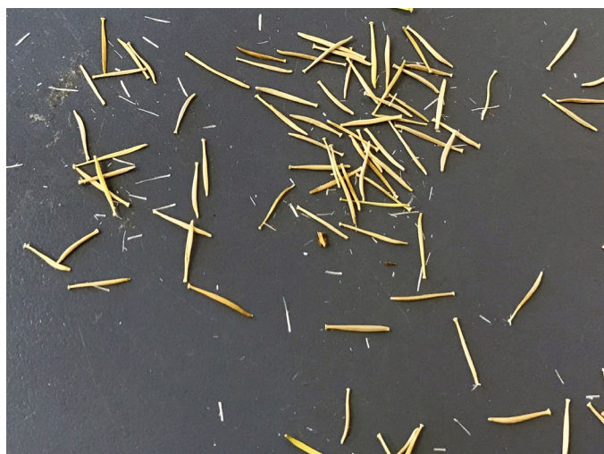
Figure 6. Sagebrush false dandelion seed after initial cleaning (above) and seed following final cleaning (below) at the USFS Bend Seed Extractory.

Wildland Seed Yield and Quality. The cleanout ratio (clean seed weight:rough weight of seed collection) for seed lots of sagebrush false dandelion cleaned at the USFS Bend Seed Extractory and seed quality data for these lots