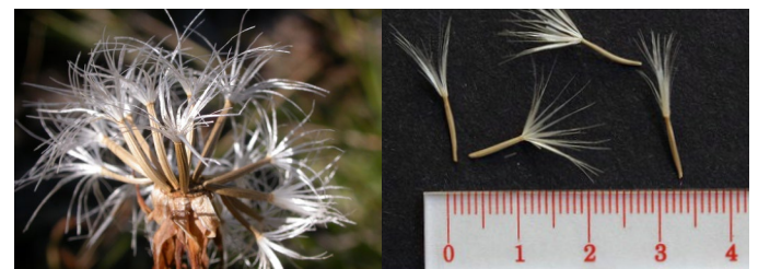
Figure 5. Mature fruits (cypselas, false achenes) of sagebrush false dandelion with pappus bristles. Note the lack of beaks on the fruits. Photos: M. Lavin, Montana State University (left), USDI BLM ID931 SOS (right, scale: mm).

Post-collection management. Molding can occur if leaves and stems, which contain milky juice, are collected along with the seeds, particularly if collected during high humidity periods. Vegetative material should be removed promptly by hand or with sieves. Harvested seed should be spread on racks in a protected area and thoroughly air dried in the field or following transport to the cleaning facility. Collected material can be transported in clean, breathable bags or boxes and should be protected from overheating during transport. Insect infestations should be controlled by freezing collections for 48 hours or use of appropriate chemicals.