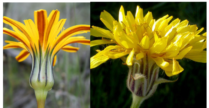
Figure 2. Sagebrush false dandelion flower heads with involucre bracts and ligulate ray florets.

Inflorescences (Fig. 2) are erect heads of 13 to 90 ligulate ray florets borne singly on each peduncle (Chambers 1993). Flower heads are each subtended by an involucre 0.6 to 1 inch (15-25 mm) wide consisting of 8 to 25 subequal, linear to lanceolate bracts (phyllaries) with the outer series shorter than or equal to the inner (Chambers 1993). The bracts are acuminate at the tip, green, sometimes with purple dots, and glabrous to white-hairy, especially on the margins and midrib, which is often purple (Cronquist 1955; Chambers 1993, 2006). The florets exceed the bracts. Ligules are yellow, sometimes with an orange midrib that may become pinkish with age. Florets may close early in the day during hot weather (Taylor 1992; Chambers 1993).