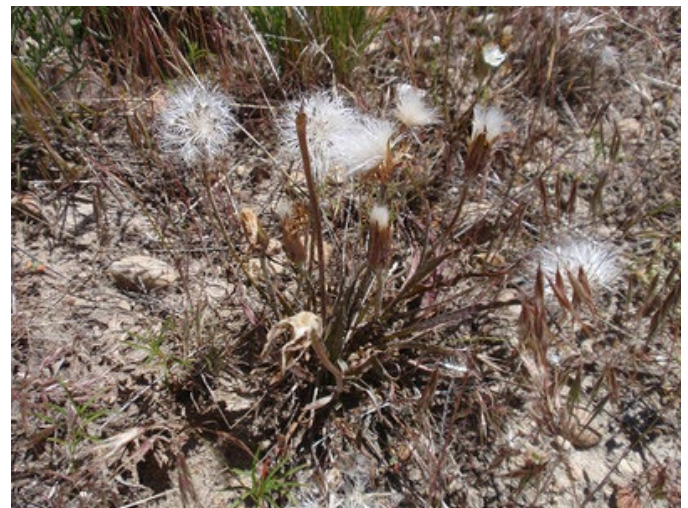
Figure 4. Sagebrush false dandelion plants with mature and dispersing seedheads illustrating uneven ripening.

Wildland seed certification. Wildland seed collected for direct sale or for establishment of agricultural seed production fields should be Source Identified through the Association of Official Seed Certifying Agencies (AOSCA) Pre-Variety Germplasm Program that verifies and tracks seed origin (Young et al. 2003; UCIA 2015). For seed that will be sold directly, collectors must apply for certification prior to making collections. Applications and site inspections are handled by the state where collections will be made. For seed that will be used for agricultural seed fields, nursery propagation or research, the same procedure must be followed. Seed collected by some public and private agencies