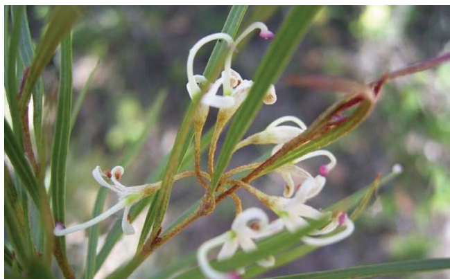
Fig 6. Grevillea parviflora subsp. parviflora flowering on the Central Coast, December 2003.