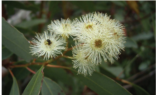
Fig 5. Eucalyptus fracta flowering on the Broken Back Range, December 2004.