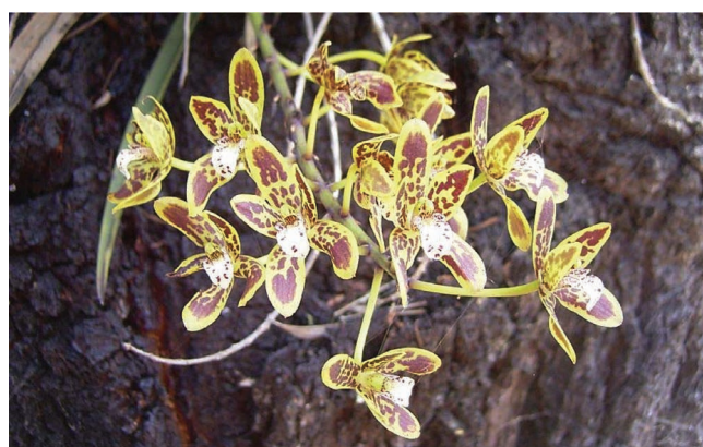
Fig 3. Cymbidium canaliculatum flowering near northern Wollemi, November 2008.