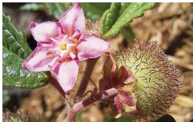
Fig 2. Commersonia rosea flowering and fruiting in northern Wollemi, October 2014.

12,486 km 2 and an AOO of 400 km 2 ( n = 224 ) have been calculated for this taxon within the Hunter catchment, although this species also occurs extensively elsewhere in New South Wales, Queensland, the Northern Territory and Western Australia.