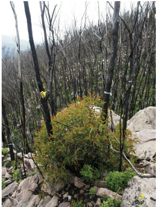
Figure 4. A resprouting plant of Eucalyptus imlayensis , 23 months after the fire of 2019 / 20; multiple shoots arise from the large lignotuber wedged into fractured rock on the steep eastern slope.

Eucalyptus imlayensis is threatened primarily because it will be many years until resprouting plants are reproductive and there was very little seed in storage prior to the fire, and so, without seed storage, any catastrophic event that destroys regenerating plants may lead to extinction. Before the fire, plants rarely produced seed although they often flowered. Plants resprouted well after the fire, with numerous shoots coming from most lignotubers (Figure 4); shoots had reached an average height of 110 cm by November 2021. Prior to the fire, the main threat to the population seemed to be competition from Leptospermum scoparium but an adverse effect from Phytophthora cinnamomi , which is present on the site, cannot be ruled out. Basal resprouts prior to the fire generally did not survive, possibly because of the intense competition. There has been considerable regeneration of Leptospermum scoparium since the fire but of more concern is the large number of seedlings of Eucalyptus sieberi , which have appeared. If they reach maturity, the structure of the community will be greatly altered.