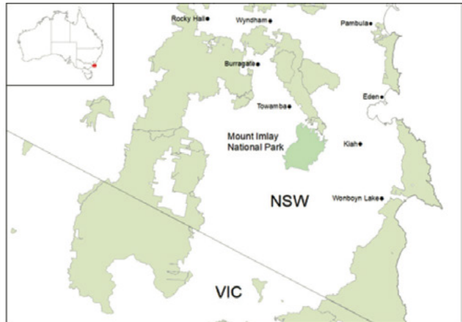
Figure 1. Mount Imlay is an isolated peak south-west of Eden, in Mount Imlay National Park, New South Wales. The narrow summit ridge is above 800 m a.s.l.

The lower slopes of Mount Imlay National Park are dominated by Eucalyptus sieberi with a shrubby understorey. Gullies typically contain Eucalyptus cypellocarpa and species of wet sclerophyll forest. The summit area is fringed by a forest of Eucalyptus fraxinoides on the eastern and northern sides, while the rocky summit itself has scattered stunted Eucalyptus sieberi . The steep, eastern slope below the summit features a shrubland dominated by Leptospermum scoparium with emergent Eucalyptus sieberi , Eucalyptus fraxinoides and Eucalyptus imlayensis . This highly localised shrubland appears to be restricted to the mountain. The shrubland habitat is unusually wet for this dry mountain, receiving regular dew and mist from coastal winds in summer. There is very little soil in this community but mosses (including Sphagnum australe ) are abundant on the rocks and in crevices.