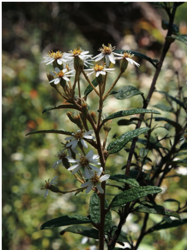
Figure 6. Olearia rugosa subsp. distalilobata on Mount Imlay in October 2015.

the subspecies grows on Mount Imlay, the establishment of more populations elsewhere on the mountain will be useful to spread the risk of local extinction.