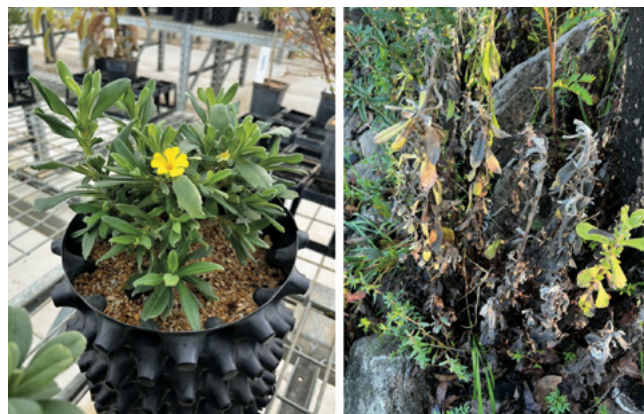
Figure 5. Hibbertia circinata a) grown from cuttings at ANBG, b) affected by P. cinnamomi on Mt. Imlay.

The prognosis for the wild population of this species appears to be poor despite the large number of plants currently present. It might be maintained on Mount Imlay by using Phytophthora -free refugia and spraying with the chemical phosphite. Before the fire, plants grew most vigorously beneath the cliffs of the mountain; these may prove to be pathogen-free refugia because they don't seem to receive run-off from infested areas. Phosphite (an anionic form of phosphonic acid) has been shown to provide protection for some species and vegetation affected by Phytophthora cinnamomi (Barrett and Rathbone 2018) and has recently been applied in screening trials to Hibbertia circinata plants in the wild and in a glasshouse at the Royal Botanic Gardens Sydney. Plants in the glasshouse showed minor phytotoxicity but possible beneficial effects are still being assessed.