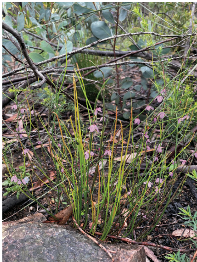
Figure 7. Though cryptic when sterile because of its grass-like leaves, Tetratheca subaphylla is unmistakable when in flower.

Tetratheca subaphylla is cryptic when not in flower, with its leaves reduced to small scales on narrow stems, making the plant look grass-like (Figure 7). This species was one of the first to disappear from the northern slopes of Mount Imlay after the arrival of Phytophthora cinnamomi . It is highly susceptible to infection, rapidly killed and apparently did not recolonise infested areas. The species has been recorded at several sites in the hinterland of the south coast of NSW (though, has not been relocated in post-fire surveys by the Royal Botanic Gardens Victoria), the western side of Kosciuszko National Park (where rare) and East Gippsland. It is regarded as vulnerable in Victoria and may be eligible for such a listing nationally if adequate data were available for its assessment. On Mount Imlay at least, while the species has re-appeared post-fire, there seems a chance that it will approach extinction in the coming decades.