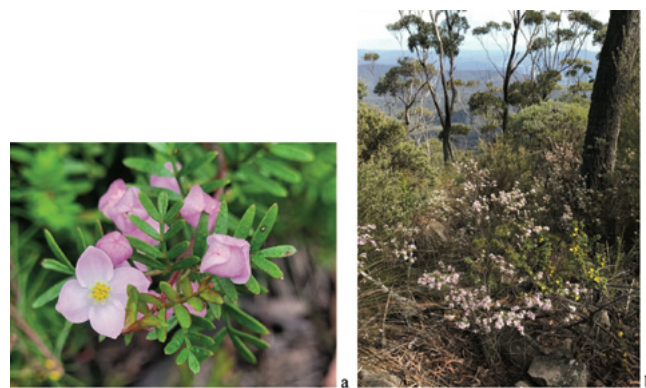
Figure 3. a) The pink flowers and pinnate foliage of Boronia imlayensis; b) this species grows up to 1.5 m tall with another endemic Hibbertia circinata (yellow flowers) on the summit ridge of Mount Imlay.

ridge and adjoining slopes above the cliffs (Figure 3b), mostly where Phytophthora cinnamomi has until recently been absent. It is an obligate seeder, its entire population having been burnt and killed in the fire of 2019/20. Seedlings were not apparent in June 2020 six months after the fire but were numerous by November 2020; the population now undoubtedly exceeds the pre-fire number and is continuing to recruit. About 5% of the population flowered in spring 2021 but seed production was not assessed after that event. The species is susceptible to Phytophthora cinnamomi and may be killed by the pathogen, but appears to be much less susceptible than Hibbertia circinata with which it grows. The long-term effect of Phytophthora cinnamomi on the Boronia imlayensis population will depend on whether its recruitment exceeds its mortality. The species should be assumed to be at risk from this pathogen unless population monitoring assesses it as being able to persist despite occasional deaths.