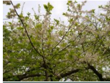
Halesia tetraptera var monticola