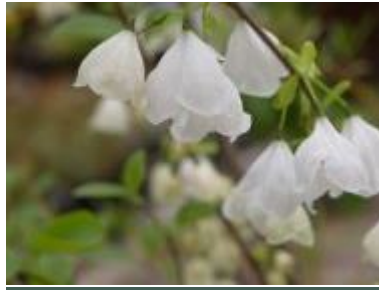
Halesia monticola 'Vestitia'