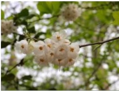
Halesia tetraptera var monticola

Burncoose Nurseries: Gwennap, Redruth, Cornwall TR16 6BJ