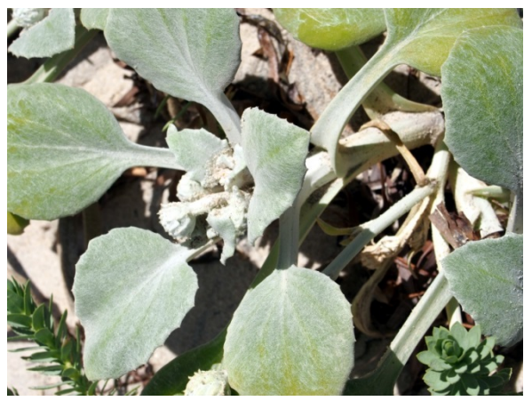
The alternate hairy leaves are distinctly stalked.