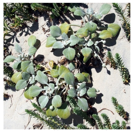
Ground hugging plants of *Arctotheca populifolia.

*Arctotheca populifolia is commonly naturalized around the coastal foredunes from Geraldton to Eyre and also South Australia, Victoria and New South Wales. It is commonly called Dune Arctotheca or Beach Daisy (see also Arctotheca populifolia). Arctotheca is derived from the Greek, arctos meaning bear and thece meaning box or chest, in reference to the shaggy fruit; and populifolia from the Latin populus meaning poplar and folium meaning leaf referring to the leaf shape. It is a short-stemmed perennial herb to 30cm tall. The basal leaves are up to 7cm long and 8cm wide, with densely hairy upper and lower surfaces. There is 1 large flower head, up to 2cm across on stalks covered with dense white hairs. The outer florets are in 1 row and sterile, each with an obvious yellow petal-like structure up to 8mm long. The inner florets are tubular, bisexual and 5-lobed. The fruits are up to 5mm long and white hairy. It is a native of South Africa and Mozambique.