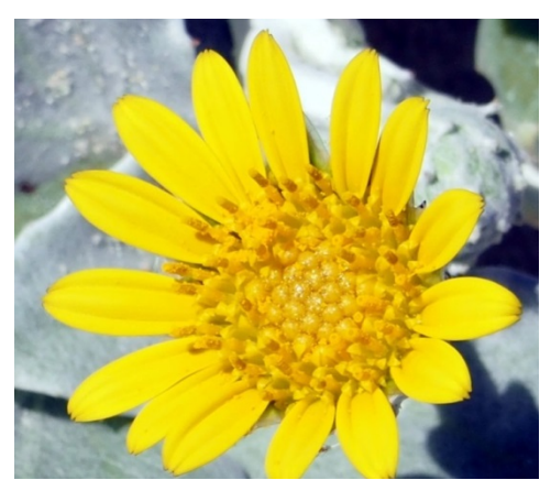
The flowering head has an outer row of sterile florets and many tubular, inner, bisexual florets.