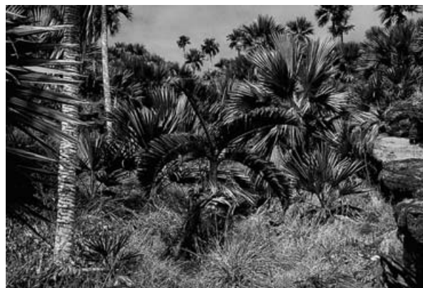
Plate 1 Regenerating Hyophorbe lagenicaulis in Latania loddigesii woodland, Round Island.

Endemic to Round Island (Plate 1), off the north-east coast of Mauritius, and might have originally occurred on mainland Mauritius and some of the small offshore islets such as Ile aux Aigrettes (Moore, 1978a). Traveller's reports (Baker, 1877; Lloyd, 1846; Johnston, 1895) and photographs from the 1920s suggest that this species was formerly an abundant component of the island's palm community. However, the population declined following the introduction of goats and rabbits, and