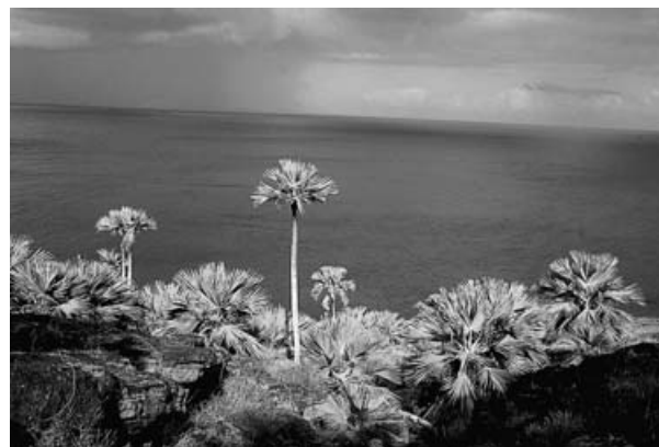
Plate 2 Latania loddigesii woodland on Round Island, Mauritius (M. Maunder).

Endemic to Mauritius and its offshore islands, and widely cultivated on Mauritius and elsewhere, but now restricted to the islands of Gunner's Quoin and Round Island (Plate 2). A Dutch illustration of 1599 shows what appears to be a highly stylized Latania as part of a coastal forest (reproduced in Strickland & Melville, 1848). Johnston (1895) recorded this species from Round Island, Flat Island and Coin de Mire. Regeneration on Round Island increased following the eradication of rabbits and