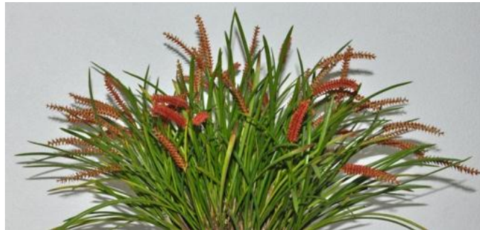
May Judges' Choice Specimen & Orchid of the Night: Dendrochilum wenzelii , grown by Don Chesher

Orchids are usually grown indoors in Denmark, near a window, as the average outdoor temperature is approx. 0-5 C, and for several of the winter months temperatures drop to well below zero. Now, several months after arrival in Denmark, they are all rapidly growing new leaves, much more rapidly than they do outdoors in Canberra. Daylight that far north is scarce in winter, but perhaps the plants grow well because they sit indoors at uniformly warm temperatures.