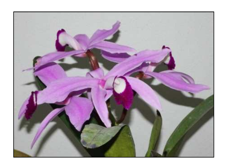
Judges' Choice — Species for April, Cattleya perrinii grown by Bill Ferris

Cut back on the watering on those plants that need a winter dry spell (e.g. catasetums, soft cane dendrobiums). Do your watering early in the day to ensure that the foliage is dry before nightfall. Make sure your more tropical plants are getting enough night-time heat. Keep the watering up to Australian terrestrials; they need to be moist (but not sodden) until spring. Start to stake your cymbidium spikes as soon as they are about 10 cm long — see how to stake your racemes in our book, "Growing Orchids in Cool Climate Australia".