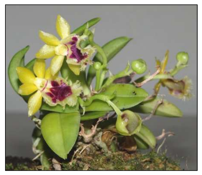
Judges' Choice — Species March Gastrochilus retrocallus ' grown by Mark Clements