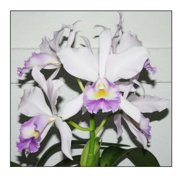
Judges' Choice – Hybrid March Cattlianthe Blue Boy grown by Rob Rough