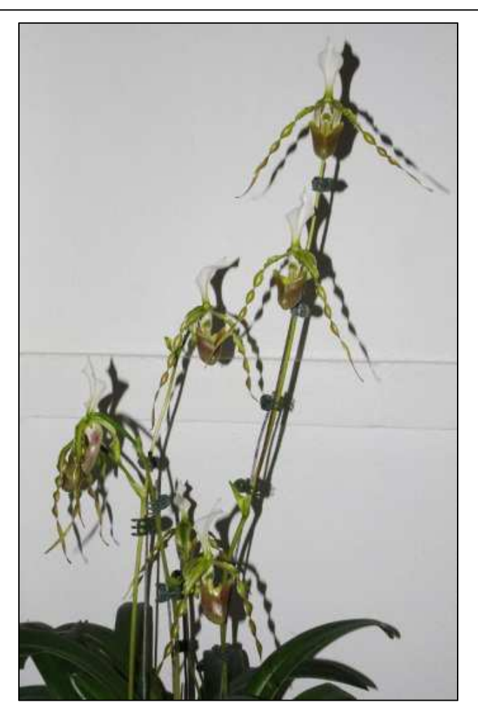
Orchid of the Night in March , Paphiopedilum dianthum grown by David Judge

Flowering takes a lot out of the plant, so it's best to cut off flower spikes if the plant is struggling — wait until there are big, fat bulbs before letting plants flower. It's also best to cut off spikes that appear in late spring or summer, as plants start to suffer if temps go above