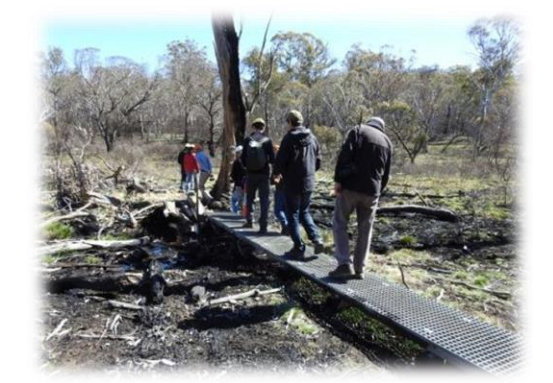
Burnt out swamp, Yerrabi Track