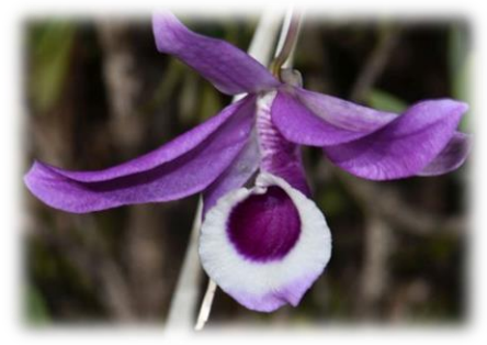
Dendrobium lituiflorum