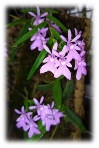
Epidendrum centropetalum