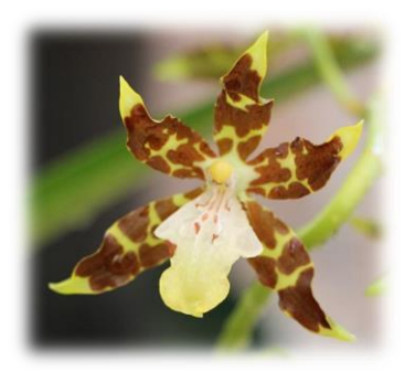
Oncidium maculatum