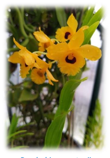
Dendrobium paxtonii