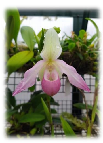
Phragmipedium x sedenii 'Candidum'