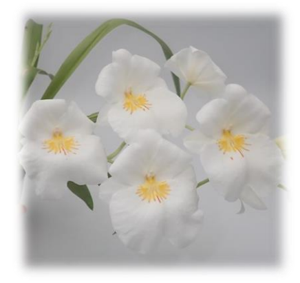
Miltoniopsis Sun Glow 'Amazing'