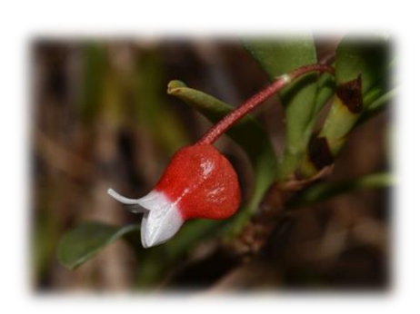
Mediocalcar monticola