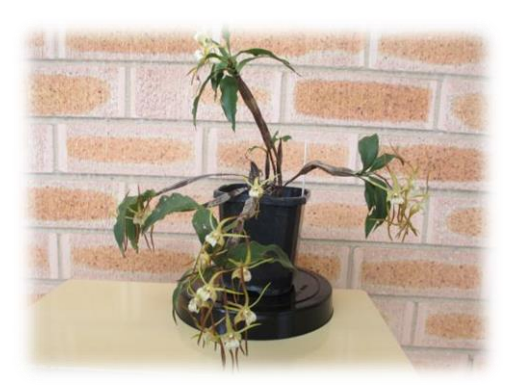
Tetrabaculum tetragonum 'melaleucaphilum'