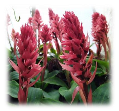
Stenorrhynchos speciosus