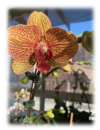
Phalaenopsis unnamed hybrid