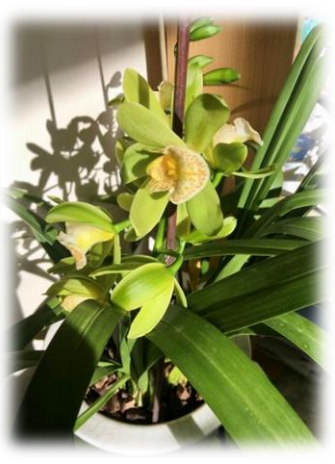
Cymbidium pendant miniature