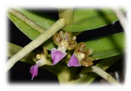
Pelatantheria insectifera