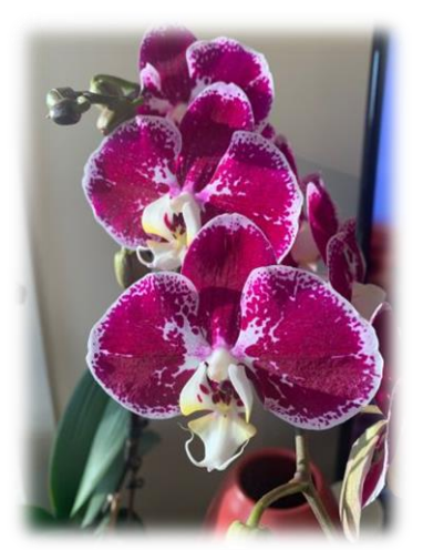
Phalaenopsis unnamed hybrid