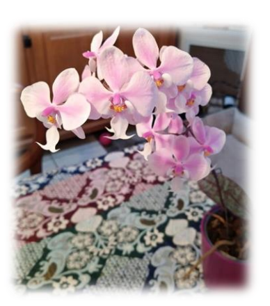
Phalaenopsis schilleriana