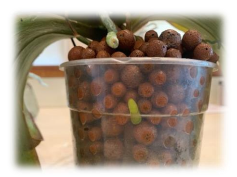
Phalaenopsis potted into LECA

in a protected NE corner of the room, and get a few hours of direct light from sunrise, then a few hours late afternoon sun (but in summer this is reduced by the higher angle of the sun). But it's more a 'bright' environment than a 'sunny' one.