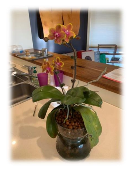
Phallie placed in glass vase with LECA

Water/humidity – my plants get remarkably little water.