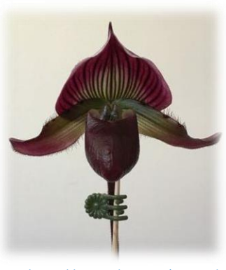
Paphiopedilum Red Fusion 'Spotted Leopard' x P. Hsingying Flame 'Roy'