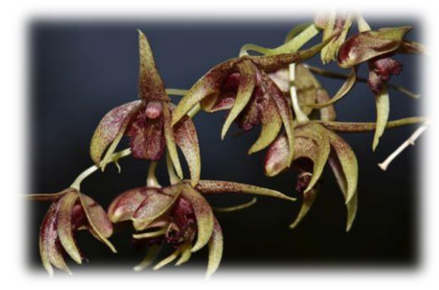
Dockrillia congesta