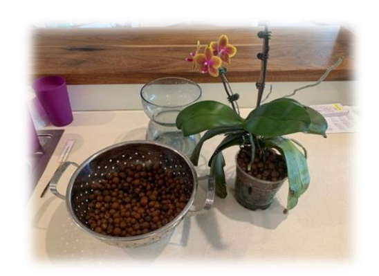
LECA clay balls (Lightweight Expanded Clay Aggregate)

I've had a lot of luck with phallies, much of which I put down to having a perfect indoor space for them to grow. They're low-care plants (by orchid standards), and just need an occasional spruce up, trimming dead or dying leaves and roots. They reward us with colourful sprays of flowers for most of the year. My record for a single plant is 8 months in bloom. Most of them easily flower for 3-4 months each year.