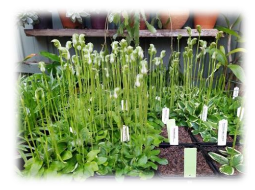
Pterostylis curta