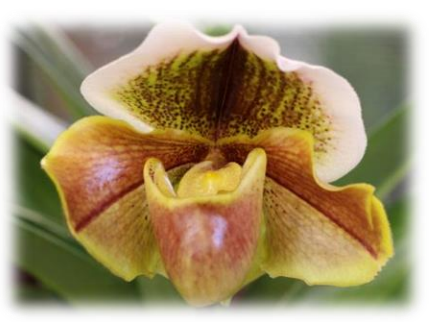
Paphiopedilum Startler x Pure Spirit