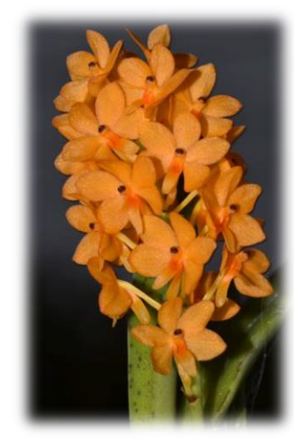
Vanda miniata