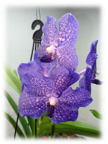
Vanda Somsri Glory 'Blue'