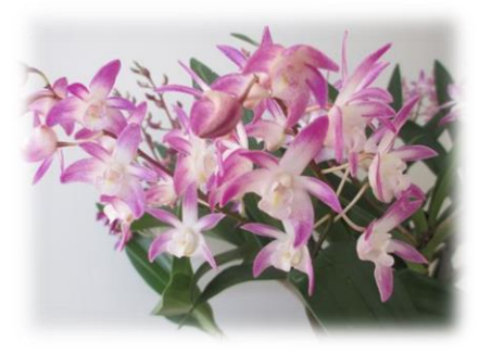
Dendrobium Burgundy Bride 'Melbourne' x Delicatum 'Tracy'