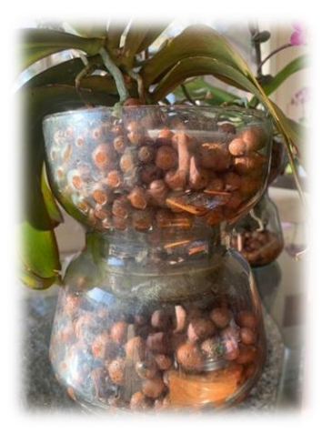
Phallie in LECA - detail

Growing media – most of my plants still grow in a traditional bark mix. However I'm experimenting with leca clay balls as a growing medium. Mine is a hybrid semi-hydroponic model – I've repotted several plants into straight leca, then placed these pots into glass vases similarly filled with leca. I water the plant, and the water runs off into the vase. I ensure the collected water remains around the bottom of the potted orchid. That water then evaporates up and around the plant and the roots go crazy! The good thing about leca is it doesn't break down like bark does.