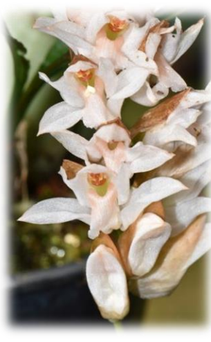
Bulleyia yunnanensis