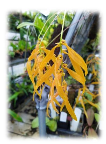
Bulbophyllum wallichii