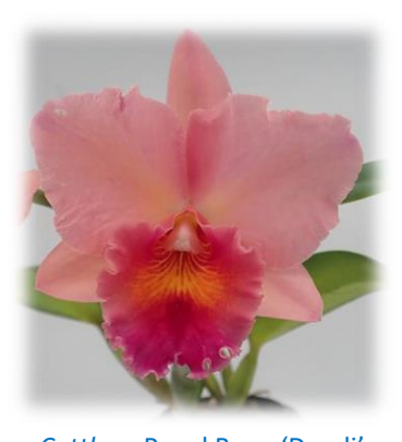
Cattleya Royal Beau 'Dendi'