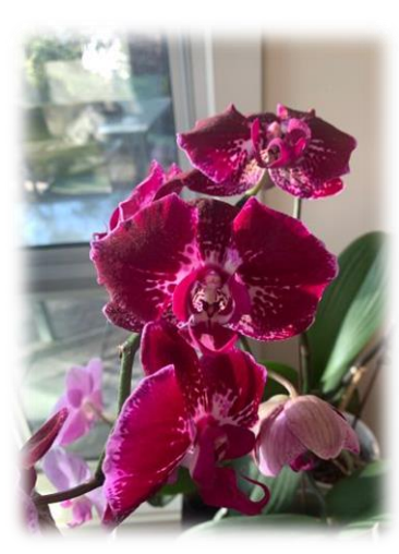
Phalaenopsis unnamed hybrid