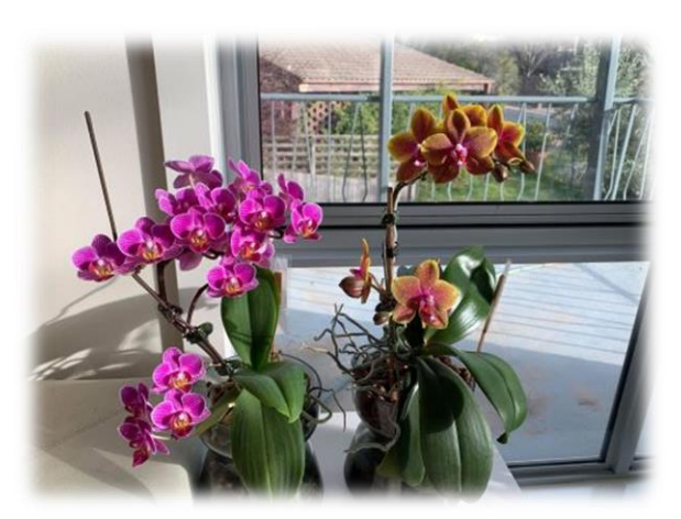
Phalaenopsis hybrids grown in semi-hydroponics

The setup in my loungeroom is very simple – and if you've got a bright, airy room you can easily replicate the conditions.