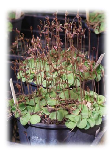
Cyrtostylis reniformis