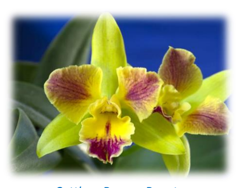
Cattleya Burana Beauty