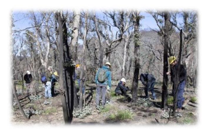
Conservation group looking for orchids in the burnt forest

The Orchid Society has obtained a Grant of $2000 from the ACT Government to assist in the recovery following the recent fires in the Namadgi National Park. The Conservation Group has been invited to support the Rangers and other similar groups in the recovery work in a volunteer capacity, and the Grant is to help cover the costs of conducting orchid surveys and associated work in the burnt areas of Namadgi. The Society wishes to thank the ACT Government for our inclusion in this recovery work and for the associated Grant.