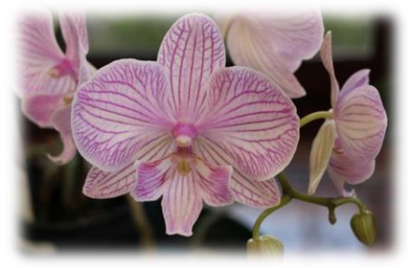
Phalaenopsis Sasquach 'Dendi'