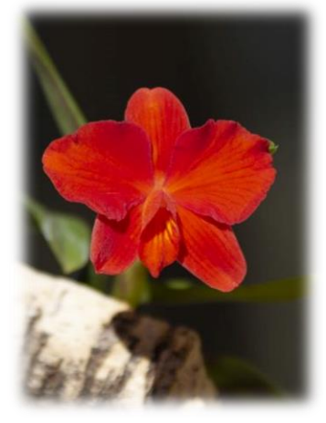
Cattleya coccinea