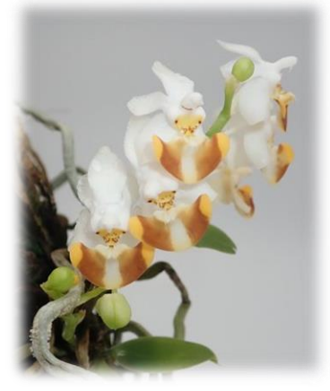
Phalaenopsis lobbii