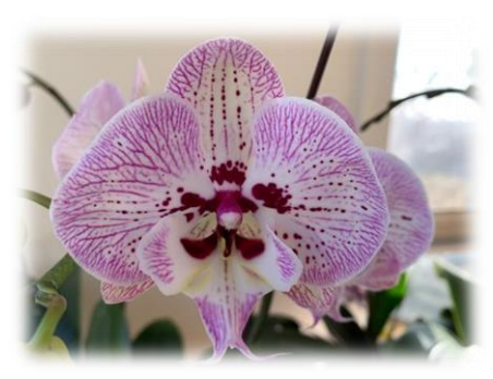
Phalaenopsis unnamed hybrid