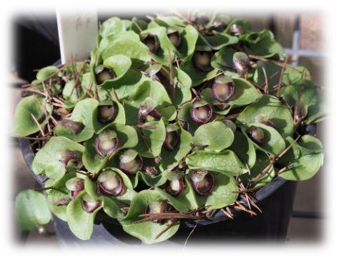
Corysanthes incurvus