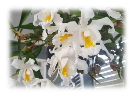
Coelogyne Unchained Melody