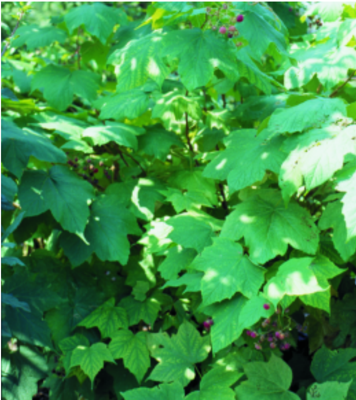
Figure 22. Thimbleberry habit.

Thimbleberry is a short, prostrate or erect deciduous shrub that is a close relative of cultivated raspberries (Figure 22). Typically, the plant grows from 1 1/2 to 8 feet. The canes live an average of 2 to 3 years and develop and fruit like raspberries. Fall color ranges from brilliant orange to maroon. The thimblelike fruit is an aggregate of red or scarlet pubescent drupelets that are dry at maturity and crumble readily when picked (Figure 23). Thimbleberry spreads vigorously through rhizomes and can form dense clonal thickets. In Michigan, thimbleberry grows wild in the north-