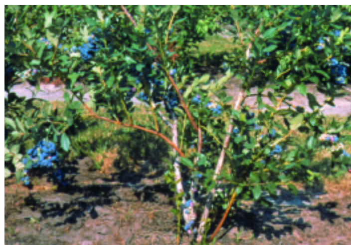
Figure 9. Half-high blueberry cultivar ‘Patriot’.