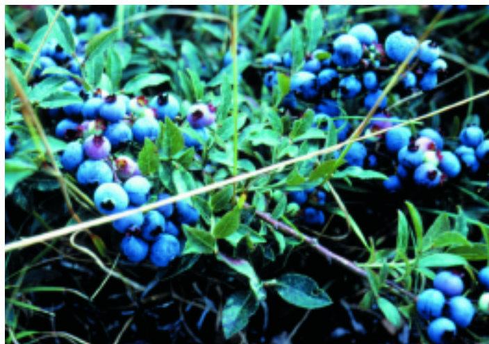
Figure 8. Lowbush blueberry with fruit.

some other Midwestern states. The highbush blueberry is an upright, non-spreading plant that grows 3 to 10 feet tall. The lowbush blueberry is a short (6 to 24 inches), spreading shrub found in many northern forests (Figure 8). Highbush and lowbush fruits are borne in clusters, have inconspicuous seeds, and vary in size and color. “Half-high” cultivars have been developed by hybridizing highbush and lowbush blueberries (Figure 9).