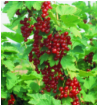
Figure 2. Red currant plant and fruit.