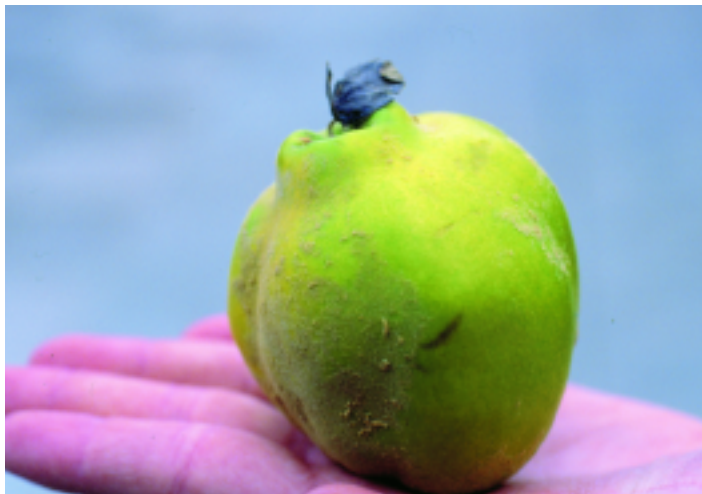
Figure 21. Quince fruit. Note brown pubescence.

quince are yellow or pink and hard and thus not usually recommended for fresh eating (Figure 21). They mature in October and weigh approximately 4 ounces.