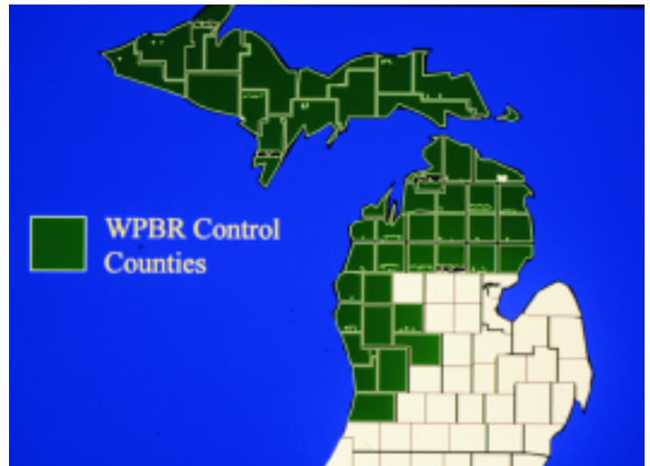
Figure 3. WPBR control area.

granted to grow WPBR-resistant black currant cultivars. In addition, a permit is needed to grow red and white currants and gooseberries within the WPBR control area (most northern counties and several southwestern counties, Figure 3). Again, a permit may be granted to grow WPBR-resistant red and white currants and gooseberries in the control areas. No permit is required to cultivate red and white currants and gooseberries outside of the WPBR con-