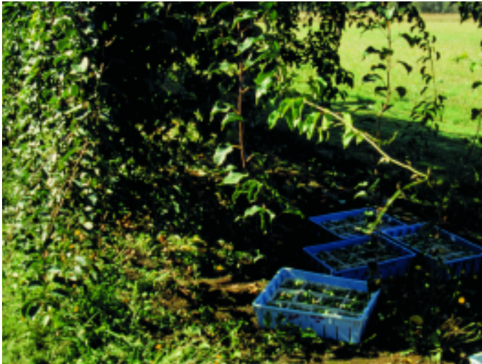
Figure 12. Hardy kiwi vine on trellis.

Actinidias have been cultivated as ornamentals and for their edible fruit. The smooth-skinned fruits can be consumed fresh without peeling. The flavor of hardy kiwi is considered superior to those in the grocery store because of their higher sugar content.