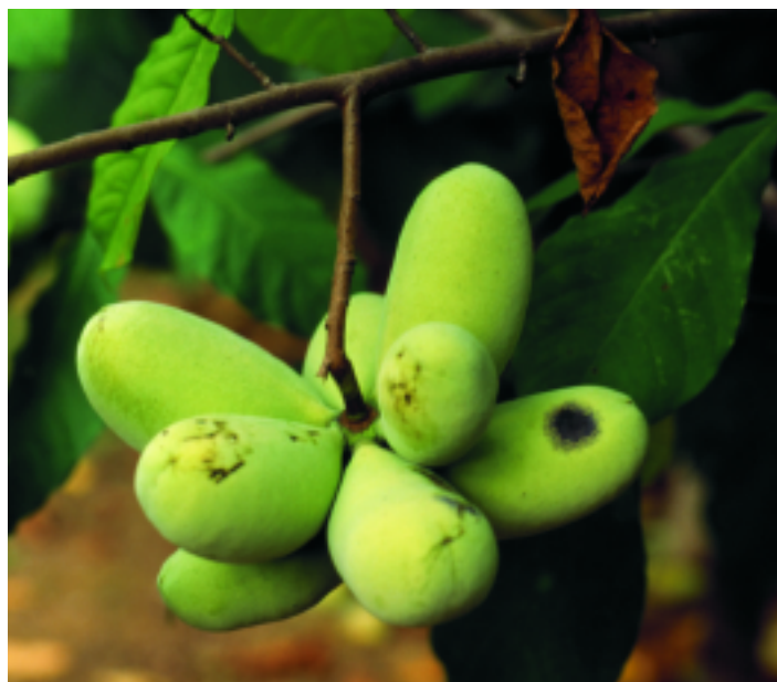
Figure 19. Pawpaw fruit cluster.