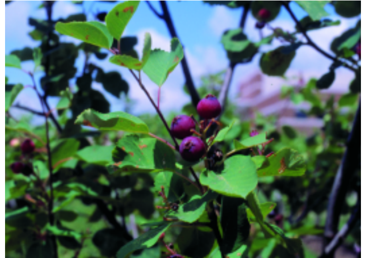
Figure 10. Saskatoon fruit.

' Regent ' - A compact form (4 to 6 feet) with very sweet