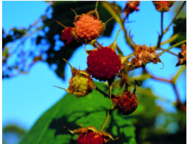
Figure 23. Thimbleberry fruit.

Thimbleberry thrives in a variety of dry to moist and wooded to open sites. The plants tolerate a wide variety of soil