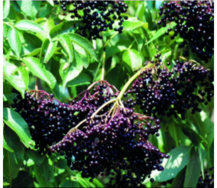
Figure 7. Elderberry fruit clusters.

Best fruit set is achieved by planting several types. The wood of wild elderberries is notably "pithy" and weak. Other elderberry species that can be found in the wild or in the nursery trade in the United States are the blue elder ( S. nigra ssp. canadensis = S. caerulea ), European elder ( S. nigra ), scarlet elder ( S. pubens ) and red elder ( S. racemosa ). Future taxonomic changes are likely for this genus.