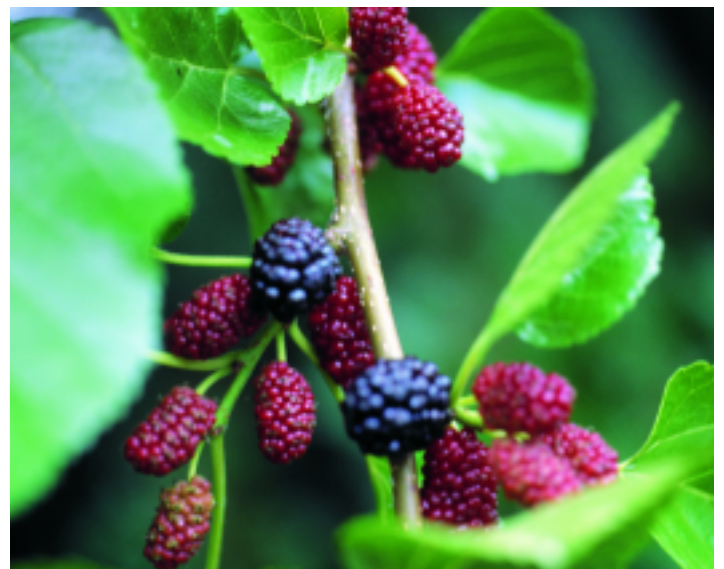
Figure 17. White mulberry fruit.