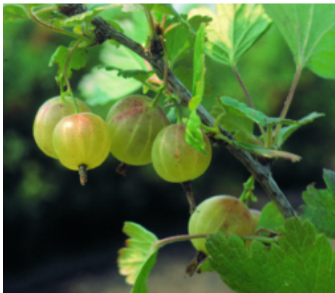
Figure 4. ‘Poorman’ gooseberries.

‘Josta’ - A black currant and American gooseberry hybrid. Plants are tall and thornless, tending not to branch but requiring a lot of space by maturity. Better for home than commercial use. Resistant to gray mold, mildew and WPBR.