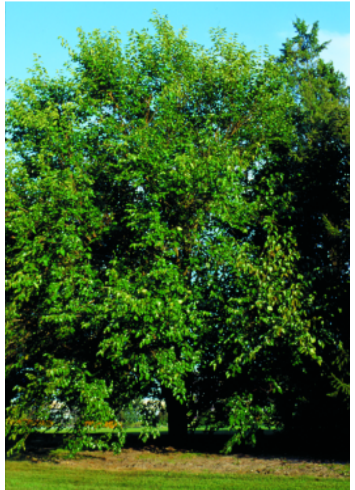
Figure 16. White mulberry tree habit.

var. tatarica - "Russian mulberry"; reputedly the hardiest of all mulberries.