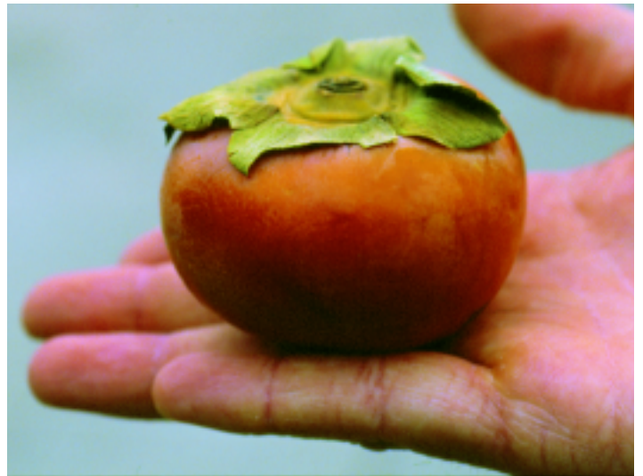
Figure 20. Kaki persimmon fruit.

The fruit is round or oval, reminiscent of some plum cultivars, and variable in size from 1/2 inch diameter to up to 2 inches (Figure 20). The skin is orange to black and usually has a heavy glaucous bloom. Fruit flavor and quality are variable, from good and sweet to flat and insipid. The flesh is usually very pungent and bitter until the fruit is soft ripe. Fully ripe persimmons lose this astringency. Frost apparently is not required for persimmon fruits to become edible. Numerous selections have been named and introduced, but regional testing of cultivars is limited. Below are some good choices for the Midwest.