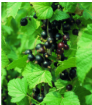
Figure 1. Black currant mature fruit.

Many Ribes serve as alternate hosts for the fungus Cronartium ribicola , which causes white pine blister rust (WPBR), a serious disease of white pine, an important forest and landscape tree. Many states have restricted the cultivation of some types of Ribes , so check with local authorities before purchasing plants. The cultivation of R. nigrum is prohibited in Michigan, but a special permit may be