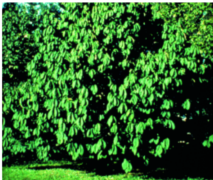
Figure 18. Pawpaw growth habit.

'Convis' - Produces large fruits (to 1 pound) with yellow flesh that mature in Michigan in the first week of October. 'Davis' - Selected from the wild in Michigan in 1959. Fruit are up to 5 inches long and weigh about 4 ounces. They