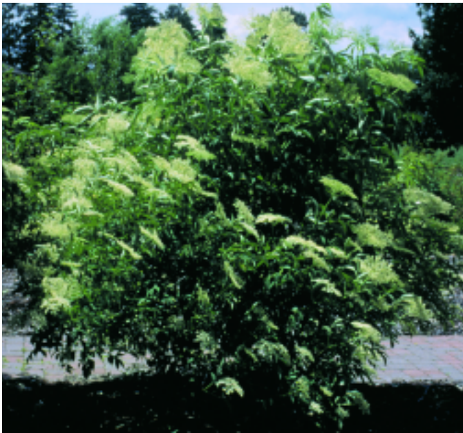
Figure 6. Common elder in full bloom.

Elderberries are fast-growing, spreading shrubs with multiple, pendulous branches (Figure 6). The common elder ( Sambucus canadensis ), the usual cultivated species, is native to much of the Midwest. Height reaches 5 to 12 feet. Fruits are produced in large (4 to 10 inches wide), flat clusters and are purple-black and about 1/4 inch in diameter (Figure 7). They mature in August or September. Some authorities report that people seldom consume the fresh mature fruit; drying or processing is said to increase palatability. Others report that the mature fruits are readily edible. The immature red fruits of all elderberry species should be avoided. Hydrocyanic acid and sambucine are active alkaloids in elderberries that render the immature red fruits toxic.