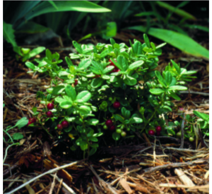
Figure 13. Lingonberry growth habit and fruit.

‘Splendor’ - Vigorous growing with moderate plant spread (runnering) and height (6 to 7 inches). Fruits up to 3/8 inch in diameter, brilliant red. Ripens in mid- to late September.