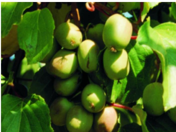
Figure 11. Hardy kiwi fruit.

There are more than 50 species in the genus Actinidia . The two species most suited to Midwest conditions are A. arguta (bower actinidia or hardy kiwifruit) and A. kolomikta (kolomikta actinidia). These species produce fruits about the size of grapes (Figure 11). A variant — A. arguta var. purpurea — should also be hardy through much of the Midwest. A. deliciosa , the large-fruited fuzzy kiwifruit, is not hardy enough to grow in the region.