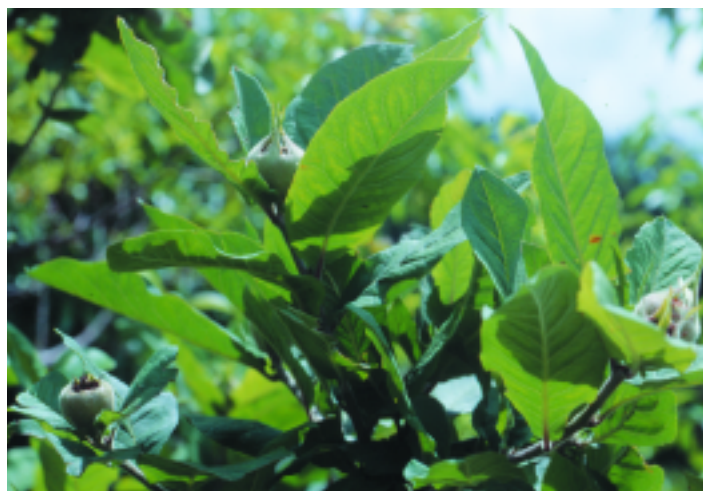
Figure 15. Medlar fruit: drupe or pome?

Medlars produce white to blush-pink flowers on spurs in the spring. The fruit has been variously described as a berry, a “turbinated” berry, a drupe, a haw and, most frequently, a pome (Figure 15). Baird and Theiret (1989) feel that it is best termed a drupe because of seed-containing stones. The fruits need to be “bletted” before they are palatable. Bletting involves leaving the fruit on the tree for one or more hard frosts, harvesting and then leaving the fruit in a cool, dark area for up to several weeks before consuming. The bletting process improves palatability by reducing tannin, asparagine and acid levels, increasing the sugar content and softening the fruit. Bletted fruit tastes similar to spiced applesauce and may have a pleasant vinous character.