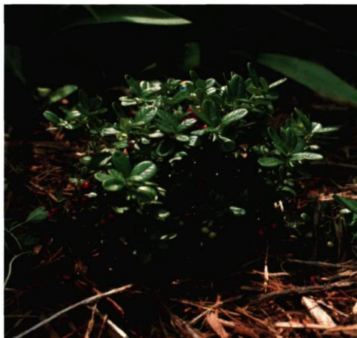
Figure 13. Lingonberry growth habit and fruit.

'Splendor' - Vigorous growing with moderate plant spread (runnering) and height (6 to 7 inches). Fruits up to 3/8 inch in diameter, brilliant red. Ripens in mid- to late September.