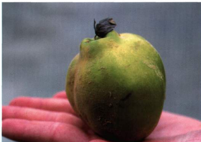
Figure 21. Quince fruit. Note brown pubescence.

quince are yellow or pink and hard and thus not usually recommended for fresh eating (Figure 21). They mature in October and weigh approximately 4 ounces.