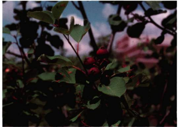
Figure 10. Saskatoon fruit.

' Regent ' - A compact form (4 to 6 feet) with very sweet