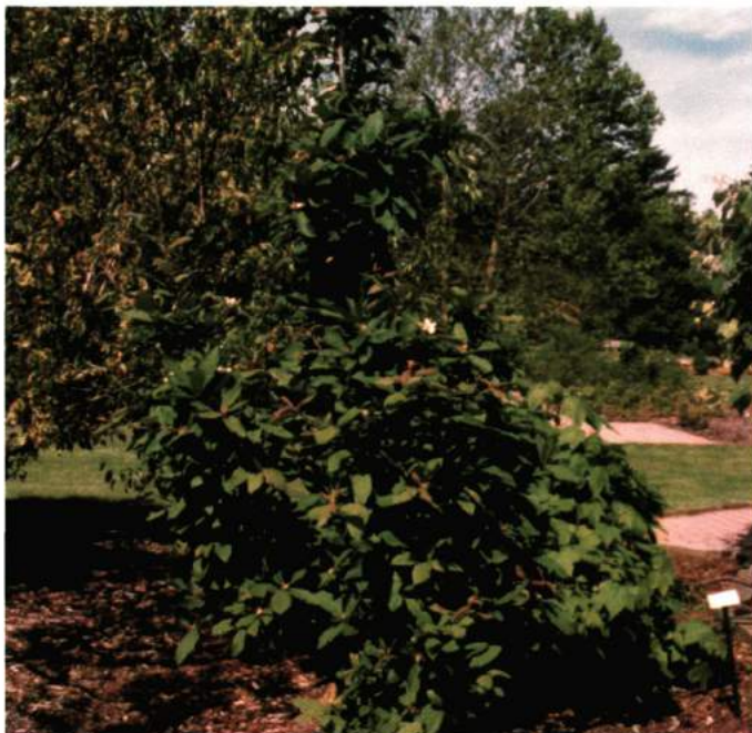
Figure 14. Young medlar tree.

The medlar is a small, self-fertile, deciduous tree that has been cultivated for perhaps 3,000 years. The Greeks and Romans were familiar with it, and the Babylonians and Assyrians may have cultivated medlars. Medlar is closely related to hawthorn ( Crataegus spp.) and pear ( Pyrus spp.). Trees can reach heights of 25 feet but may also occur as large shrubs or form dense thickets (Figure 14). The plants are frequently more broad than they are tall. Wild plants are thorny, but thorns are reduced or lacking in the cultivated forms. Growth rate can be up to 1 foot a year under favorable conditions.