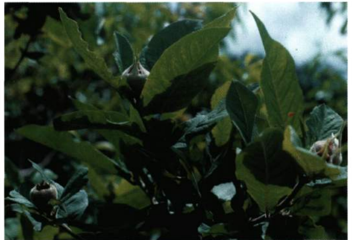
Figure 15. Medlar fruit: drupe or pome?

Medlars produce white to blush-pink flowers on spurs in the spring. The fruit has been variously described as a berry, a "turbinate" berry, a drupe, a haw and, most frequently, a pome (Figure 15). Baird and Theiret (1989) feel that it is best termed a drupe because of seed-containing stones. The fruits need to be "bled" before they are palatable. Bletting involves leaving the fruit on the tree for one or more hard frosts, harvesting and then leaving the fruit in a cool, dark area for up to several weeks before consuming. The bletting process improves palatability by reducing tannin, asparagine and acid levels, increasing the sugar content and softening the fruit. Bletted fruit tastes similar to spiced applesauce and may have a pleasant vinous character.