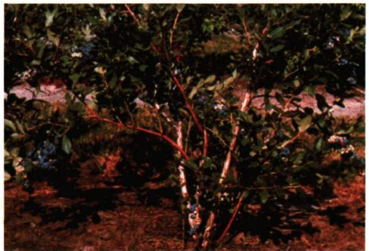
Figure 9. Half-high blueberry cultivar 'Patriot'.