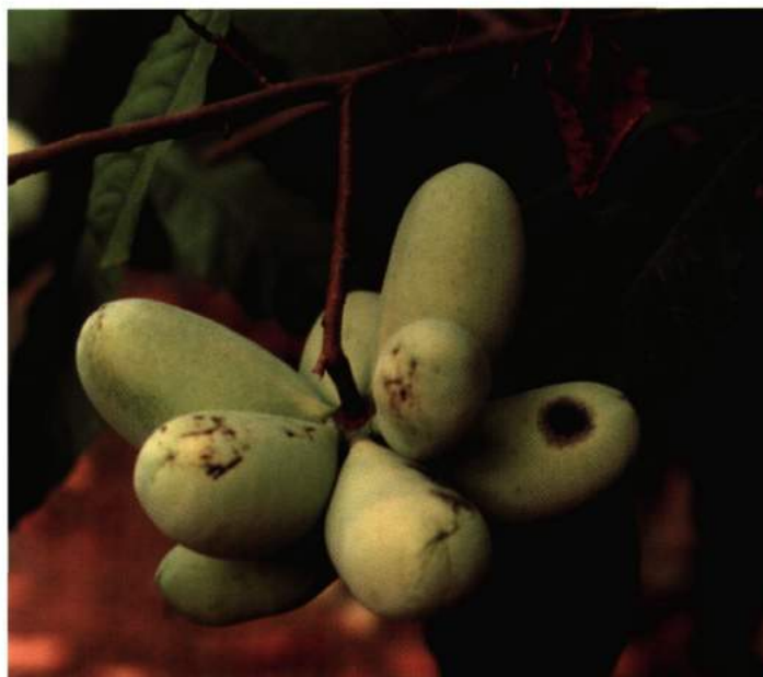
Figure 19. Pawpaw fruit cluster.