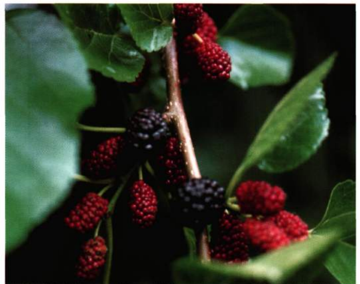
Figure 17. White mulberry fruit.