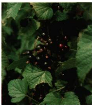
Figure 1. Black currant mature fruit.

Many Ribes serve as alternate hosts for the fungus Cronartium ribicola , which causes white pine blister rust (WPBR), a serious disease of white pine, an important forest and landscape tree. Many states have restricted the cultivation of some types of Ribes , so check with local authorities before purchasing plants. The cultivation of R. nigrum is prohibited in Michigan, but a special permit may be