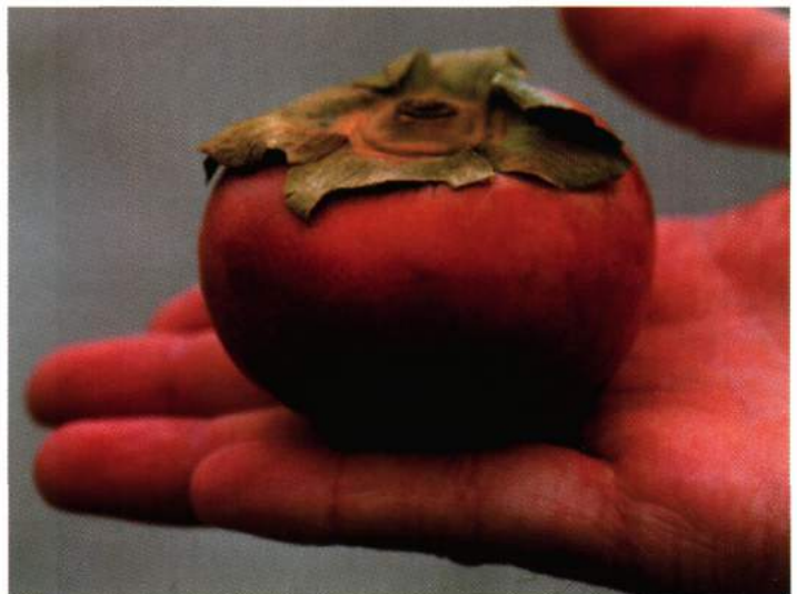
Figure 20. Kaki persimmon fruit.

The fruit is round or oval, reminiscent of some plum cultivars, and variable in size from 1/2 inch diameter to up to 2 inches (Figure 20). The skin is orange to black and usually has a heavy glaucous bloom. Fruit flavor and quality are variable, from good and sweet to flat and insipid. The flesh is usually very pungent and bitter until the fruit is soft ripe. Fully ripe persimmons lose this astringency. Frost apparently is not required for persimmon fruits to become edible. Numerous selections have been named and introduced, but regional testing of cultivars is limited. Below are some good choices for the Midwest.