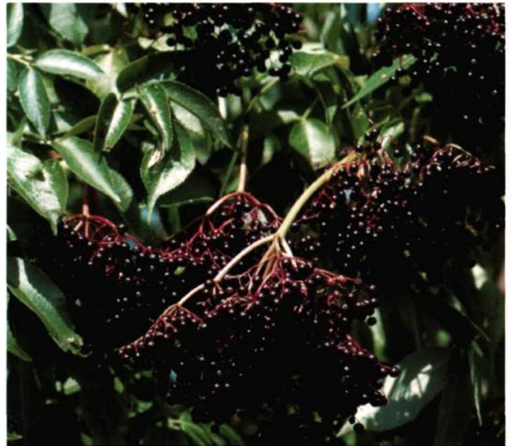
Figure 7. Elderberry fruit clusters.

Best fruit set is achieved by planting several types. The wood of wild elderberries is notably "pithy" and weak. Other elderberry species that can be found in the wild or in the nursery trade in the United States are the blue elder ( S. nigra ssp. canadensis = S. caerulea ), European elder ( S. nigra ), scarlet elder ( S. pubens ) and red elder ( S. racemosa ). Future taxonomic changes are likely for this genus.