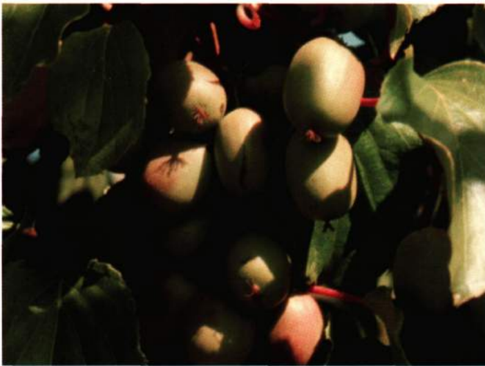
Figure 11. Hardy kiwi fruit.

There are more than 50 species in the genus Actinidia . The two species most suited to Midwest conditions are A. arguta (bower actinidia or hardy kiwifruit) and A. kolomikta (kolomikta actinidia). These species produce fruits about the size of grapes (Figure 11). A variant — A. arguta var. purpurea — should also be hardy through much of the Midwest. A. deliciosa , the large-fruited fuzzy kiwifruit, is not hardy enough to grow in the region.