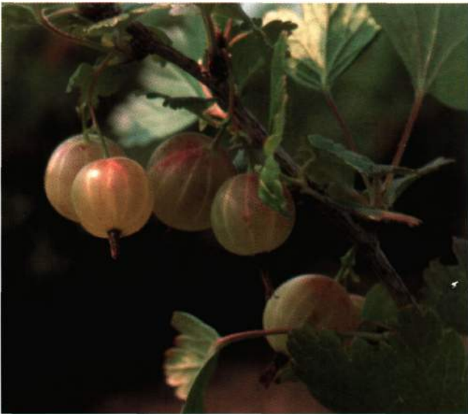
Figure 4. 'Poorman' gooseberries.

'Josta' - A black currant and American gooseberry hybrid. Plants are tall and thornless, tending not to branch but requiring a lot of space by maturity. Better for home than commercial use. Resistant to gray mold, mildew and WPBR.