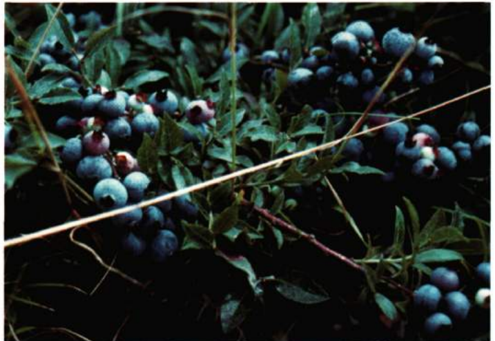
Figure 8. Lowbush blueberry with fruit.

some other Midwestern states. The highbush blueberry is an upright, non-spreading plant that grows 3 to 10 feet tall. The lowbush blueberry is a short (6 to 24 inches), spreading shrub found in many northern forests (Figure 8). Highbush and lowbush fruits are borne in clusters, have inconspicuous seeds, and vary in size and color. "Half-high" cultivars have been developed by hybridizing highbush and lowbush blueberries (Figure 9).