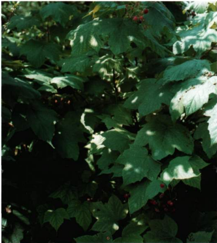
Figure 22. Thimbleberry habit.

Thimbleberry is a short, prostrate or erect deciduous shrub that is a close relative of cultivated raspberries (Figure 22). Typically, the plant grows from 1 1/2 to 8 feet. The canes live an average of 2 to 3 years and develop and fruit like raspberries. Fall color ranges from brilliant orange to maroon. The thimblelike fruit is an aggregate of red or scarlet pubescent drupelets that are dry at maturity and crumble readily when picked (Figure 23). Thimbleberry spreads vigorously through rhizomes and can form dense clonal thickets. In Michigan, thimbleberry grows wild in the north-