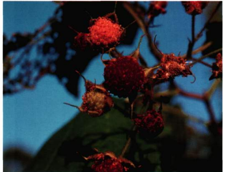
Figure 23. Thimbleberry fruit.

Thimbleberry thrives in a variety of dry to moist and wooded to open sites. The plants tolerate a wide variety of soil