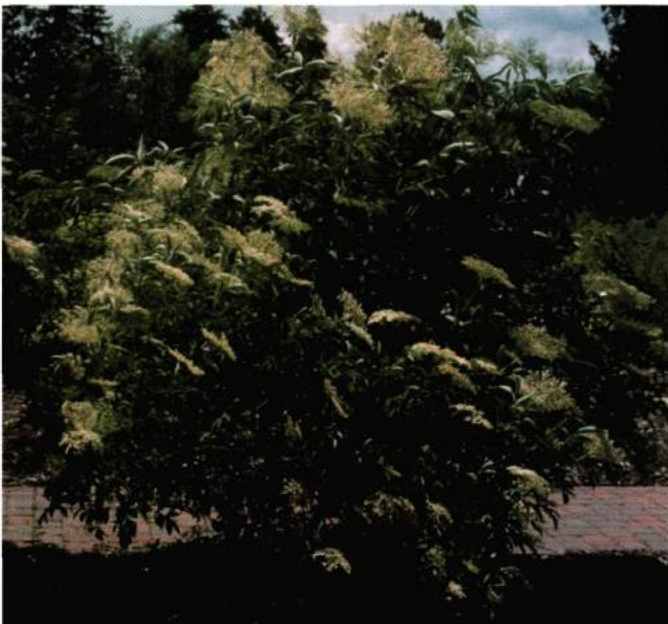
Figure 6. Common elder in full bloom.

Elderberries are fast-growing, spreading shrubs with multiple, pendulous branches (Figure 6). The common elder ( Sambucus canadensis ), the usual cultivated species, is native to much of the Midwest. Height reaches 5 to 12 feet. Fruits are produced in large (4 to 10 inches wide), flat clusters and are purple-black and about 1/4 inch in diameter (Figure 7). They mature in August or September. Some authorities report that people seldom consume the fresh mature fruit; drying or processing is said to increase palatability. Others report that the mature fruits are readily edible. The immature red fruits of all elderberry species should be avoided. Hydrocyanic acid and sambucine are active alkaloids in elderberries that render the immature red fruits toxic.