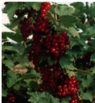
Figure 2. Red currant plant and fruit.