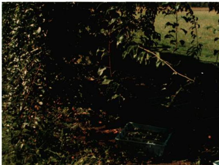
Figure 12. Hardy kiwi vine on trellis.

Actinidias have been cultivated as ornamentals and for their edible fruit. The smooth-skinned fruits can be consumed fresh without peeling. The flavor of hardy kiwi is considered superior to those in the grocery store because of their higher sugar content.