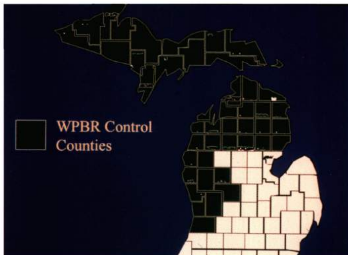
Figure 3. WPBR control area.

granted to grow WPBR-resistant black currant cultivars. In addition, a permit is needed to grow red and white currants and gooseberries within the WPBR control area (most northern counties and several southwestern counties, Figure 3). Again, a permit may be granted to grow WPBR-resistant red and white currants and gooseberries in the control areas. No permit is required to cultivate red and white currants and gooseberries outside of the WPBR con-