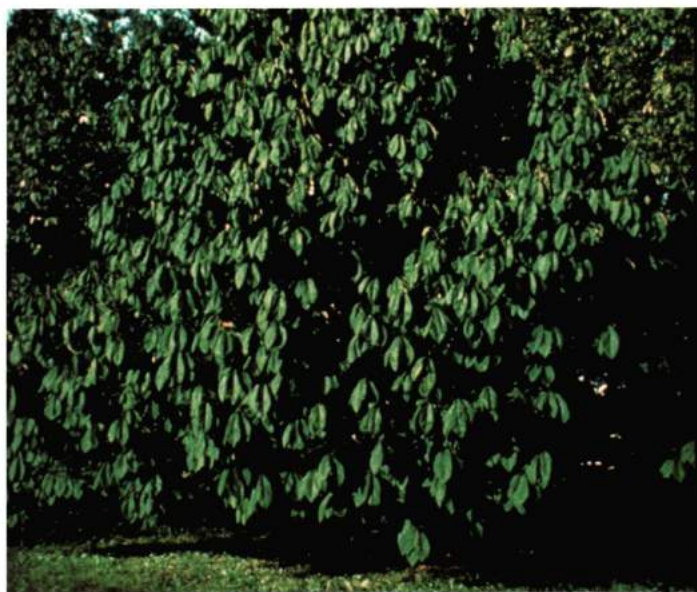
Figure 18. Pawpaw growth habit.

'Convis' - Produces large fruits (to 1 pound) with yellow flesh that mature in Michigan in the first week of October. 'Davis' - Selected from the wild in Michigan in 1959. Fruit are up to 5 inches long and weigh about 4 ounces. They