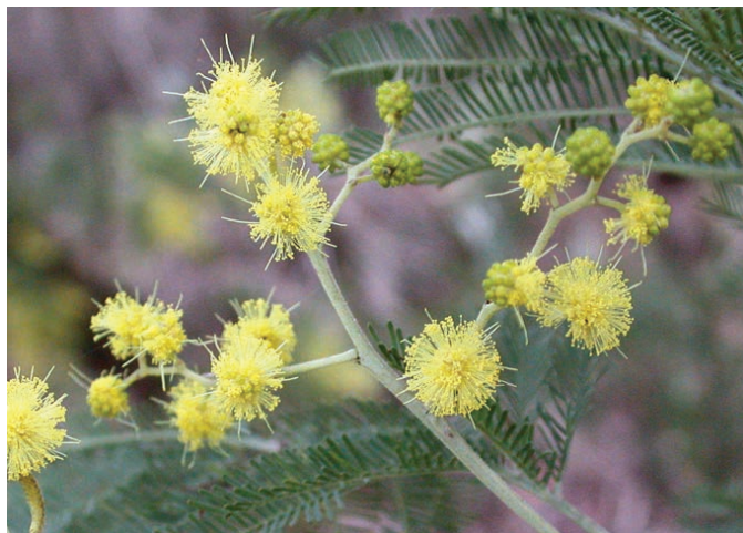
Silver wattle ( Acacia dealbata )

This area to the north and continuing along the track for 150 metres has been allowed to naturally regenerate.