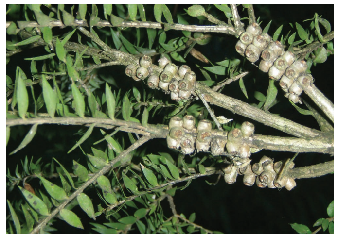
Scented paperbarks ( Melaleuca squarrosa ).

Although these are not abundant, if you look carefully near the bridge you might be able to spot one or two.