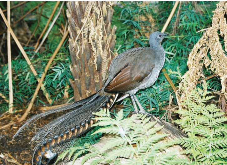
Superb Lyrebird ( Menura novaehollandiae ).

This is a good place to sit down, rest and enjoy the sounds of the bush. Listen and pay particular attention for the superb lyrebird ( Menura novaehollandiae ). These birds have their own unique call, but this is usually interwoven with mimicked calls of many other birds. Their own call varies between areas, but is generally a loud 'blick blick'. Males commonly sing during the breeding season (winter) while feeding and standing on logs or branches.