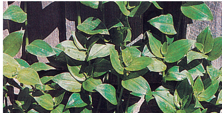
Wandering creeper ( Tradescantia fluminensis ).

Almost 100 species of indigenous plants live in Gembrook Park. One of the greatest threats to their survival is weeds which smother the indigenous plants and take away valuable nutrients, water, and sunlight. Weeds can sometimes come out of our own gardens, for example, the wandering creeper ( Tradescantia fluminensis ), English holly ( Ilex aquifolium ), forget-me-not ( Myosotis sylvatica ), blackberry ( Rubus fruticosus ), and panic veldt-grass ( Ehrharta erecta ), all unfortunately have made a home for themselves in this location.