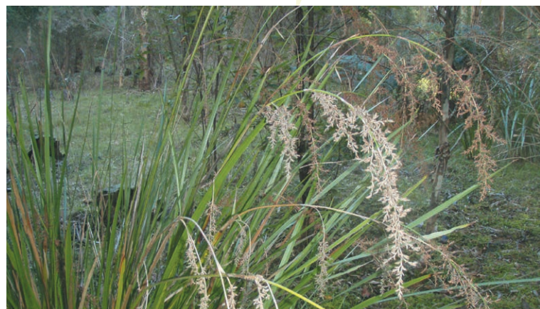
Tall sword-sedge ( Lepidosperma elatius )

Austral mulberry ( Hedycarya angustifolia ) was another shrub important to Indigenous people, for food, but also to light fires. The shoots that come up from these trees are long and straight and could be used as fire drills.