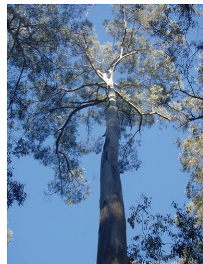
Mountain grey gum ( Eucalyptus cypellocarpa ).

The lowest layer of plants is slightly more open and allows the light to reach the ground, favouring forest wire grass ( Tetrarrhena juncea ), tall sword sedge ( Lepidosperma elatius ), and purple-sheath tussock grass ( Poa ensiformis ) underneath.