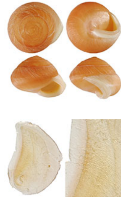
Photo(s): Views of a Hendersonia occulta shell with classic cinnamon color, and the species' aperture cover, or operculum. This species and Pomatiopsis lapidaria are the only native Virginia land snails with opercula.