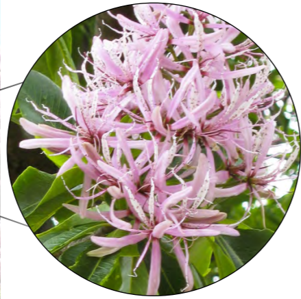
Calodendron capense (Cape chestnut)