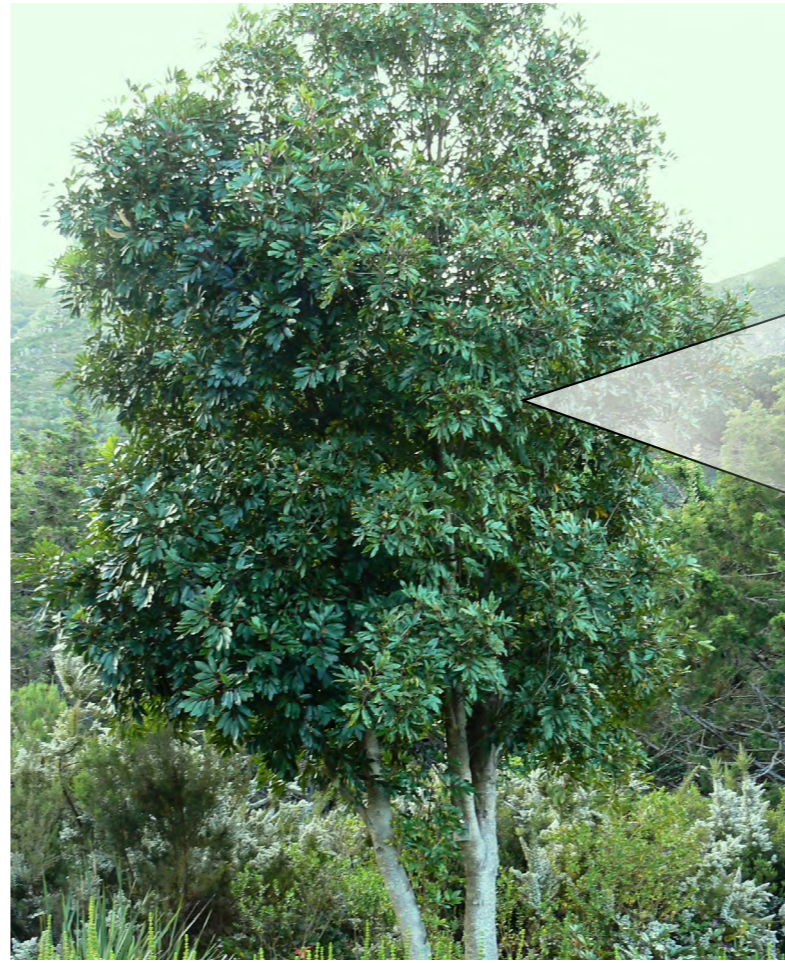
Cunonia capensis (Butterspoon tree)