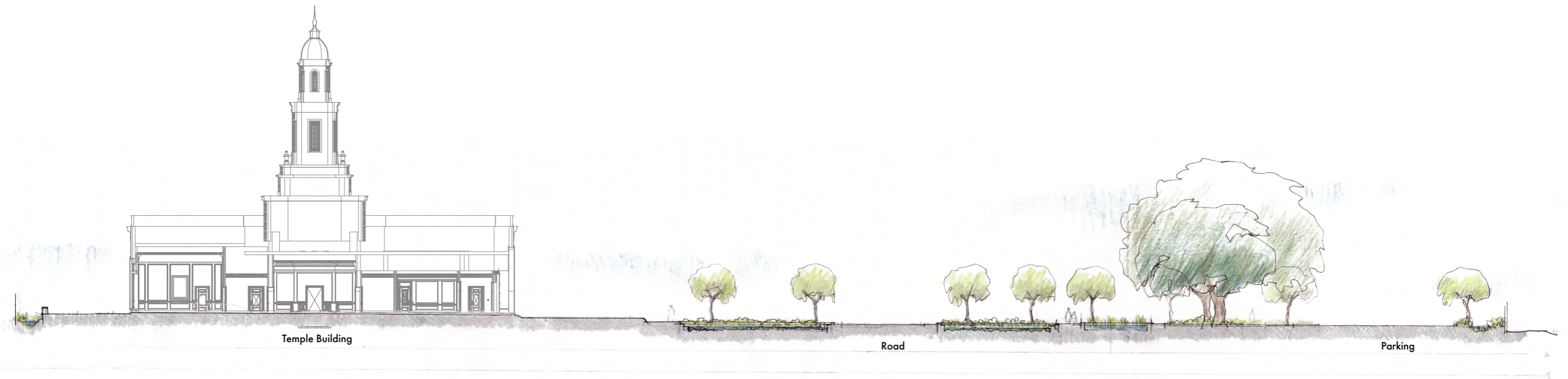
Section C - Temple approach and arrival space with adjacent bioretention basin planters