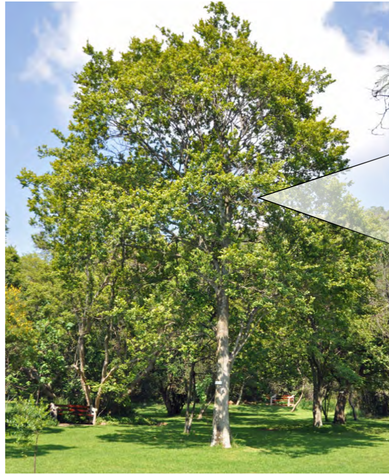
Celtis africana (White stinkwood)