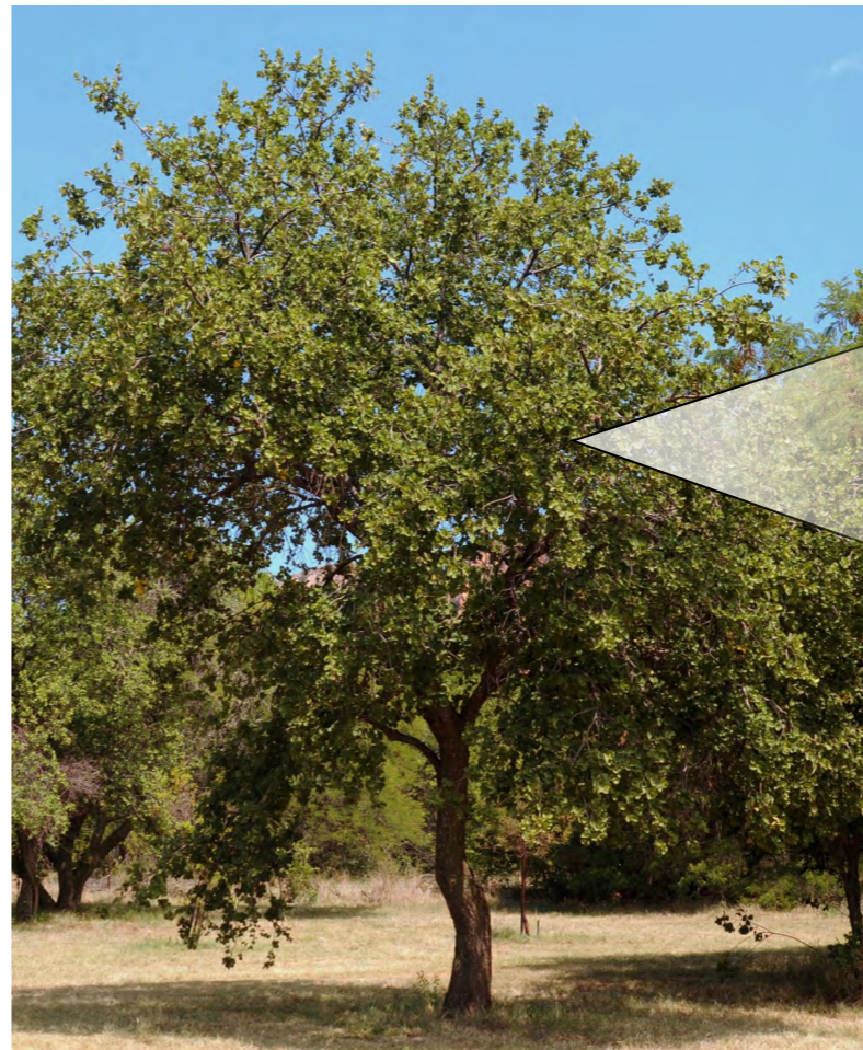
Searsia pendulina (White karee)