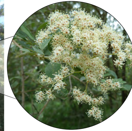
Buddleja saligna (False olive)