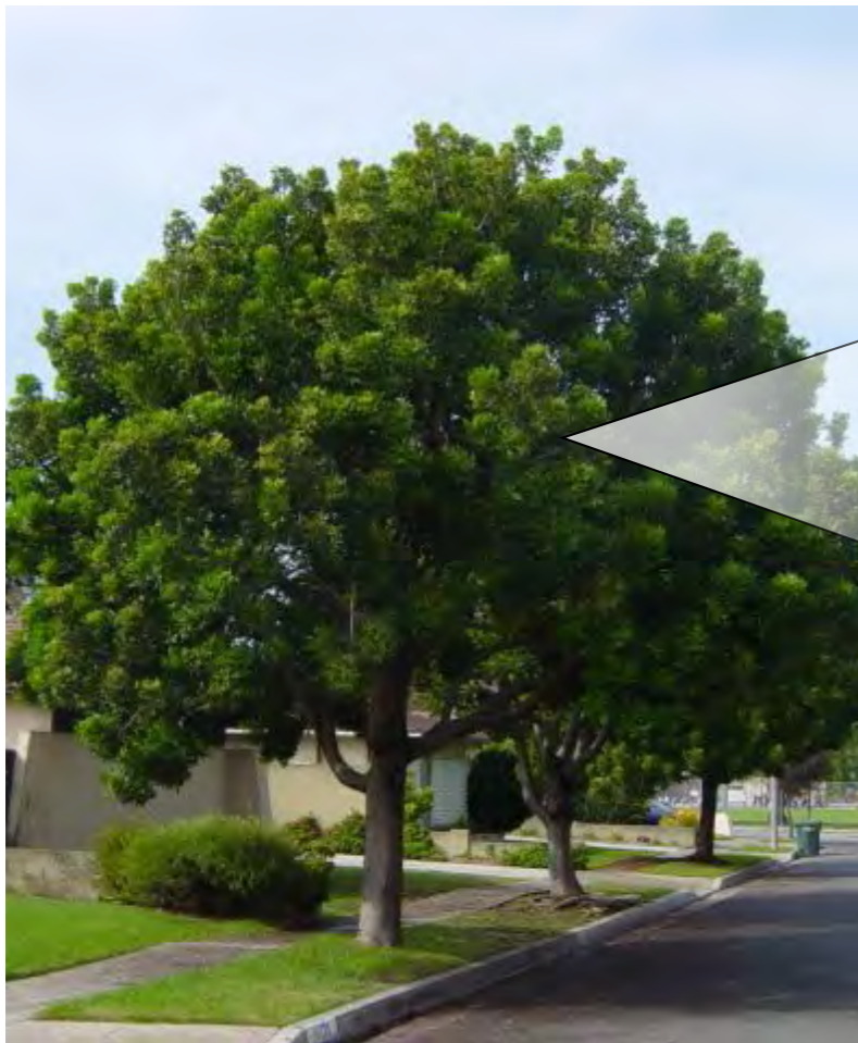
Harpephyllum caffrum (Wild plum)