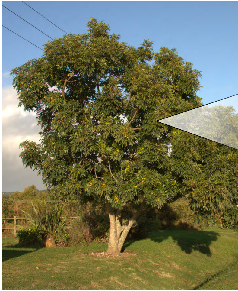
Ekebergia capensis (Cape ash)