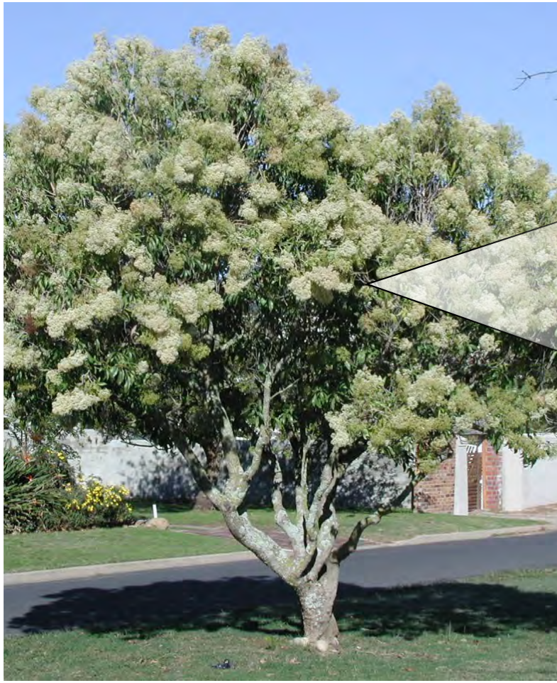
Nuxia floribunda (Elder forest)