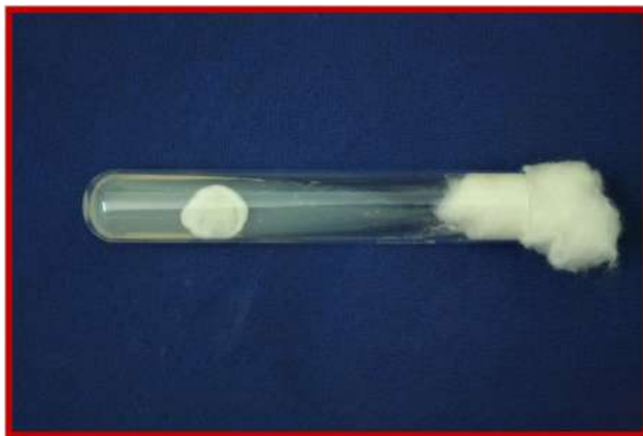
Figure 2: Colony of Acremonium zeylanicum subcultured in SDAY medium