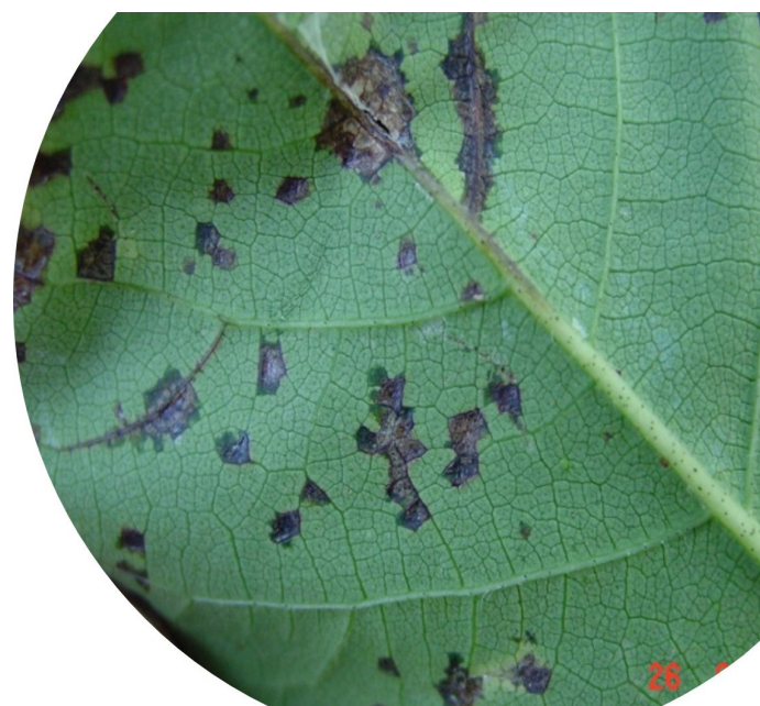
Figure 2. Bacterial blight lesions defined by leaf veins.

Plant tissues are infected via wounds caused by sandblasting, storm damage, or insect damage. Plants infected with bacterial blight can be further infected by opportunistic fungal pathogens that are present in the field.