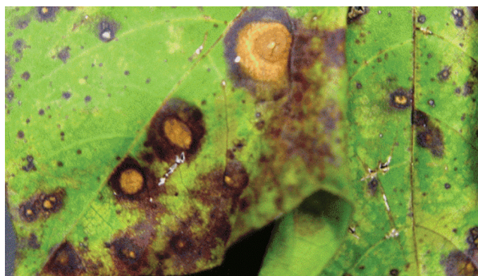
Figure 1. Target leaf spot lesions with concentric circles.

Rank growth contributes to infection. Controlling growth with a timely plant growth regulator application and scheduled irrigation is recommended. A fungicide application can help reduce infection and subsequent premature defoliation. Maximum control has been observed when strobilurin fungicides are applied between the first and third weeks of bloom. A second application should be considered if infection continues to spread three weeks after the initial fungicide application. However, yield response to fungicide application for target spot can be extremely variable. There can be as little as no yield advantage observed to as much as 200 lb/acre. 1