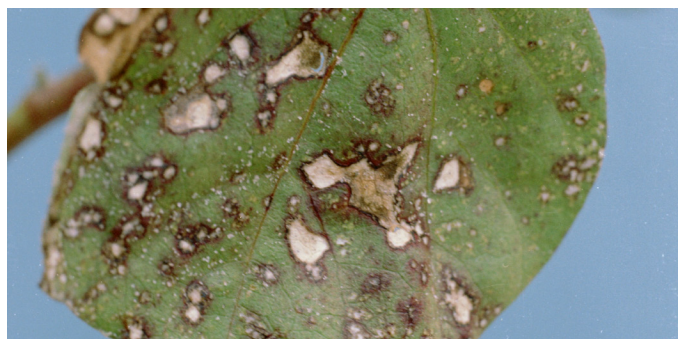
Figure 4. Symptoms of Ascochyta blight.

Ascochyta blight infection generally does not impact yield potential. However, young cotton can be more severely affected. 2 Fungicides can be effective at controlling this disease, but application is rarely warranted. 1