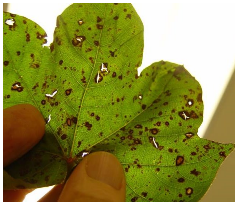
Shot-hole appearance often associated with Stemphylium leaf spot on cotton.

Foliar Symptoms: Stemphylium Leaf Spot lesions are 2 cm in diameter (~1 inch), circular in shape and brown in color with concentric zones. As lesions mature they will develop a whitish center that may crack and fall out producing a “shot-holed” appearance. The lesions normally form on the upper leaves in the canopy and start at the leaf margin and move inward. Fields where Stemphylium Leaf Spot is severe also typically demonstrate symptoms of nutrient deficiency.