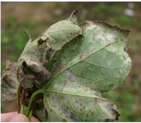
Symptoms of Areolate Mildew. Note brown necrotic lesions and powdery white sporulation on underside of leaf. (Appling County Georgia).