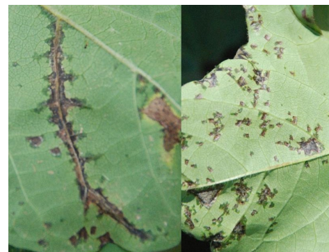
Close-up of lesions of Bacterial Blight. (Photo credit: Tom Allen).

Range and Yield Loss: Bacterial Blight is a major disease of cotton. Since acid delinting of cottonseed in the U.S., Bacterial Blight has been rare, except in OK and TX; however, there is a recent resurgence in additional states. Yield loss can be severe, up to 20%, depending on variety and pathogen race.