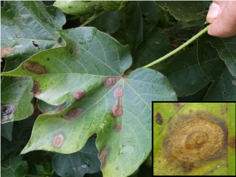
Typical symptomatic lesion of Target Spot.