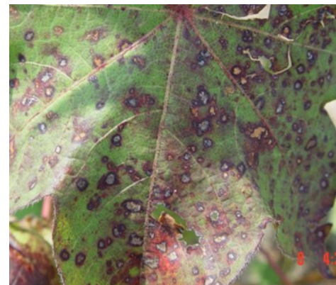
Foliar symptoms of Stemphylium leaf spot. Note the “ashy” centers of the spots and the reddening of the leaf associated with stress on the plant.

Management: Managing for vigorous crop growth by irrigating to avoid drought stress, proper fertilization, and reducing pest pressure will help reduce the incidence of disease outbreaks. Fungicides are available, but are not normally economical for the control of Stemphylium Leaf Spot.