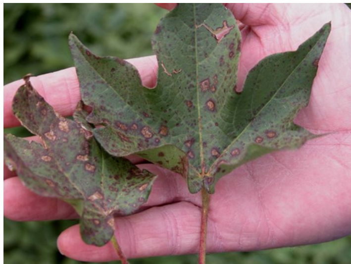
Foliar symptoms of Alternaria leaf spot. (Photo credit: J.E. Woodward).

Spot is more commonly observed in Texas and the Mid-South and Stemphylium Leaf Spot in the Southeast. Lesions with concentric rings may appear similar to Target Spot; however, spots from Alternaria Leaf Spot will occur throughout the canopy and are also associated with reddening and yellowing leaves.