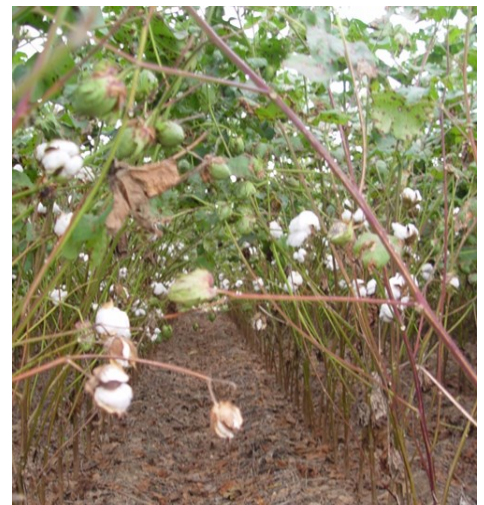
Interior defoliation commonly observed with Target Spot.

Range and Yield Loss: Target Spot has become progressively more widespread in the Southeast and Mid-South regions of the Cotton Belt, but is most severe in Florida, Alabama and Georgia. In severe cases, yield losses exceeding 200 lbs lint/A have been documented.