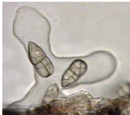
Spores of Stemphylium solani , causal agent of Stemphylium leaf spot. (Photo credit: Rome Ethredge).