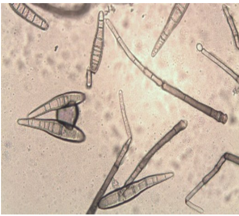
Typical spores of Corynespora cassiicola , causal agent of Target Spot.