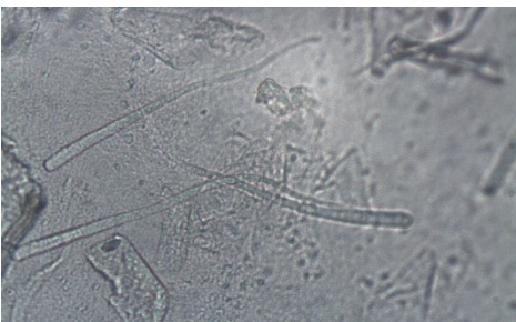
Tapered cylindrical spores of Cercospora gossypina .