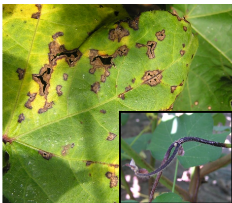
Dark-brown angular lesions and 'black arm' of petioles of Bacterial Blight.