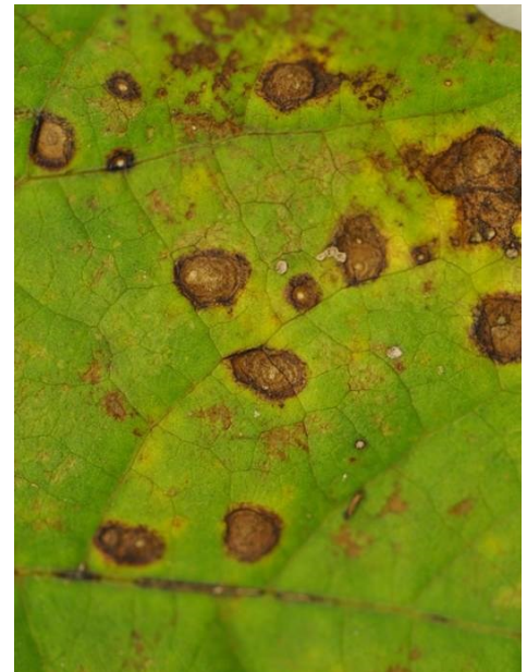
Foliar symptoms of Cercospora Leaf Spot.

Range and Yield Loss: Cercospora Leaf Spot occurs in all cotton producing areas within the U.S. When Cercospora Leaf Spot occurs while plants are under stress, or in a disease complex with Alternaria or Stemphylium Leaf Spot, premature defoliation, reduced yield, and lower fiber quality have been documented.