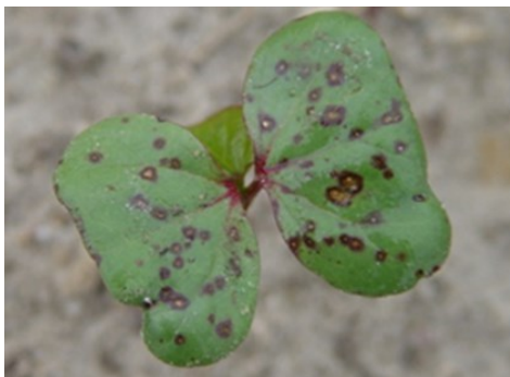
Early-season symptoms of Ascochyta Blight on cotyledons of cotton.

Foliar Symptoms: Ascochyta Blight forms lesions on cotyledons, leaves, stems, and bolls. Lesions on the cotyledons and leaves approach 2 mm (<0.1 in) in diameter, are white to light brown and circular in shape. Elongated cankers on the stem are reddish-purple to black or ash gray in color. Small, black fruiting structures are likely to be embedded in symptomatic tissue.