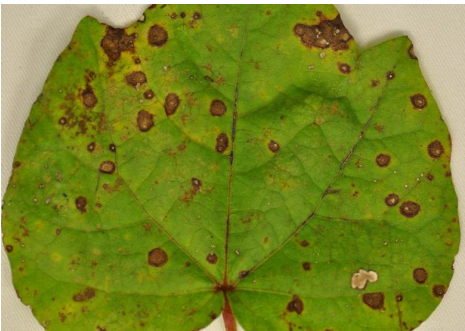
Cercospora lesions on cotton leaf.