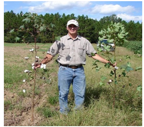
Premature defoliation from Areolate Mildew in Appling County, GA. Plant on left was not treated. Plant on right was treated twice with a strobilurin fungicide.

Range and Yield Loss: Areolate Mildew is observed in most countries where cotton is produced, but not commonly observed in the U.S. In Georgia, the disease is typically restricted to the extreme southeastern counties. This disease normally appears late in the season and usually causes little yield loss.