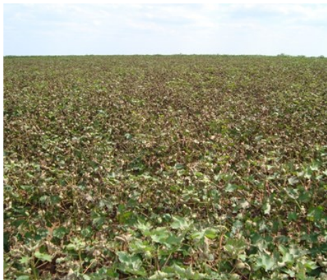
Cotton field in Texas severely affected by Alternaria leaf spot.

Diagnostic Note: Symptoms of Alternaria and Stemphylium Leaf Spots are similar; however, Alternaria Leaf Spot is more commonly observed in Texas and the Mid-South and Stemphylium Leaf Spot in the Southeast. Lesions with concentric rings may appear similar to Target Spot; however, spots from Alternaria Leaf Spot will occur throughout the canopy and are also associated with reddening and yellowing leaves.