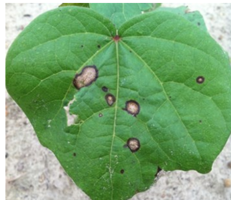
Symptoms of Ascochyta Blight on cotton leaf. Note dark border and small, embedded fruiting structures in the spots.

Range and Yield Loss: Ascochyta Blight has been reported in most major cotton producing regions. Yield loss is rarely reported, but is possible under conditions such as prolonged cloudy weather with cooler temperatures and rainfall.