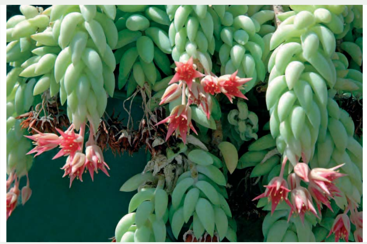
Fig. I Sedum morganianum in cultivation