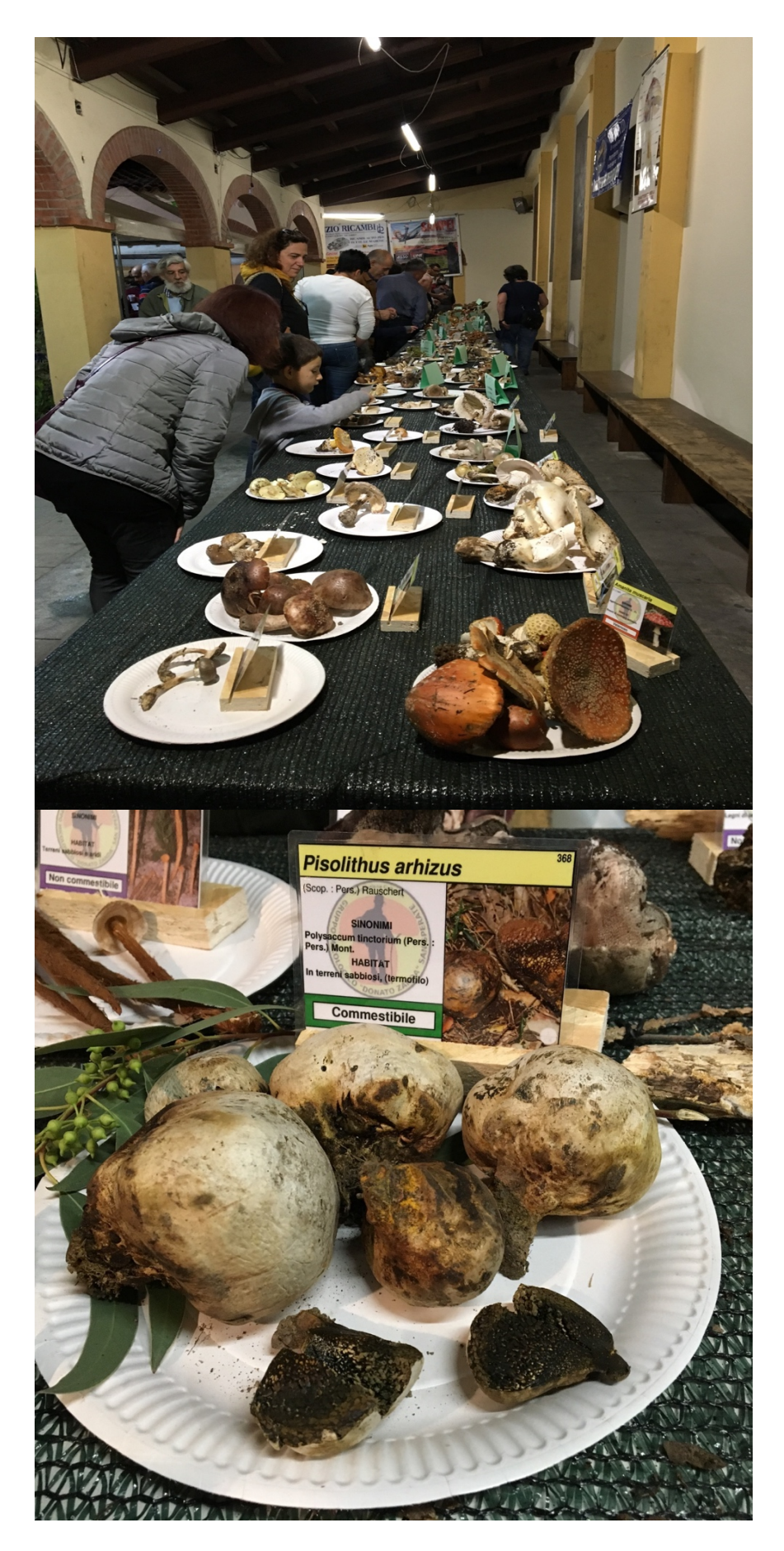
Fig. 10 – Snapshots from a mycological exhibition organized by a local club in San Sperate, Cagliari, November 2016.