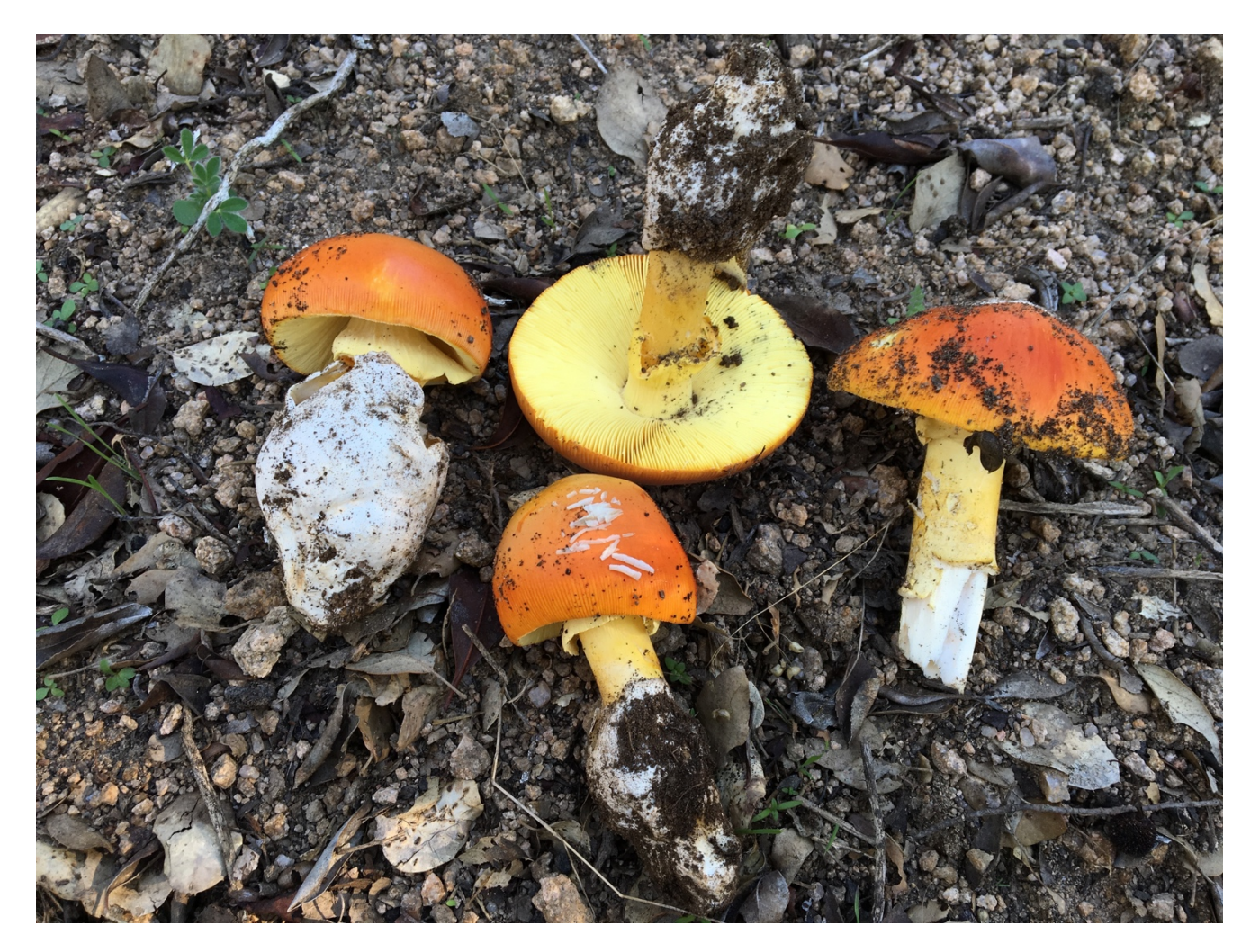
Fig. 3 – Amanita caesarea (Scop.) Pers., one of the best edible ectomycorrhizal mushrooms to be found in the Mediterranean area. These are from a xerophile mixed Quercus ilex–Q. suber forest in Santadi, Cagliari.

Fig. 2 – The edible and much sought after Leccinellum corsicum (Rolland) Bresinsky & Manfr. Binder, or cardolinu 'e murdegu . Originally described as Boletus corsicus by Rolland in 1896 and then as Boletus sardous by Belli & Saccardo in 1903 (Belli 1903). The main diagnostic characters (besides the habitat, strictly linked to Cistus ) are clearly visible: cap convex, dark brown to almost blackish; stipe usually stout, pale-yellow to yellow, covered with rusty or brown granules; tubes pale-yellow to yellow, pores concolorous with tubes, sometimes tinged rusty, darkening to somewhat ochraceous when bruised (see http://boletales.com/ for more info).