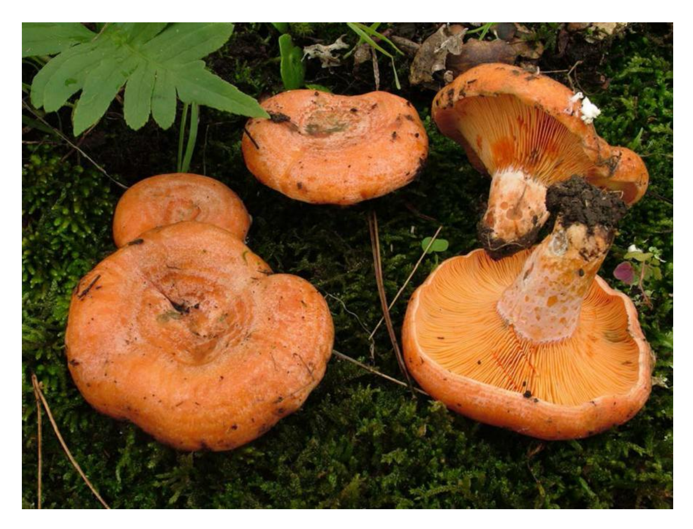
Fig. 7 – Lactarius deliciosus (L.) Gray, the saffron milkcap, an edible and much appreciated species, commonly found under Pinus . In this case, it was curiously reported from a "mono-specific Abies alba plantation", located in north-west Sardinia, on the Limbara mountain (see Ambrosio et al. 2015). In reality, the study site is characterized by the presence of both allochthonous conifers ( A. alba, A. cephalonica, Pinus nigra, Cedrus atlantica ) and indigenous oak species (Ambrosio et al. 2014).

generated apprehension", wrote Sardinian mycologists Brotzu & Colomo (2009a).