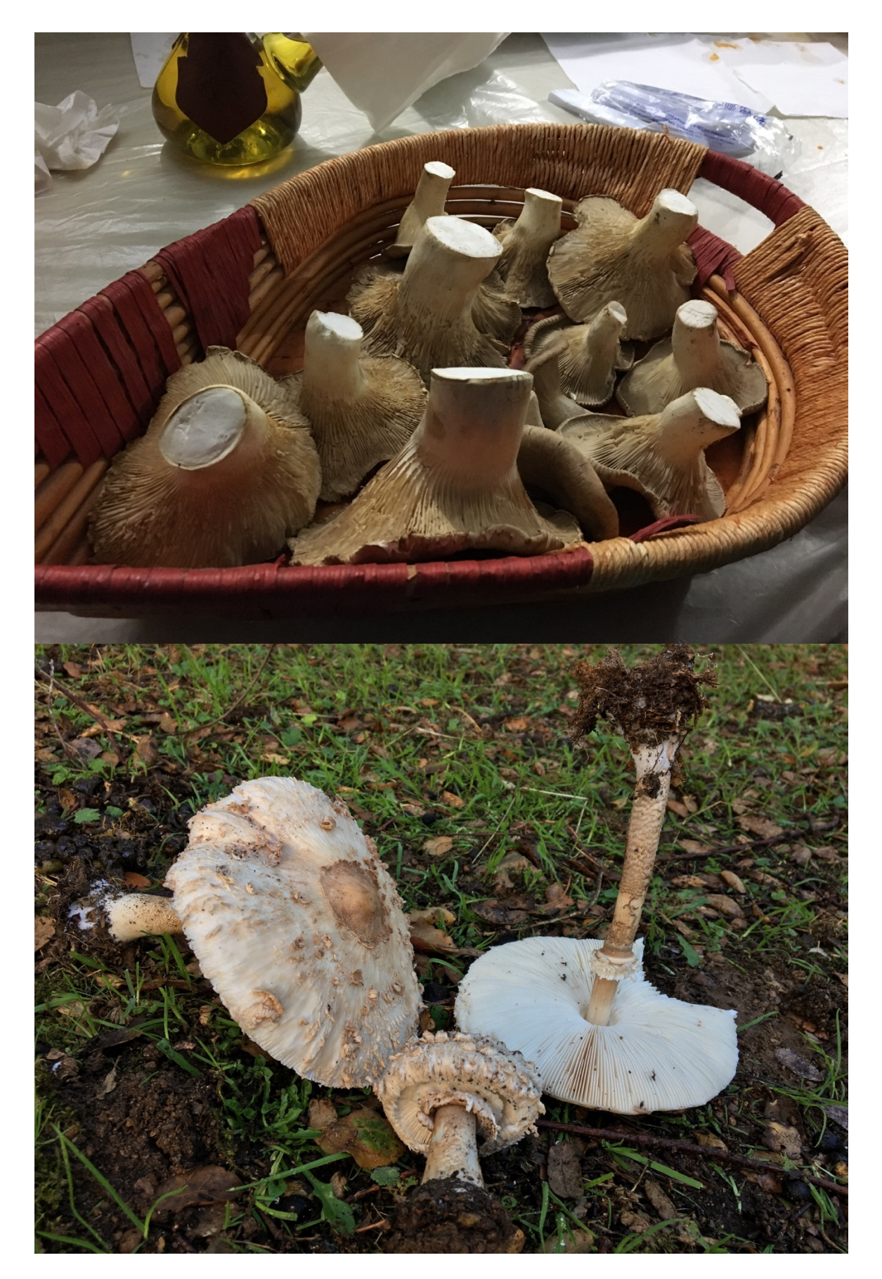
Fig. 8 – Saprobic edible mushrooms in Sardinia. Above, a basket of freshly picked Pleurotus eryngii (DC.) Quél., known locally as antunna , on display at a fair in Settimo S. Pietro, Cagliari. Below, Macrolepiota procera (Scop.) Singer, growing in a Quercus suber (cork oak) forest in the proximity of Iglesias, south-western Sardinia.