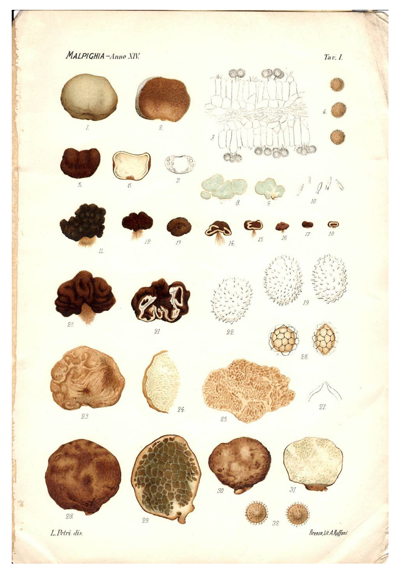
Fig. 1 – Original table from the seminal work of Mattirolo (1900) on the hypogeous fungi of Sicily and Sardinia. Drawings from 28 to 31 depict Terfezia fanfani , which Mattirolo described in this work on the basis of specimens from Sardinia.