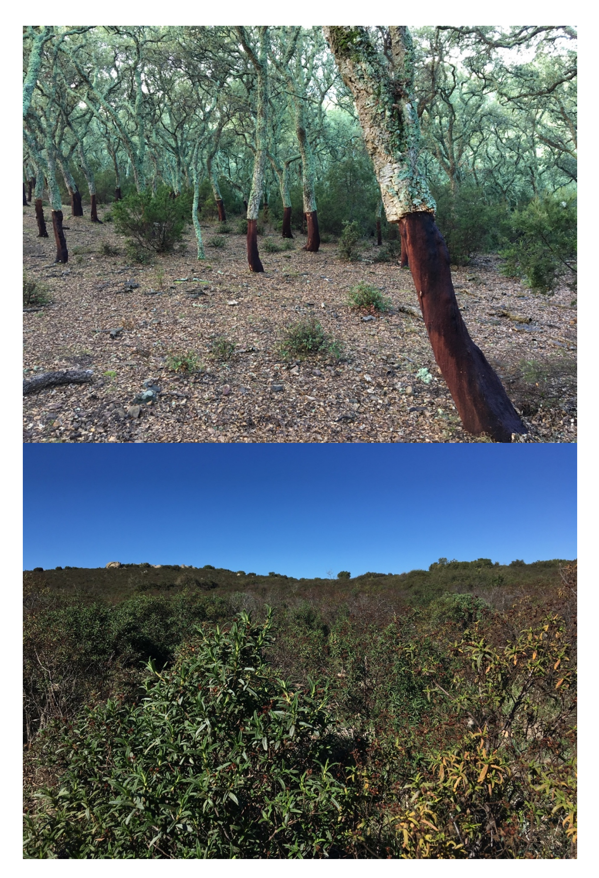
Fig. 6 – Ectomycorrhizal habitats in Sardinia. Above, a Quercus suber (cork oak) forest in the proximity of Iglesias, south-western Sardinia. These are much anthropized woods, where the presence of Q. suber has been favoured at the expenses of other co-occurring species, such as Q. ilex . Below, Cistus -dominated shrubland in the Sette Fratelli area (south-eastern Sardinia). Cistus creticus , C. monspeliensis and C. salvifolius usually co-occur in this type of habitat.