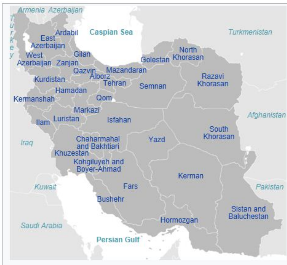
Fig. 1 – Provinces of Iran ( https://en.wikipedia.org/wiki/Iran )