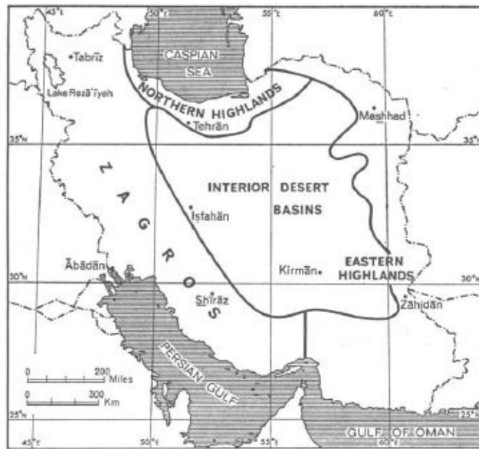
Fig. 2 – Iran: Physiographic units (Fisher 1968)

(Zagros) and north (Alborz) occupying the entire western and northern parts of the country. Many species of cercosporoids and ramularioids are distributed in Zagros and northern highlands, whilst interior desert basins and eastern highlands showed minimum distribution and diversity. Parsa (1978) divided provinces of Iran into 9 biotic provinces (Fig. 3). Caspian Sea area (including Gilan, Golestan, Mazandaran Provinces) comprises maximum distribution of Cercospora and Cercospora -like genera. Those provinces have high biodiversity of plant coverage and maximum rainfall. Kohgiluyeh & Boyerahmad Province (Zagrosian area) showed the highest distribution of Ramularia species. The latter province is endowed with rich floral diversity. Kavirian, Lutian and Bazmanian provinces represented the minimum distribution and diversity of both cercosporoids and ramularioids.