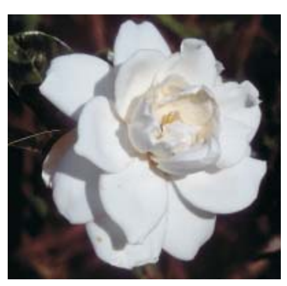
Gardenia jasminoides—common gardenia, Cape jasmine, (Hawaiian) kiele

The thick, glossy, dark green leaves are opposite, oval or narrow, 3–5 inches long, and 1-1\frac{1}{2} inches wide. Leaf arrangement is a whorl. The waxy, highly fragrant white flowers, 2–5 inches across, are commonly borne singly in the leaf axes. Depending on the cultivar, the flowers can be either single or double. The fleshy, ovoid fruit is an orange capsule about \frac{1}{2}-1\frac{1}{2} inches long, containing many seeds.