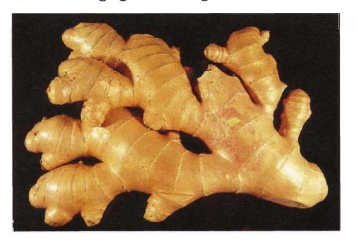
Figure 1. "Hand" of mature ginger root that has been cured.

About 2000 lb (907 kg) of seed is required to plant an acre of ginger with the average conversion ratio of seed to crop of 1:20. Seed size used in commercial production varies from 4 to 8 oz (113-227 gm), depending on the time of planting. The yield is not affected by seed size when planting occurs in early spring; however, late plantings benefit greatly from larger seed size. Increased seed density results in increased yield but also in an increase of tangled rhizomes, which creates problems in harvesting and in rhizome quality.