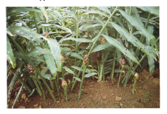
Figure 3. Ginger plants flowering in late September.

The natural senescence of ginger, which occurs in January, is triggered by flowering in late September, regardless of time of planting. Harvesting before senescence can be facilitated by trimming the tops of the ginger plant two to three weeks before the anticipated harvest date. This stimulates the formation of an abscission zone between the rhizome and the pseudostem.