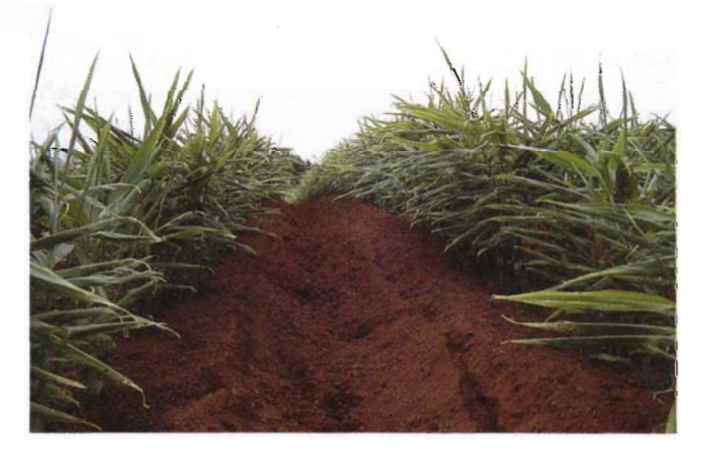
Figure 2. Young ginger plants that have been hilled with the aid of a tiller.