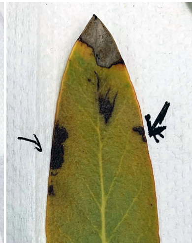
Marginal Leaf Necrosis