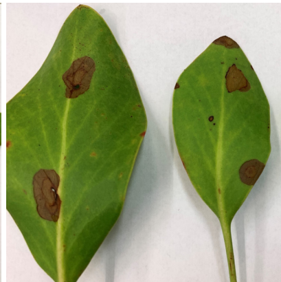
Brown Leaf Spot