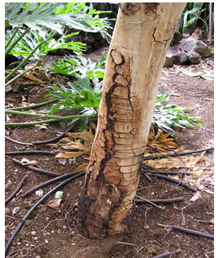
Phomopsis stem canker of a shower tree, associated with over-irrigation.