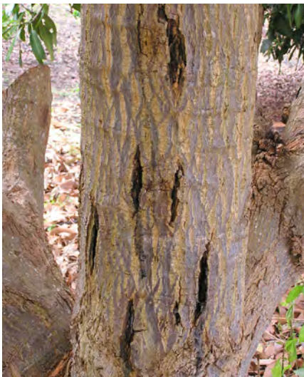
Stem cankers may consist of longitudinal splits in the bark (here, Acacia koa ).