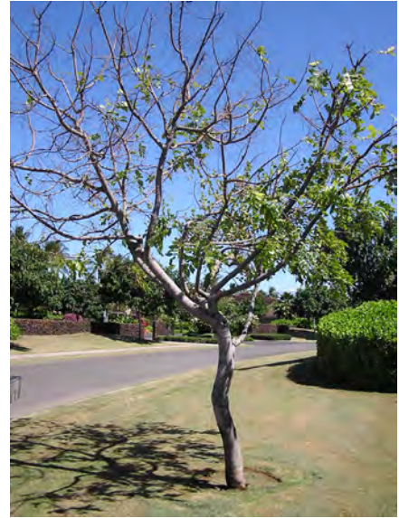
Dieback of shower tree planted too deeply in resort landscape.