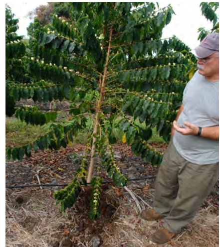
Leaves of coffee with Pythium root rot may flag or droop downward.