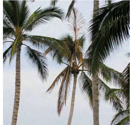
The youngest leaf, brown and dead, is the diagnostic symptom for coconut heart rot.