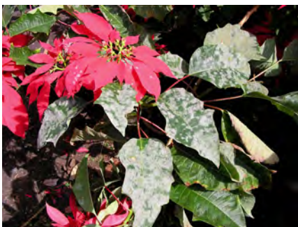
Powdery mildew of poinsettia foliage.