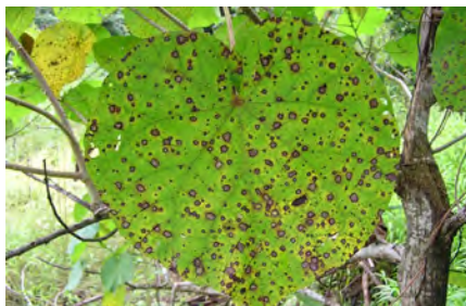
A fungal leaf spot disease of hibiscus.