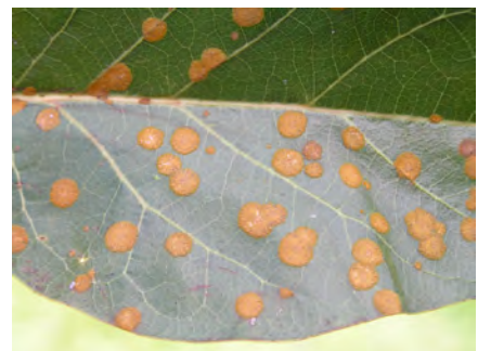
Algal leaf spot of avocado.