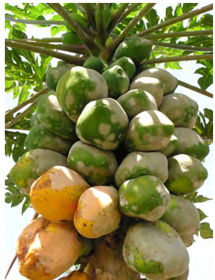
Powdery mildew can affect common landscape fruits such as papaya and mango.