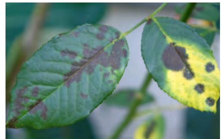
Spots may coalesce to form blighted areas. Leaves may turn yellow.