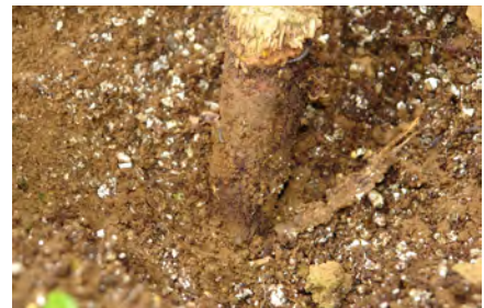
The bark of stems may girdle when planted too deeply and over-irrigated.