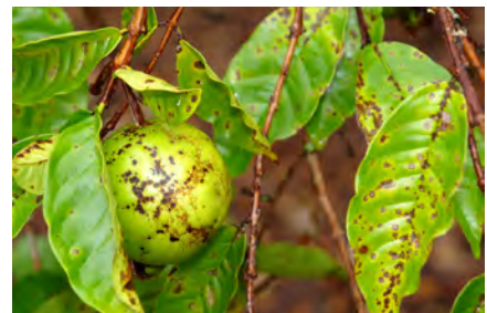
Algal fruit and leaf spot of guava.