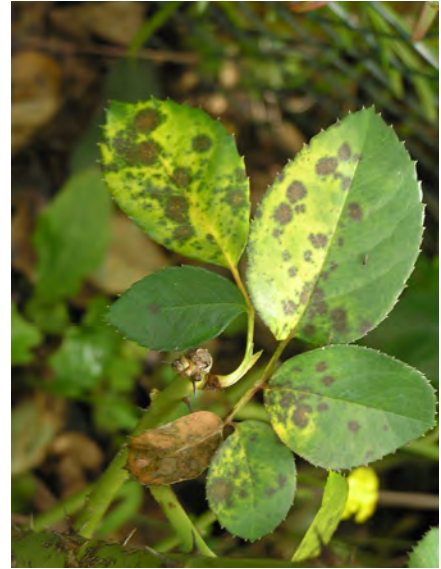
Black spot appears as black spots or patches with feathery margins on the upper surface of leaves and stems.