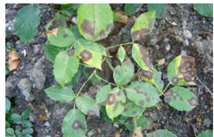
Severe spotting may cause leaf death and premature defoliation.