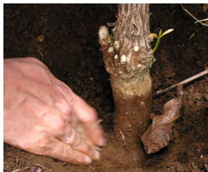
The 1st lateral root should be at ground level, not 2" or more beneath the soil surface.