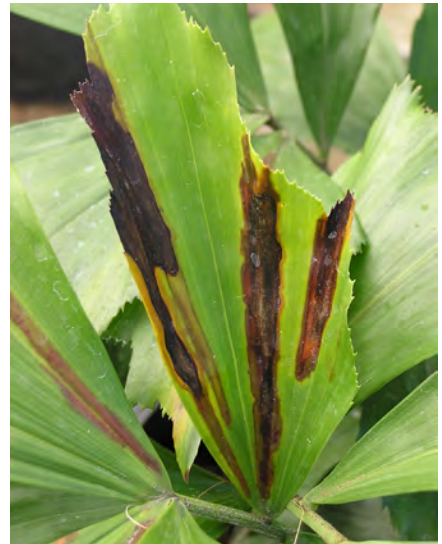
Bacterial leaf blight of fishtail palm.

Below: Bacterial leaf blight of aglaonema; far left, bacterial leaf blight of panax; middle: bacterial leaf blight of syngonium.