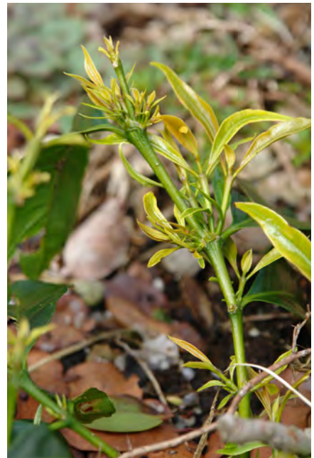
Glyphosate herbicide injury to a coffee seedling: foliar yellowing and witches' broom with narrow, strappy leaves.