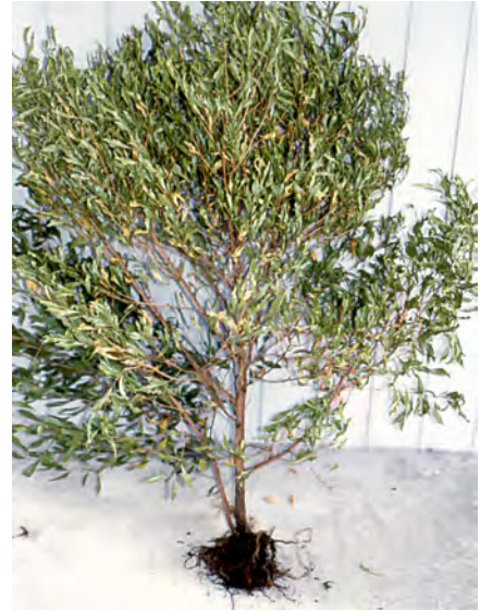
Dodonea viscosa ('a'ali'i) tree with Phytophthora root rot.