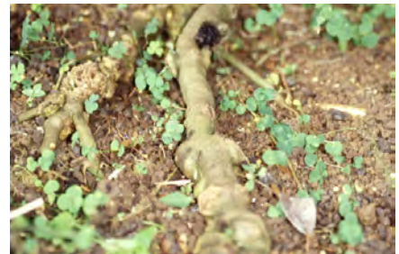
Knots and galls can appear on roots at the soil surface.