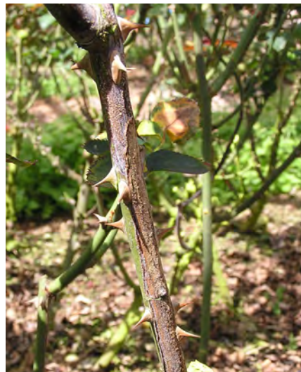
Stem canker of rose.