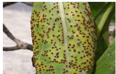
Rust of beach heliotrope