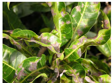
Powdery mildew of mango.