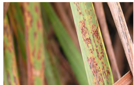
Rust of lemongrass