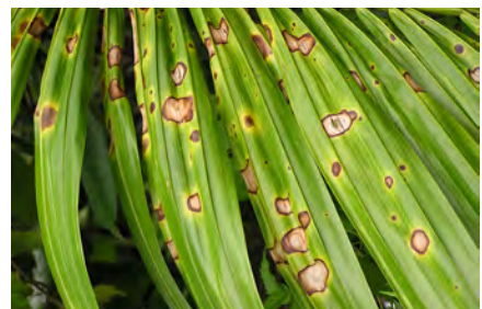
Palms suffer from a variety of different fungal leaf spot diseases.