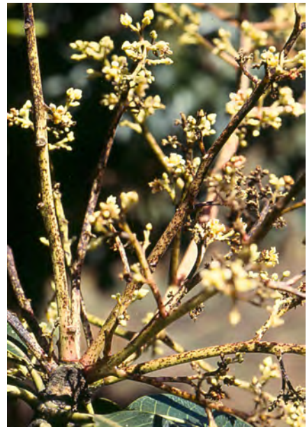
Mango anthracnose (inflorescence).