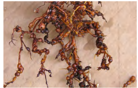
Root knot, caused by Meloidogyne sp.