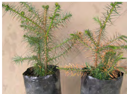
Foliage of Chinese pine seedlings with Rhizoctonia root rot is brown.