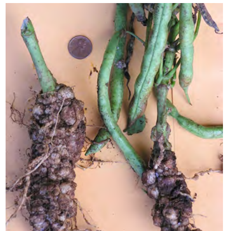
Severe galling can develop on susceptible plants.