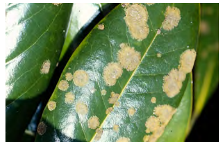
Algal leaf spot of magnolia.