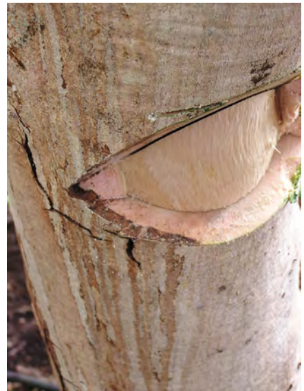
Stem bleeding of a shower tree canker caused by Phomopsis sp. and internal stem necrosis.