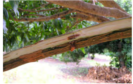
Branch canker on mango showing internal branch necrosis and gummosis.