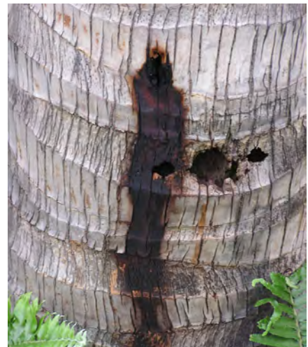
Stem bleeding of coconut palm.