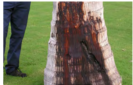
Stem bleeding of coconut palm.