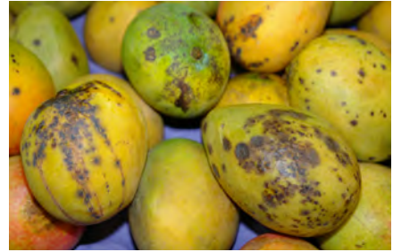
Mango anthracnose (fruit).