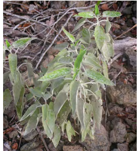
Powdery mildew of Haplostachys haplostachya leaves.