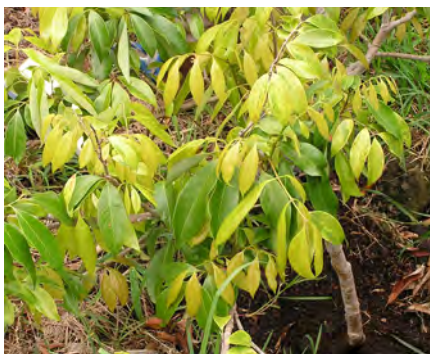
Longan, lychee, and some other landscape fruit trees may exhibit chlorotic, unthrifty foliage.