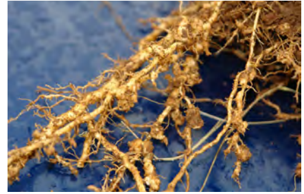
Root knots and galls on a root system, the diagnostic symptoms.