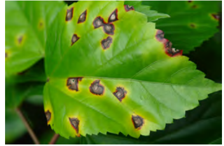
Bacterial leaf spot of hibiscus.