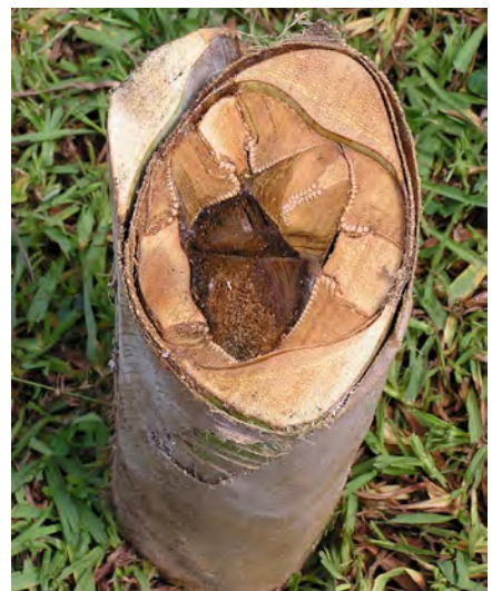
Internal stem necrosis at the base of a coconut tree with heart rot.