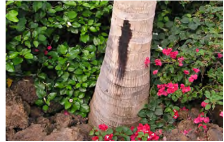
Stem bleeding of coconut palm.