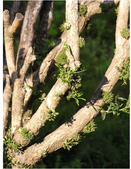
Glyphosate herbicide injury to a pruned shrub: witches' broom.