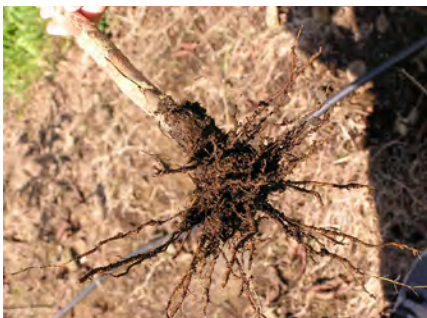
Roots of severely affected trees are black, and stems may rot.