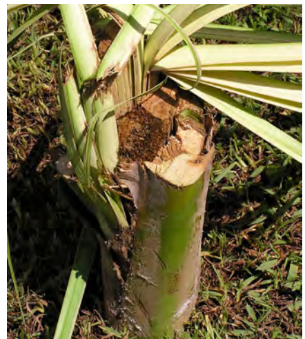
Internal stem necrosis at the crown of a diseased coconut.