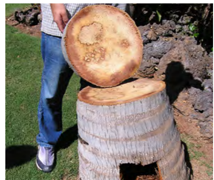
Stem bleeding of coconut palm: interior decay of stem.