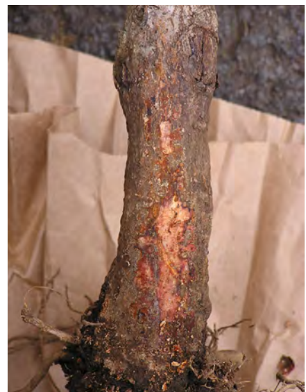
Internal stem necrosis of a fruit tree planted too deeply.