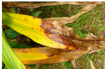
Leaf spots of spider lily, although small, may coalesce to form blight and cause defoliation.