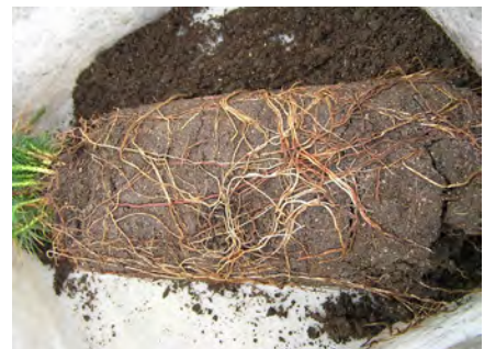
Brown roots of Chinese pine seedlings with Rhizoctonia root rot.