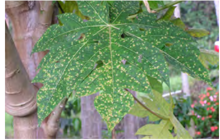
Leaf spot of papaya caused by Asperisporium caricae is a common landscape pest that can also attack papaya fruits.