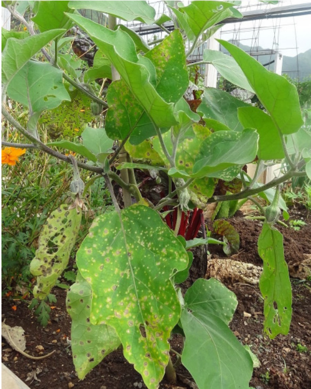
Lesions tend to appear first on older leaves.