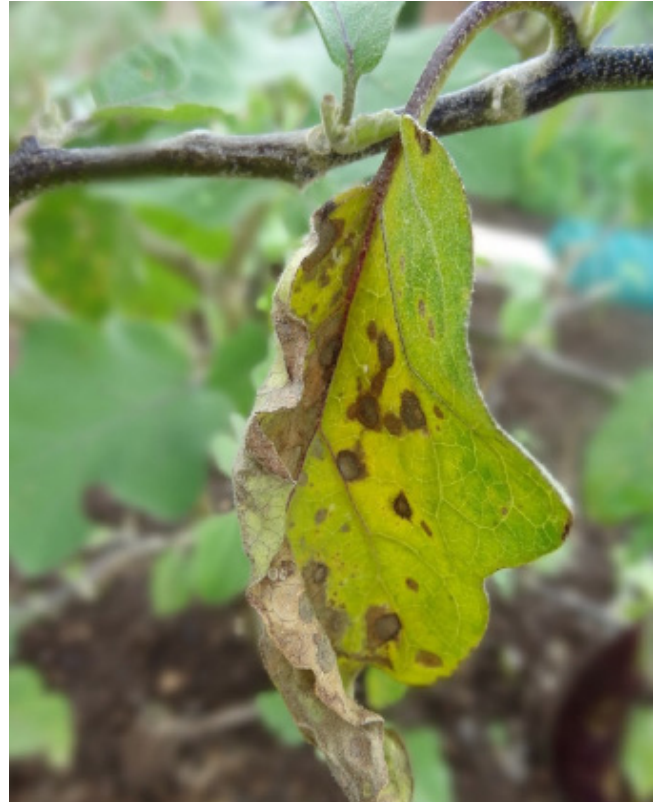
Infected leaves eventually turn yellow, curl up, and fall from the plant prematurely.

lower surface. They are brown to steel-gray on the upper surface and light brown on the lower surface (Anonymous 2011). Conidiophores (fungal structures that bear the spores/conidia) appear in fascicles (clusters) of 3 to 12. They are pale to medium brown, paler towards the apex, occasionally septate, and unbranched, and they bear hyaline, mildly curved conidia (Mycobank Database 2012). During the later stages of disease, lesions become grayish brown, with excessive sporulation at their centers. Concentric rings of diseased tissue may appear as the lesions gradually expand in size. As a lesion dries, the tissue in the center may crack and drop out.