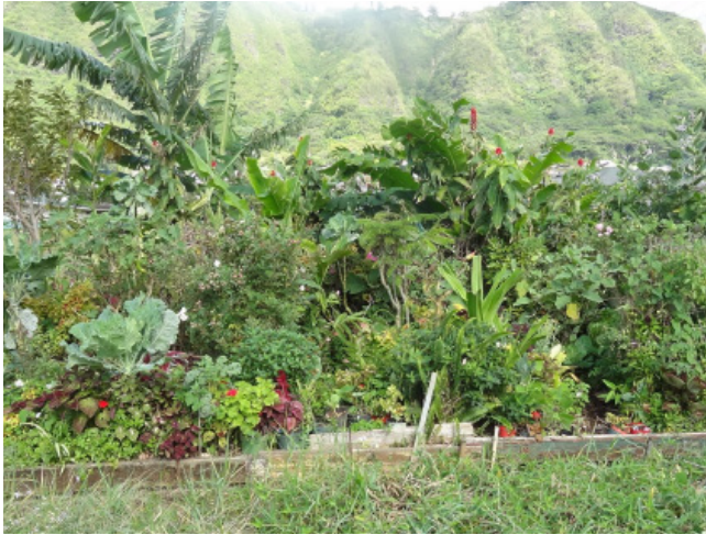
In a typical garden plot in Hawai'i, eggplant is one of many different plants. It is often grown in congested conditions within a confined space. This creates the high relative humidity that favors infection of eggplant leaves by Cercospora melongenae .