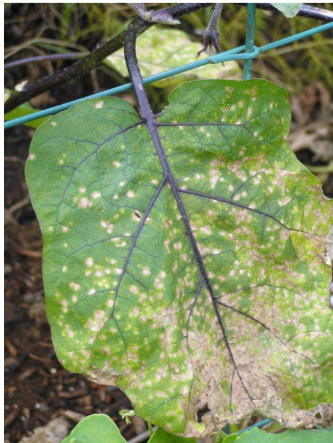
Cercospora leaf spot on eggplant growing in Mānoa Valley, O'ahu, Hawai'i

Eggplant has many properties that make it an integral part of a healthy diet. It is a rich source of dietary fiber, vitamins, potassium, and calcium; it also has low fat, zero cholesterol, and a very low calorie content. Therefore, eggplant is a preferred food among weight-conscious consumers. It can be boiled, stir-fried, deep-fried, steamed, roasted, or baked. Eggplant is a vital element in