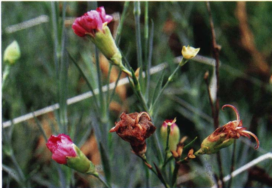
Figure 4. Blossom blight caused by the fungus Botrytis cinerea .