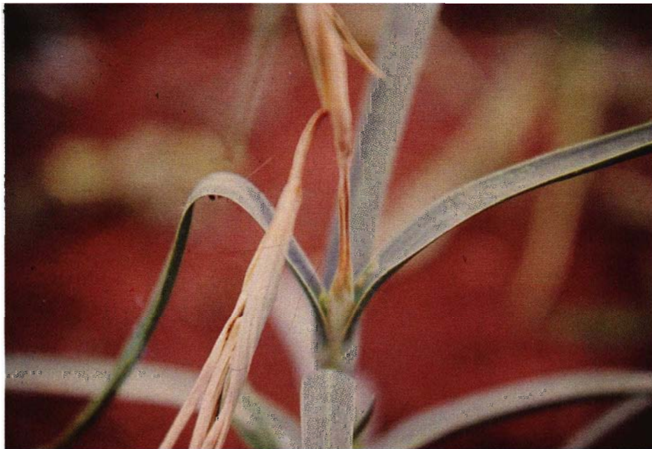
Figure 6. Phytophthora blight caused by the fungus Phytophthora parasitica .