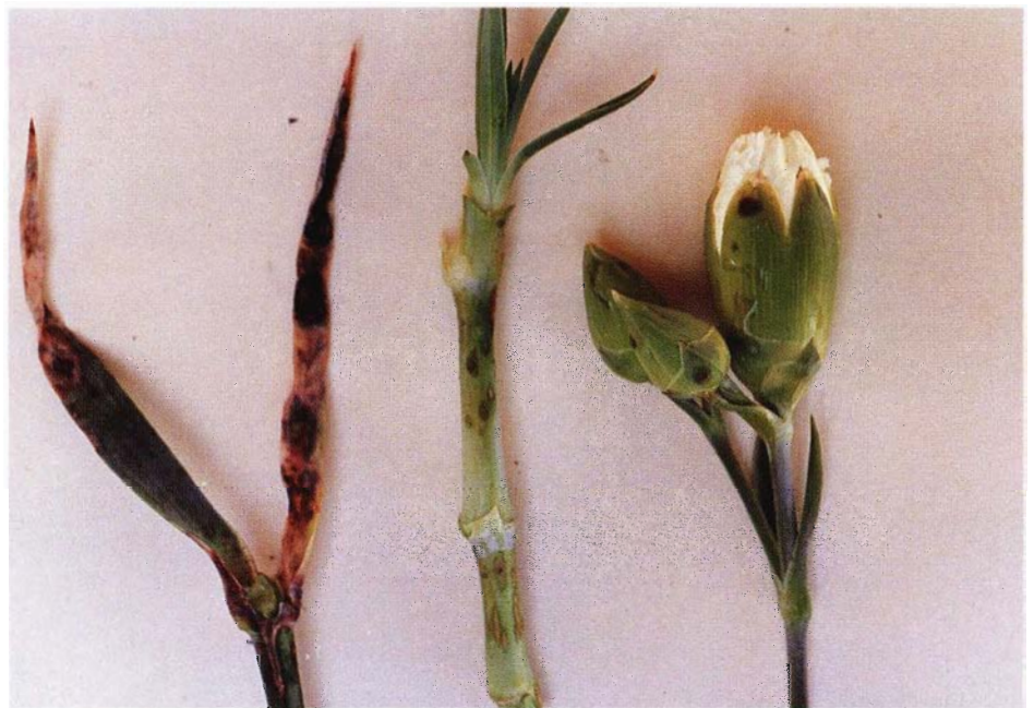
Figure 2. Blossom blight caused by the fungus Alternaria dianthi .