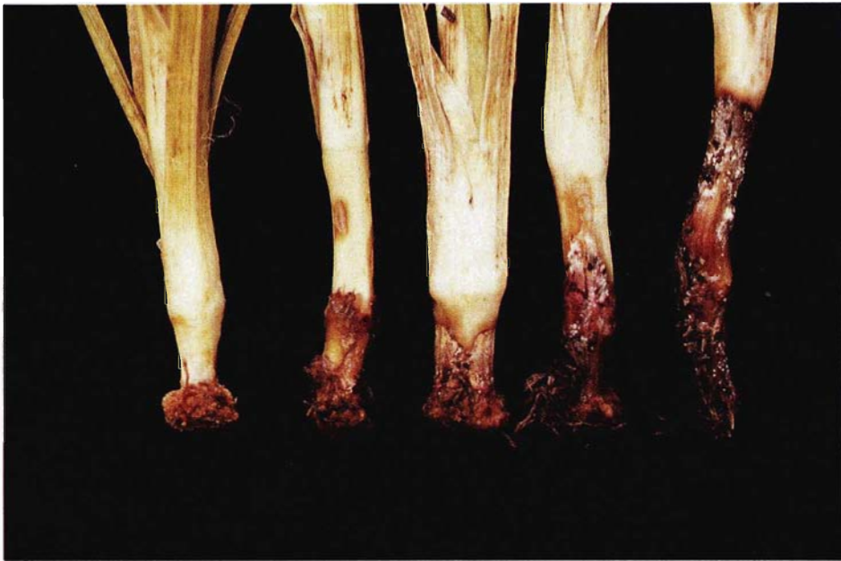
Figure 7. Diseased cuttings received in a December 1988 shipment of rooted cuttings from California. Fewer than 1 percent of the cuttings had various degrees of Fusarium roseum f. sp. graminearum crown rot.