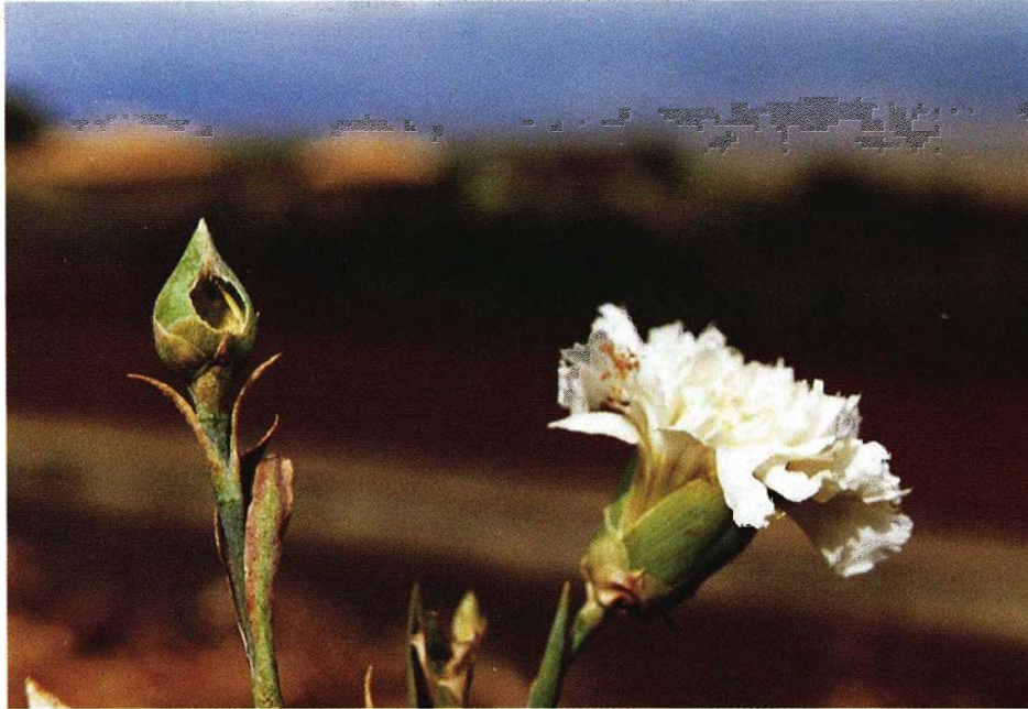
Figure 15. Damage to flower buds caused by cutworm larvae of the moth Peridroma saucia .

from the mainland have not always been disease free. On many occasions we have isolated R. solani AG2-2 and F. roseum f. sp. graminearum on diseased carnation cuttings originating from California and Florida. These pathogens, when reintroduced into Vapam-fumigated soil, aggressively recontaminate the beds, and the fumigation effect is lost in a short time. Carnation growers must inspect the base of the cuttings carefully before planting. Cuttings with disease symptoms (Fig. 7) must be culled. Cuttings may be dipped in a solution of benomyl (Benlate) at 1 oz/5 gal water before planting, to control Fusarium . Rhizoctonia stem rot can be controlled with soil drenches of PCNB (Terraclor) at 2.5 lb/300 gal/1000 sq ft of planting area, two to three weeks after planting (12). Other soil-borne diseases such as Pythium sp. root rot can be controlled with drenches of metalaxyl (Subdue 2E) at 1/2 to 2 fl oz/100 gal water/800 sq ft. Applications should be repeated at one- to two-month intervals.