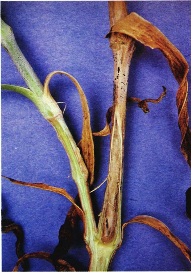
Figure 9. Stem dieback caused by the fungus Fusarium roseum f. sp. graminearum . Notice black specks at top of branch; these are sexual fructifications of the pathogen, which produce ascospores when they are moistened by rain or dew.