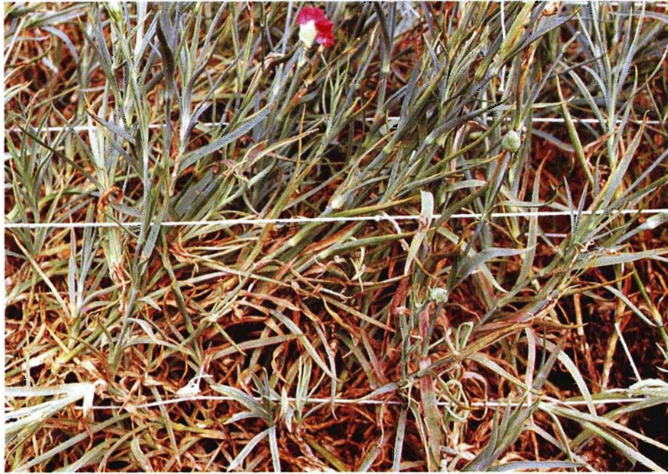
Figure 13. Purpling and drying of foliage caused by feeding damage of the two-spotted spider mite, Tetranychus spp.