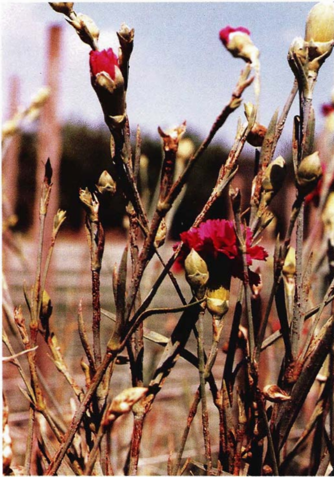
Figure 1. Carnation var. Peterson Red Sim showing orange rust pustules caused by the fungus Uromyces caryophyllinus .