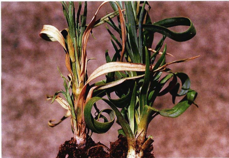
Figure 5. Stem rot of cuttings caused by the fungus Rhizoctonia solani AG2-2.