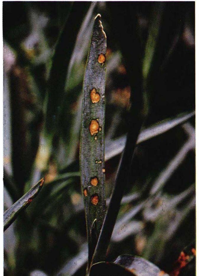
Figure 10. Plant showing symptoms of bacterial blight caused by the bacterium Pseudomonas syringae pv. woodsii .