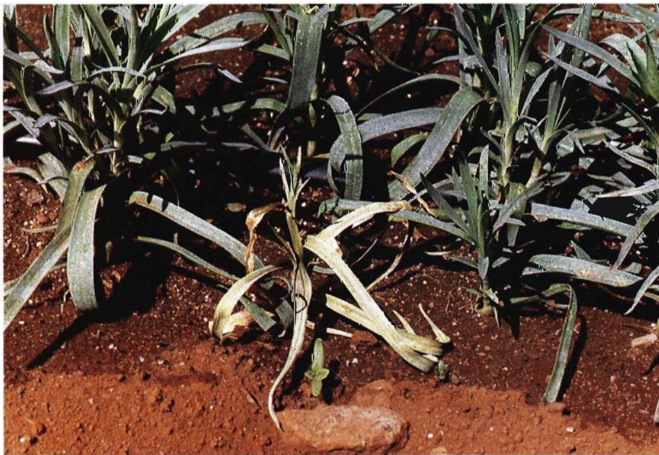
Figure 8. Wilted, yellowing plant in center of photograph has fusarium stem rot caused by the fungus Fusarium roseum f. sp. graminearum .