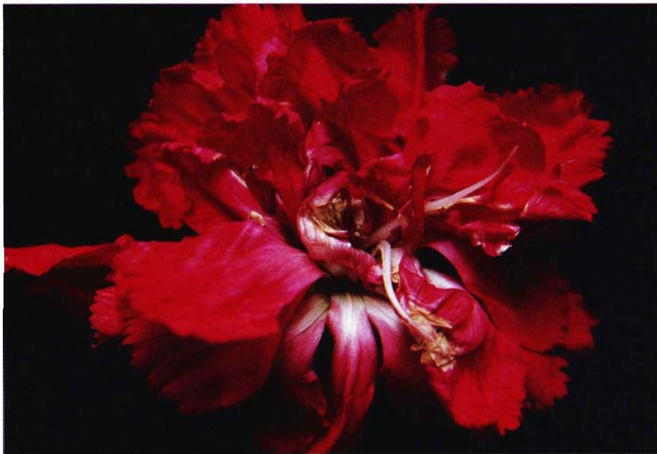
Figure 12. Damage to blossom caused by saprophytic fungi and bacteria carried by the blossom-feeding mite Pediculopsis graminum .