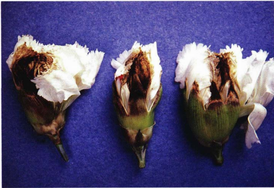
Figure 3. Flower blight caused by the fungus Alternaria dianthicola .