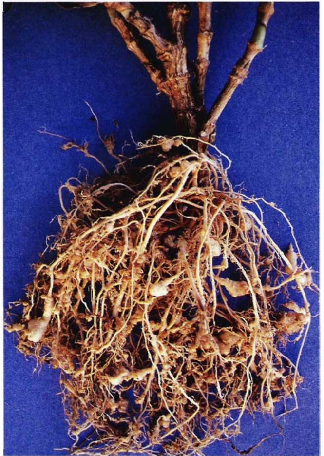
Figure 11. Root system heavily affected by root-knot nematodes, Meloidogyne spp.