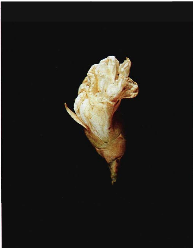
Figure 14. Damage to blossom caused by thrips.