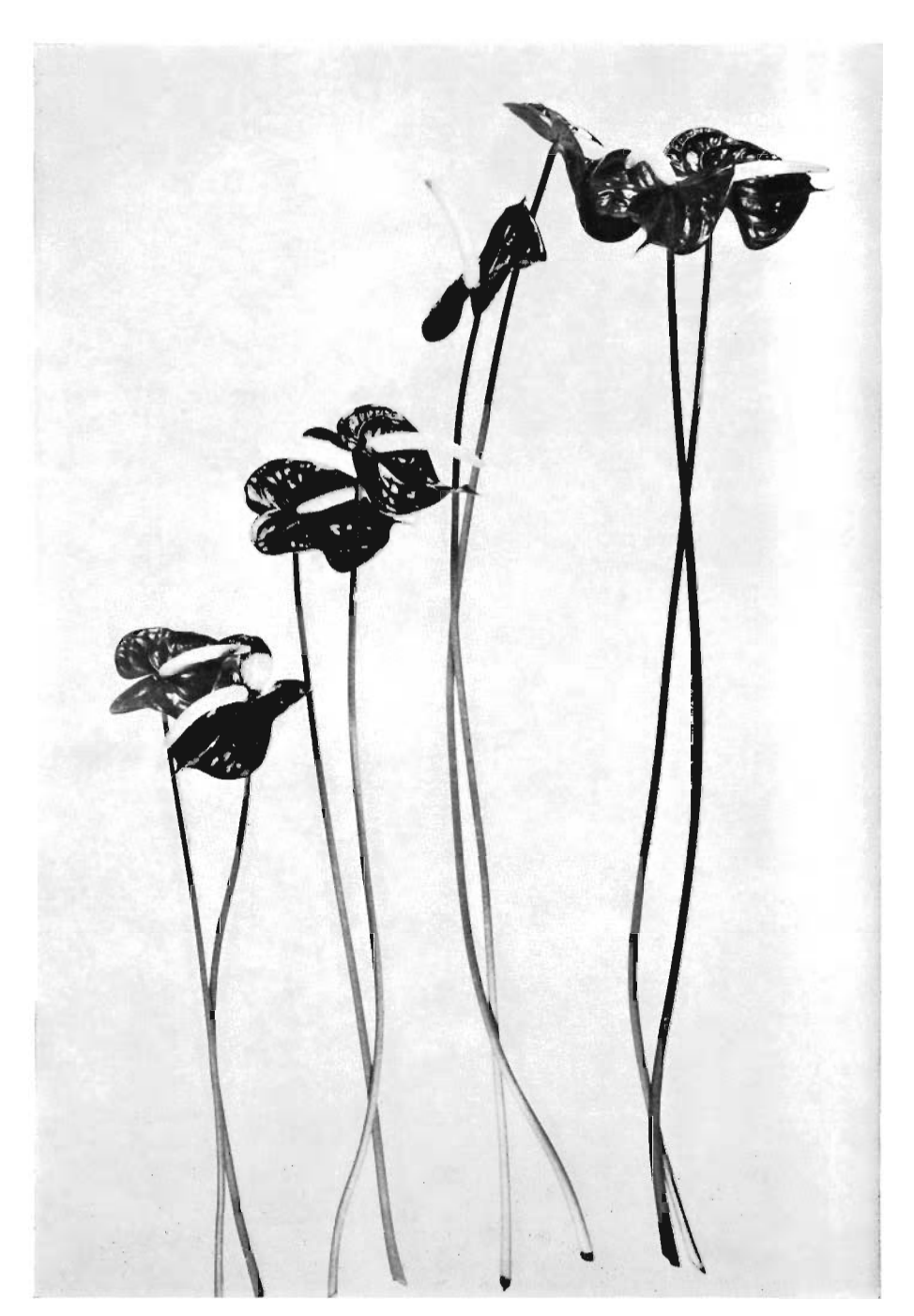
FIGURE 2. Differences in flower stem length induced by the four shade levels in the saran clothhouse. Left to right: 30, 47, 63, and 75 percent shade, respectively.