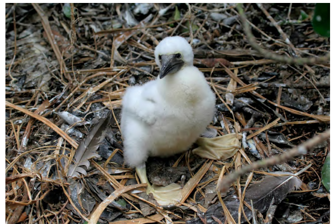
FIGURE 5: Young Brown Booby, Sula leucogaster .