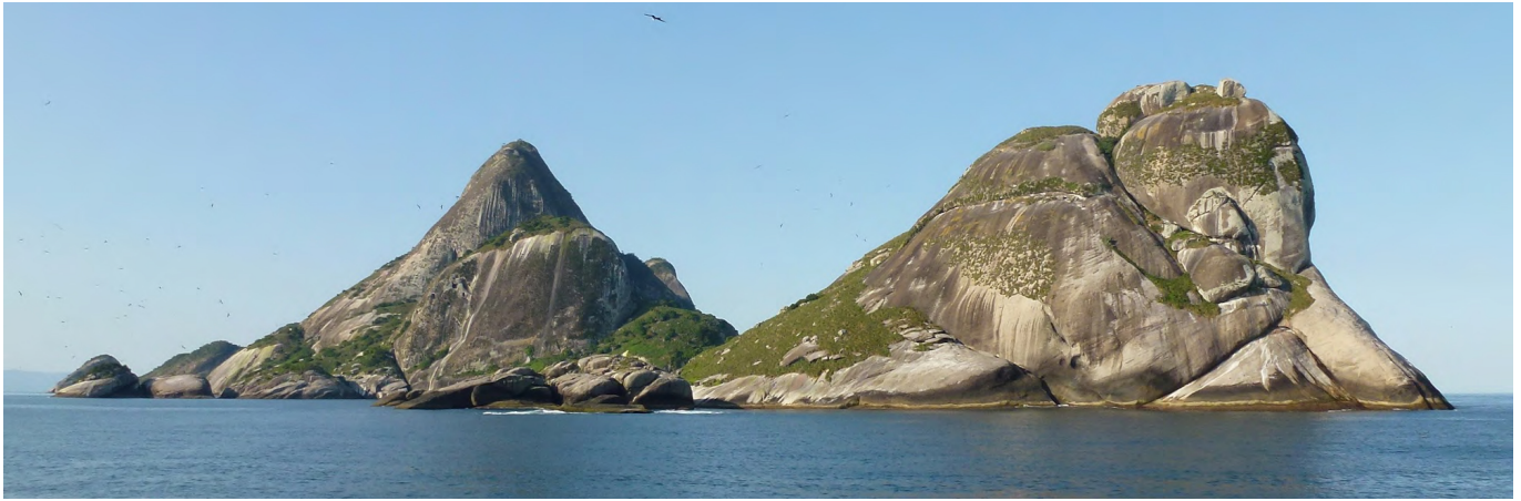
FIGURE 2. View of the main island of the archipelago.

there are four islets (Sapata, Paredão, Porto and Oratório or Sul) and five stacks. Two shoals (Parcel de Nordeste and Parcel de Sudeste), with their tops only a few meters deep but plunging to ca. 40 m, complete the archipelago (Ângelo 1989). Part of these islets and the shoals are protected by the Tupinambás Ecological Station. Depths around the Alcatrazes archipelago range between the 20–40 m isobaths.