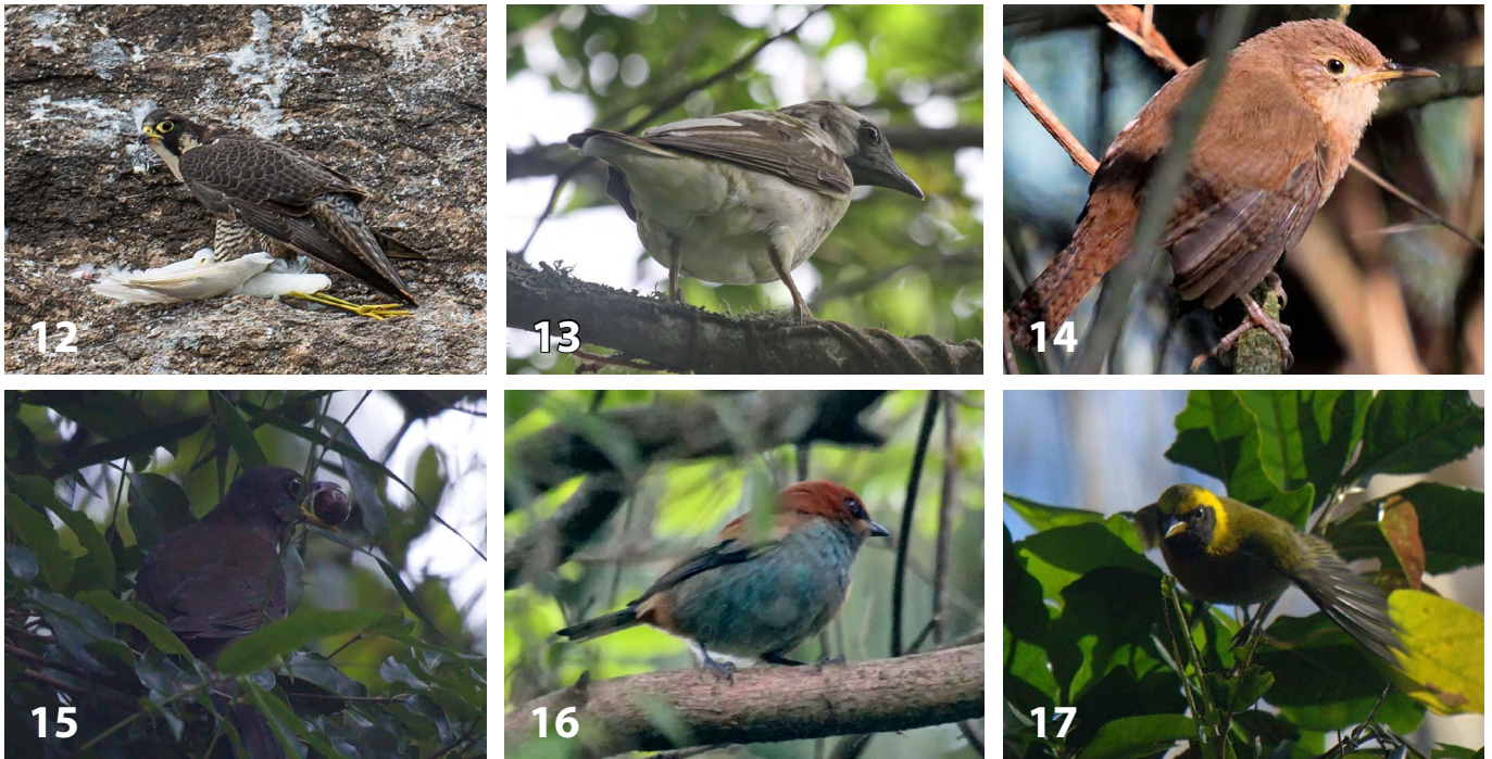
FIGURES 12–17. 12, female Peregrine Falcon, Falco peregrinus , with a recently killed Snowy Egret, Egretta thula , on Alcatrazes Island. Photo: Leandro Saadi. 13, immature male Bare-throated Bellbird, Procnias nudicollis . Photo: Edélcio Muscat. 14, Southern House Wren, Troglodytes musculus , a common land bird in Alcatrazes. Photo: Edélcio Muscat. 15, White-necked Thrush, Turdus albicollis , feeding on Alibertia fruit. Photo: Fabio Olmos. 16, Male Chestnut-backed Tanager, Tangara preciosa , an unexpected presence in Alcatrazes. Photo: Edélcio Muscat. 17, Guira Tanager, Hemithraupis guira . Photo: Fabio Olmos.

(Olmos and Bugoni 2006), where wrecks involving both this species and Calonectris borealis are known to occur (Olmos et al. 1995).