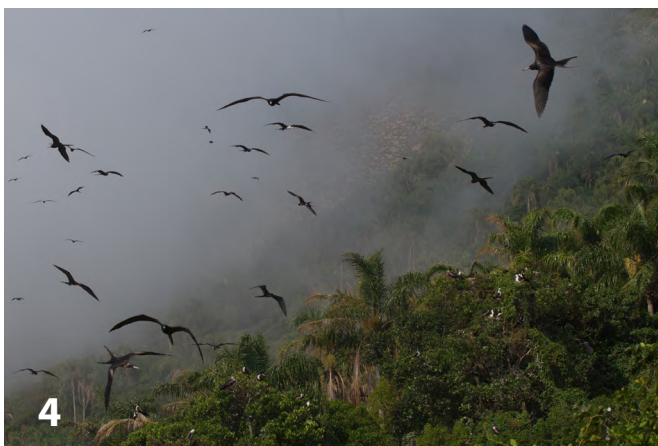
FIGURES 3–4: Magnificent Frigatebird, Fregata magnificens . 3, Magnificent Frigatebird, Fregata magnificens , with nestling. 4, Countless F. magnificens flying over the island on a foggy morning.