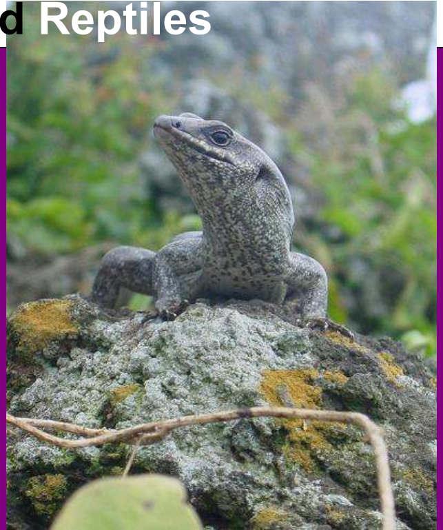
Telfair's skink (Leiolopisma telfairi)

The natural Mauritian ecosystem is unique & its stability was once underpinned by one of the richest diversities of reptiles in the world. However, since the sixteenth Century reptile populations have been severely depleted & fragmented, such that many important ecological links & food webs integral to native ecosystem stability have been lost. Remnants of these past reptile communities can still be found on a few offshore islands, most notably Round Island. Some 30 years ago it was recognised that there was a need to restore the offshore islands so that these rare reptile populations could be re-established back within their former range. Over the past three decades the Forestry Service, Durrell Wildlife Conservation Trust, Mauritian Wildlife Foundation and the National Parks Conservation Service have been the driving forces behind island surveys, reptile research and island restoration. Thanks to all of this hard work we are now ready to initiate the first reptile translocations.