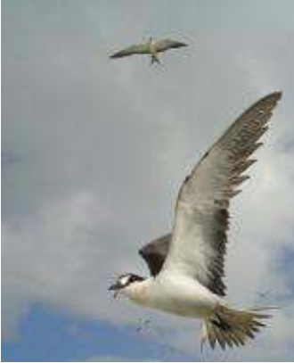
One of the many sea birds living on Ile Aux Cocos

The Mauritian Wildlife Foundation is specialised in the restoration of small islands. MWF became again involved, in July 2006, with the conservation of Ile aux Cocos (15ha) and Ile aux Sables (8ha), two important island nature reserves in the lagoon of Rodrigues. The island's vegetation communities have been damaged by invasive exotic plants & coastal erosion. The breeding seabirds are often disturbed by inadequately controlled tourist activity. The implementation of the conservation management plans involve inter alia study of the sea-birds & the setting up of a nursery for growing of plants to restore the vegetation. Plants will also be provided by the local community nurseries. Workshops have started with stakeholders in order to establish strategies for eco-tourism & education. The project is funded by the UNDP-GEF/SGP.