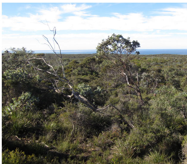
Kwongkan shrublands near Hopetoun

Human settlements and infrastructures where an ecological community formerly occurred do not form part of the natural environment and are therefore not part of the ecological community. This also applies to sites that have been replaced by crops and exotic pastures, or where the ecological community exists in a highly-degraded or unnatural state.