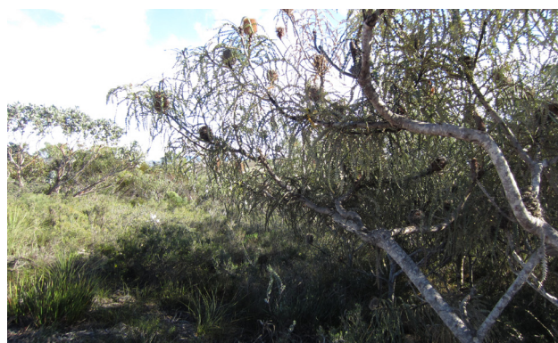
Banksia speciosa (showy banksia), a key species in some parts of the ecological community (Department of the Environment)