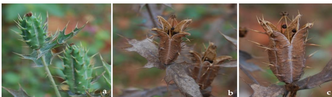
Figure 2. Argemone mexicana : a. Maturing fruit, b. & c. Fruit dehiscence and seed dispersal.

Maheshwari and Kanta (1961) reported that in A. mexicana intra-ovarian pollination done manually resulted in high seed set rate with 140 seeds per fruit against natural seed set rate with 150-200 seeds per fruit. These authors put a slit in the ovary and injected pollen grains manually; then the pollen germinated and fertilized the ovules. If this is the case, then what is the role of stigma and style in enabling pollen to germinate, form tube and reach the ovary? What factors present in the ovary enabled the pollen to germinate and form tube for fusion with the ovules? These questions require a thorough scientific study. In this context, it is appropriate to mention that certain enzymes and chemicals present in stigma and style trigger and enable the pollen to germinate and form tube to proceed further until it reaches the ovary to fertilize the ovules.