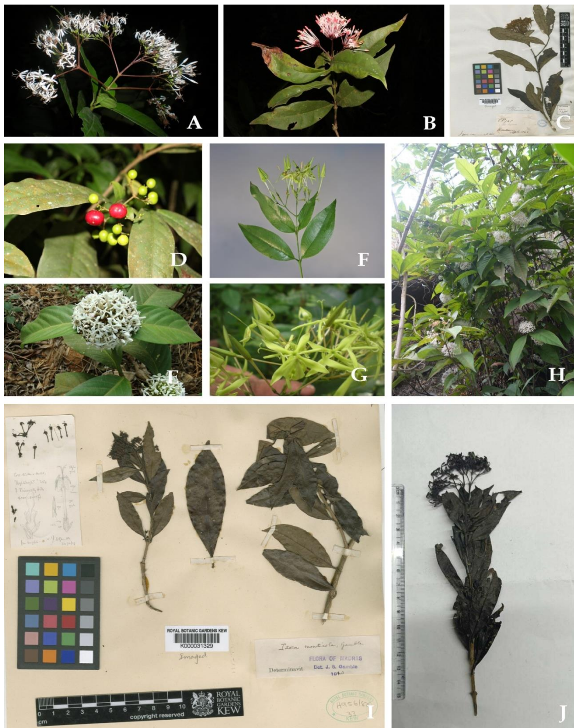
Figure 3 Diversity of indigenous Ixora species of Kerala; A. I. nigricans ; B. I. lawsonii ; C. I. thwaitesii ; D. I. lanceolaria ; E. I. polyantha ; F– G. I. malabarica ; G. I. undulata ; H. I. ravikumarii ; I. I. lavanya

Shrub, 1–1.5 m tall, profusely branched, glabrous; young internodes purple, older internodes grayish to brown. Stipule sheath subtruncate, 9 mm long, awn 5–6 mm long. Leaves opposite with petioles 0.5–1 mm long, leaves lanceolate, 4–6 × 1.5–2.3 cm, coriaceous, glabrous in both sides, apical portions with red colour margins in young leaves, apex narrowly acute to acuminate; base acute; secondary veins 6–7 pairs on each side. Inflorescence terminal, peduncle 2–2.5 cm long, glabrous. Flowers pink, 4-merous; flower buds ellipsoid, pedicel bracteoles 3–3.5 mm long, lanceolate, acute, glabrous; calyx lobes glabrous, linear lanceolate, lobes 2.5–3 mm long; corolla tube 11–13.5 mm long, lobes oblanceolate, glabra scent, acute; Stamens inserted at corolla mouth, filaments 0.5–1 mm long, glabrous; anthers beaked, style 13–13.5 mm long, glabrous; stigmatic lobes 1–1.5 mm long. Fruits unknown.