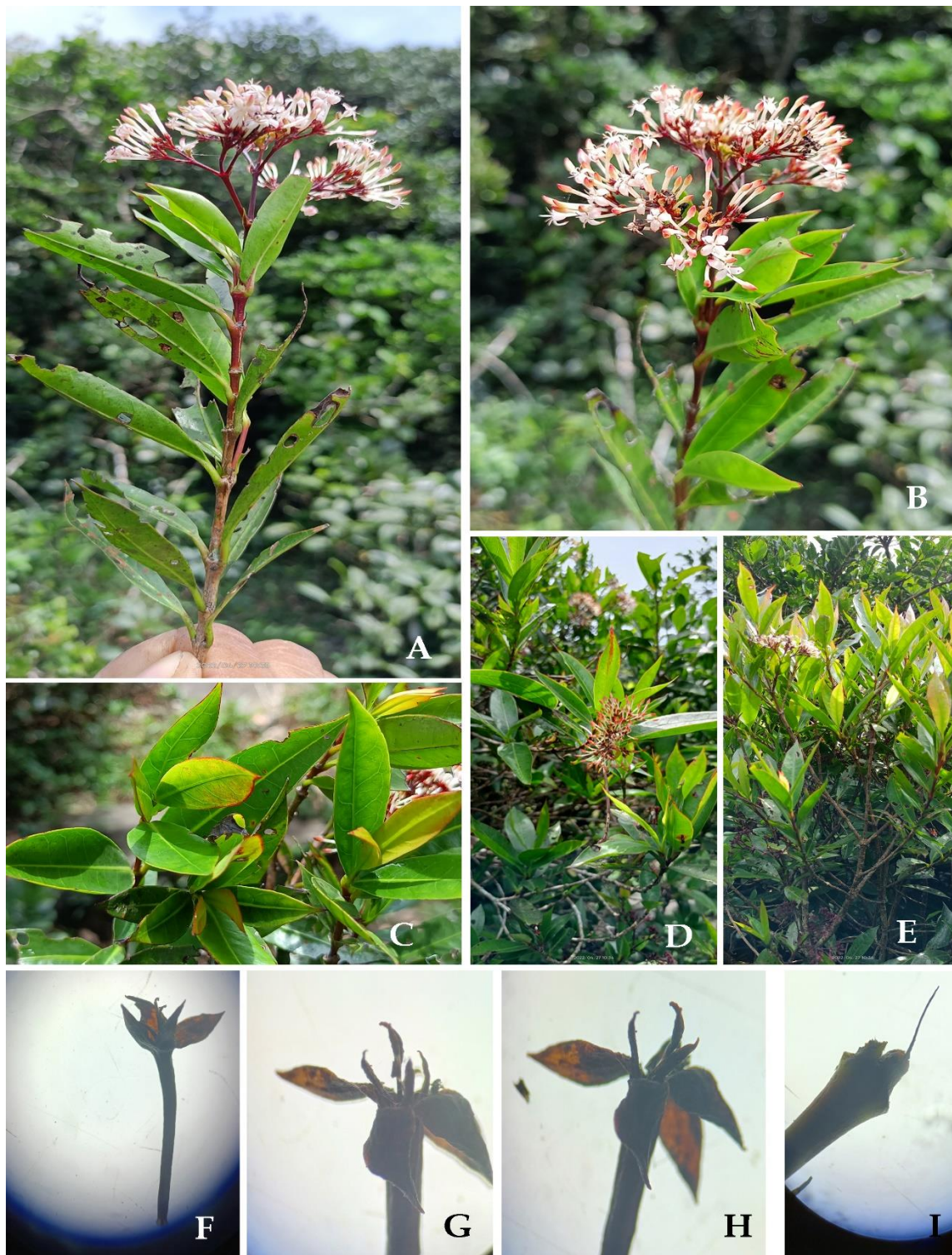
Figure 1 Ixora lavanya J.Mathew & P.M.Salim; A-E. Flowering twigs from type locality; F. Corolla; G-H. Close-up images of stamen and stigma; I. Stipule