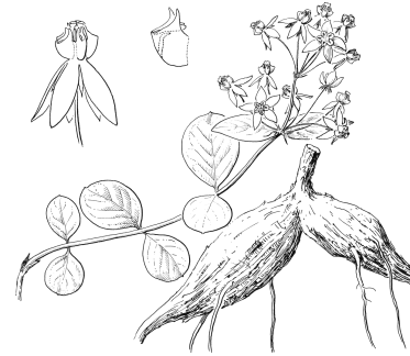
Illustration by Jeanne R. Janish, ©1959 University of Washington Press

Floral Characteristics: Inflorescence umbellate, usually terminal, the central one with 5-10 flowers; peduncle 2-4 cm, pedicels about equaling the peduncle. Lateral terminal umbels sessile and fewer-flowered. Sepals linear to lanceolate, 5-9 mm long, green to reddish, bearing dense hairs in patches. Corolla tubular, pale greenish yellow, lobes lanceolate, reflexed, 8-12 mm long, often tinged with red on back. Hoods pinkish, 5-6 mm long, sac-shaped and bilobed above, the lobes projecting into short, erect to slightly recurved teeth that slightly exceed the anthers and completely enclose the short horn. Flowers April to June.