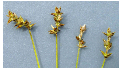
© Bruce Newhouse, Field Guide to the Sedges of the Pacific Northwest (Oregon State University Press, 2000)