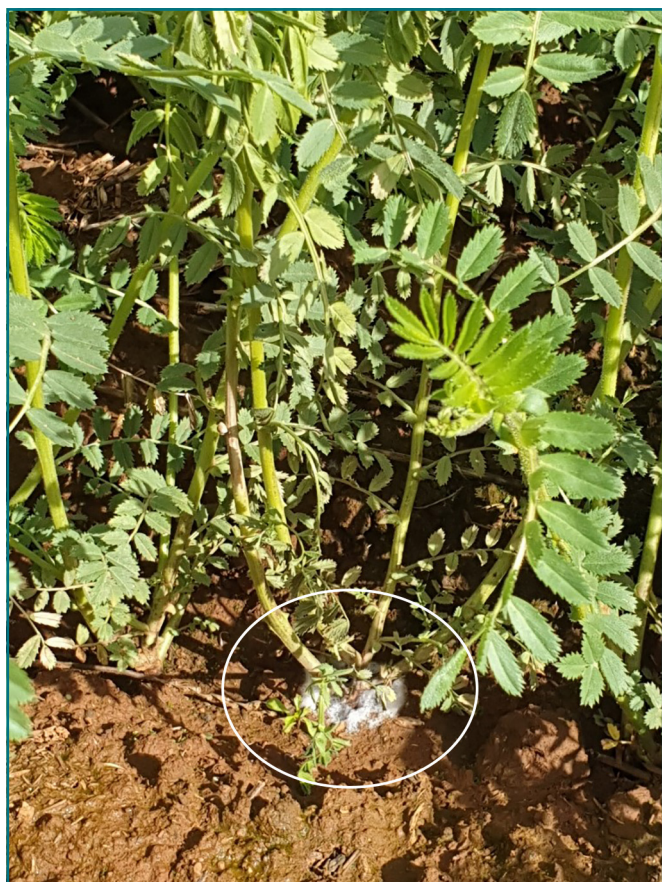
Sclerotinia: basal infection (circled).

Symptoms of stem rot appear in crops from mid-vegetation onwards. At first, water-soaked lesions appear on the stems and leaves. Later affected areas develop a soft, slimy rot which exudes droplets of brown liquid. The infected tissue dries out and becomes covered with fine, white fungal growth. Small black, irregular spots may sometimes be seen just below the surface. These stem lesions turn grey and the branch above the lesion dies. Affected plants wilt and die rapidly, without losing their leaves. Late infection can affect the pod and seeds. Infected seeds are smaller than normal and discoloured.