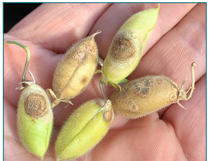
Ascochyta blight: pod lesions can cause seed abortion, infection and defects, resulting in germination and grain quality issues.