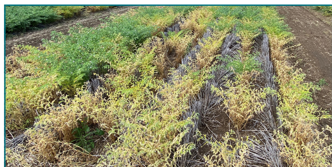
Phytophthora root rot: causing death of chickpea plants.

The pathogen is spread by movement of infected soil and water. The disease survives as oospores. When the soil is saturated the oospores germinate to produce mycelia and zoospores which can swim to hosts. This results in multiple infection points causing severe disease. The disease can survive in the soil for up to 10 years.