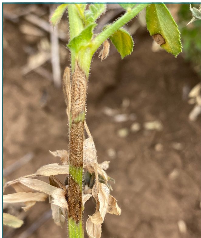
Ascochyta : stem lesions.