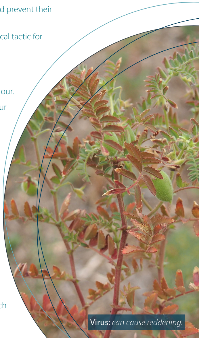
Virus: can cause reddening.