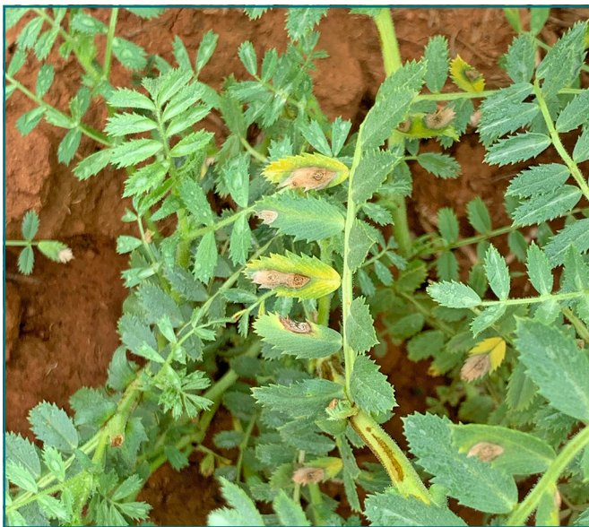
Ascochyta blight: early infection on leaves.

Early seedling AB infection has the greatest impact on disease severity.