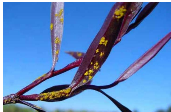
Figure 9 Myrtle rust pustules on leaves of willow myrtle 'Afterdark' ( Agonis flexuosa cv 'Afterdark')