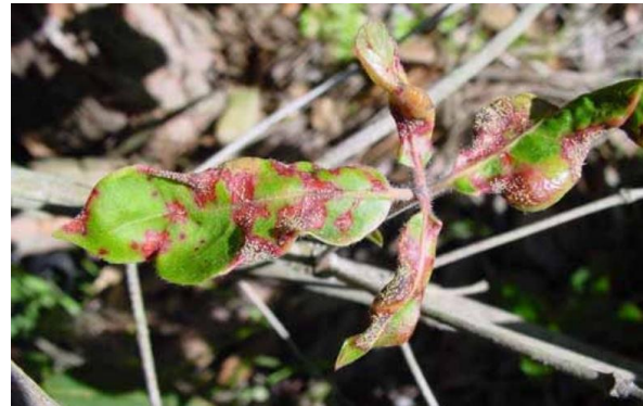
Figure 8 Older lesions of myrtle rust on turpentine ( Syncarpia glomulifera ) leaves

Myrtle rust is widespread along the east coast of Australia from southern New South Wales to far north Queensland. In Victoria myrtle rust is found mainly in production nurseries around Melbourne.