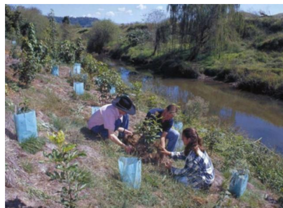
Figure 12 Be mindful of spreading myrtle rust when carrying out activities in high risk areas