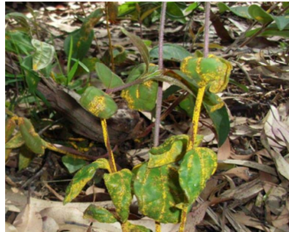
Figure 11 Scrub turpentine ( Rhodamnia rubescens ) infected with myrtle rust

Highly susceptible host plants are likely to become reinfected unless regularly treated. Rotation of fungicides containing different active ingredients is recommended to ensure fungicide applications remain effective.