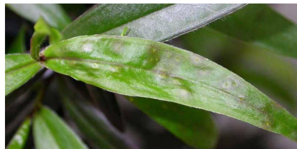
Figure 5 Early stages of myrtle rust on willow myrtle 'Afterdark' ( Agonis flexuosa cv 'Afterdark')