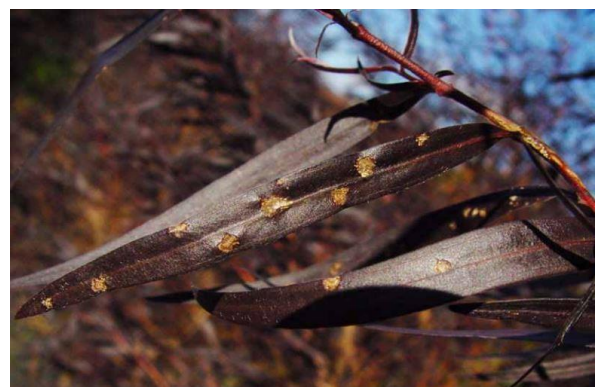
Figure 7 Older lesions of Myrtle rust on willow myrtle 'Afterdark' ( Agonis flexuosa cv 'Afterdark')