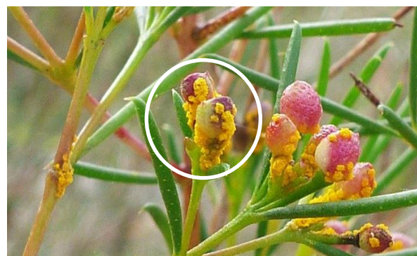
Figure 3 Myrtle rust infecting flowers and stems of Geraldton wax ( Chamelaucium uncinatum )