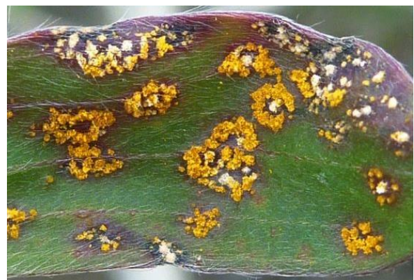
Figure 6 Myrtle rust pustules on broad-leaved paperbark ( Melaleuca quinquenervia )