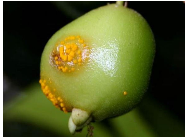
Figure 4 Myrtle rust infecting fruit of cedar bay cherry ( Eugenia reinwardtiana )

Myrtle rust spores can spread over long distances carried on infected plant material, contaminated equipment, vehicles and clothing (Figure 2).