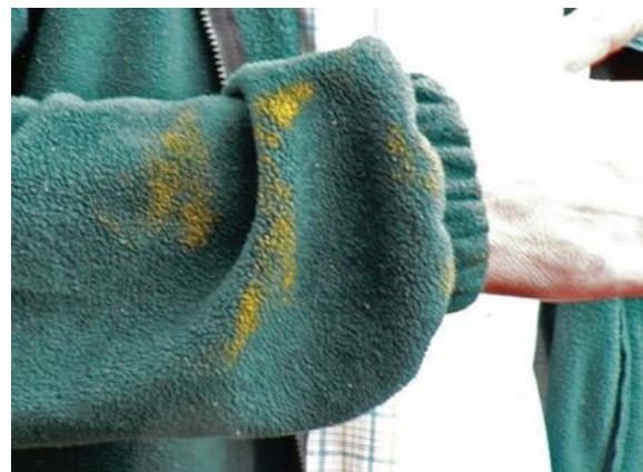
Figure 2 Myrtle rust spores on clothing