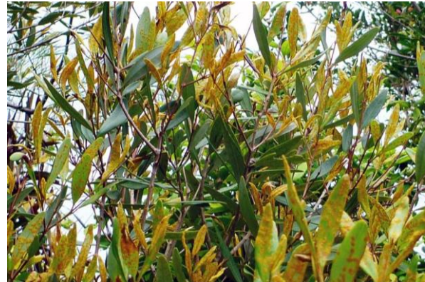
Figure 1 Severe myrtle rust infection on narrow-leaved malletwood ( Rhodamnia angustifolia )