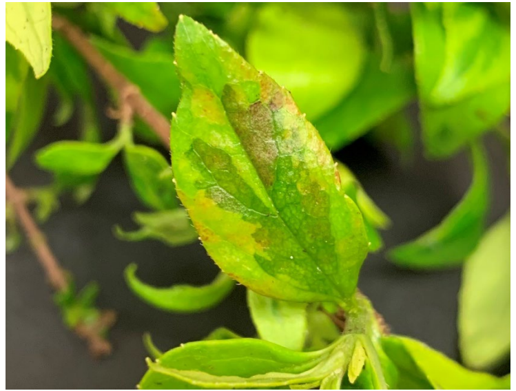
Figure 2: Light yellow to brown leaf spots that are somewhat vein-delimited on a variegated Abelia cultivar. Leaf spots were not easily seen on the variegated cultivar. Affected leaves readily drop from the plant.

Foliar nematodes are microscopic roundworms in the genus, Aphelenchoides . The species most commonly found on ornamental plants in the southeastern USA is A. fragariae . Foliar nematodes have been an increasing problem in ornamental plant production in recent years. Leaf spot symptoms are often mistaken for other diseases. Because control measures for most other diseases are ineffective against foliar nematodes, misdiagnosis can lead to the development of heavy infestations. Vegetative propagation of woody and herbaceous plant species and cultivars can introduce the nematode into propagation and production houses. Foliar nematodes also have a very wide host range, which means that an infestation can spread through a greenhouse, nursery, or landscape, even across a diverse array of unrelated plants. Foliar nematodes have been found in over 700 different plant species from at least 85 plant families. In ornamental production, they mostly affect herbaceous plants such as anemone, begonia, carnation, chrysanthemum, dahlia, fern, gloxinia, helleborus, hosta, impatiens, lamium, lantana, ligularia, peony, phlox, salvia, and verbena, as well as woody plants such as abelia and Buddleja.