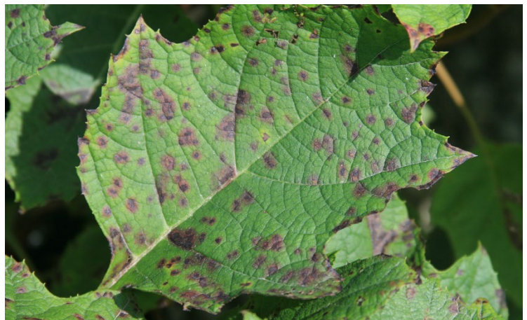
Figure 8: Bacterial leaf spot on oakleaf hydrangea has purplish-red leaf spots that are oily-looking, may have a reddish or yellow halo, and are all the same color intensity. No sporulation would be seen within the center of the leaf spots.