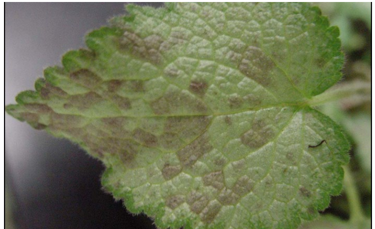
Figure 6: Downy mildew on Lamium has purplish, angular, vein-delimited leaf spots that are light colored and all about the same color. Downy mildew sporulation may also be seen on the underside of the leaf below the leaf spots.

Lan, Yu-Han, and Palmer, Cristi. 2017. IR-4 Ornamental Horticulture Program Nematode Efficacy: A Literature Review ( http://ir4.rutgers.edu/Ornamental/SummaryReports/NematodeEfficacySummary2017.pdf )