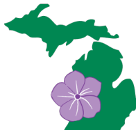
Michigan Floriculture Growers Council