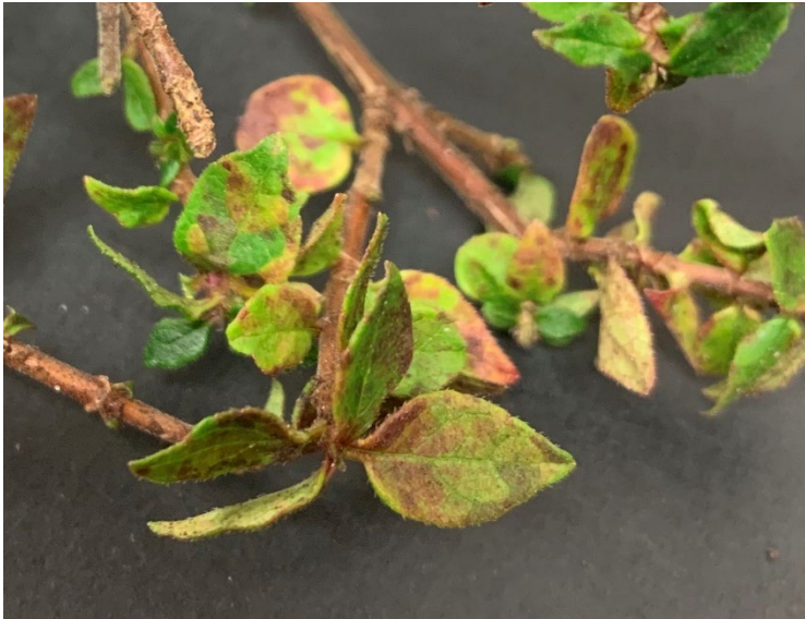
Figure 1: Reddish, angular leaf spots on an Abelia cultivar. Affected leaves readily drop from the plant leaving bare stems. Individual leaf spots range in color from yellow to darker purplish-red.