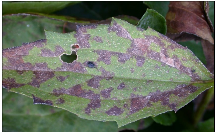
Figure 7: Septoria (fungal) leaf spot on Rudbeckia has purplish to brown, angular leaf spots that are all the same color and darkly colored, pimple-like fruiting bodies (pycnidia) can be seen embedded in the leaf epidermis.