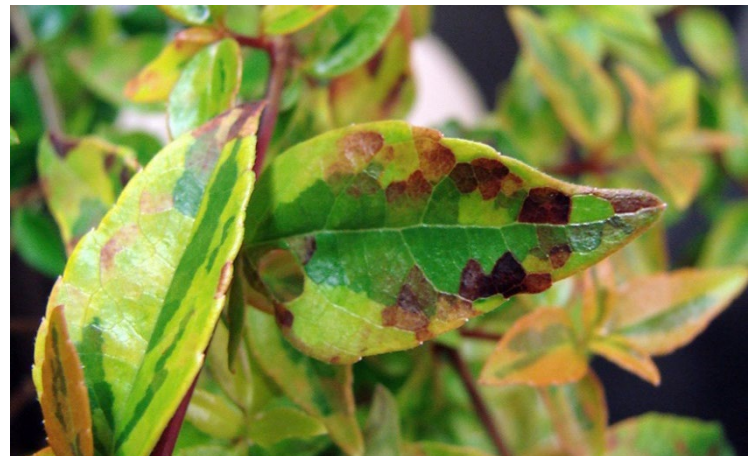
Figure 4: Foliar nematode-infested lesions will often range from light to dark in color. Darker areas are where the nematode has been the longest, and lighter areas are where the population is increasing and feeding damage is just beginning to be seen.