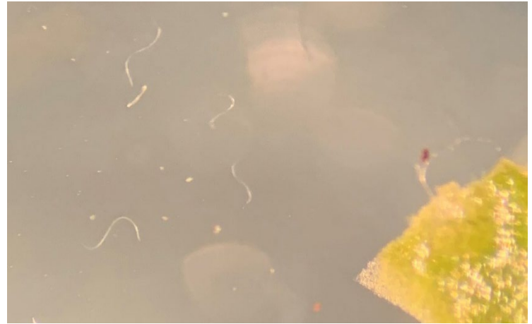
Figure 3: Foliar nematodes freely swim from a chopped piece of symptomatic Abelia leaves. Four microscopic, S-shaped nematodes can be seen to the left of the leaf piece.

Avoidance: The first line of defense is avoidance of infested plant materials. Do not propagate from infested plants. Inspect all incoming plants carefully.