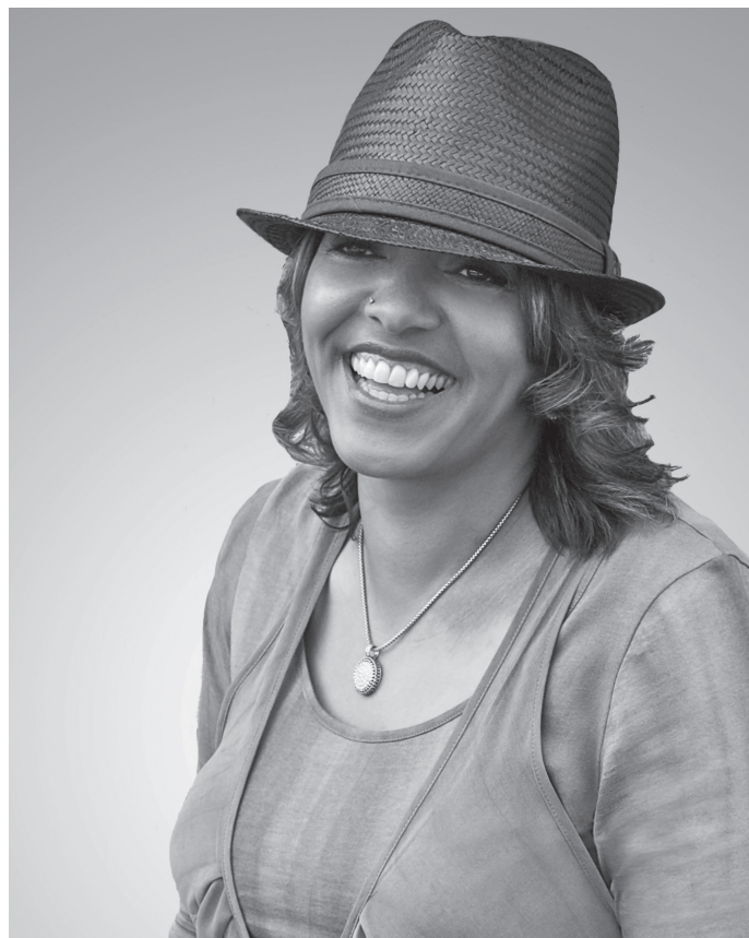
TERRI LYNE CARRINGTON

February 15-25 Various venues, Portland, OR