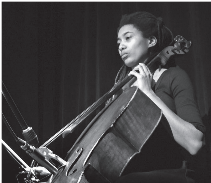
TOMEKA REID