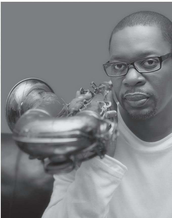
RAVI COLTRANE