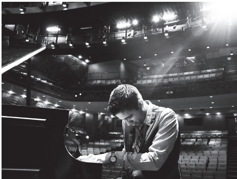
VIJAY IYER

New York-born pianist, composer, and all-around genius Vijay Iyer is currently one of the leading voices in American art music. The MacArthur Fellow and Grammy nominee is known for his clever reworkings of iconic compositions and unexpected use of meter. Iyer is as active in his recording and touring as he is in the scholastic world. Iyer holds a physics and mathematics degree from Yale, which led him in a Ph.D. pursuit at UC Berkeley, where he assembled an interdisciplinary program focusing on music cognition. In 2014, Iyer joined